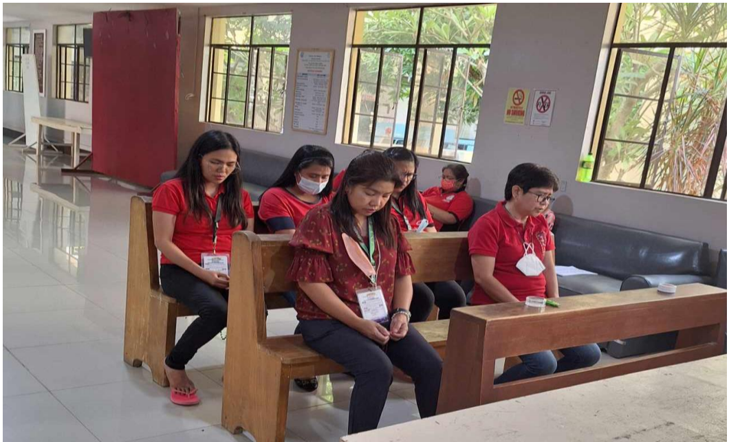
A. Black Rosary every 3:00 p.m. in celebration of the Holy Rosary Month.