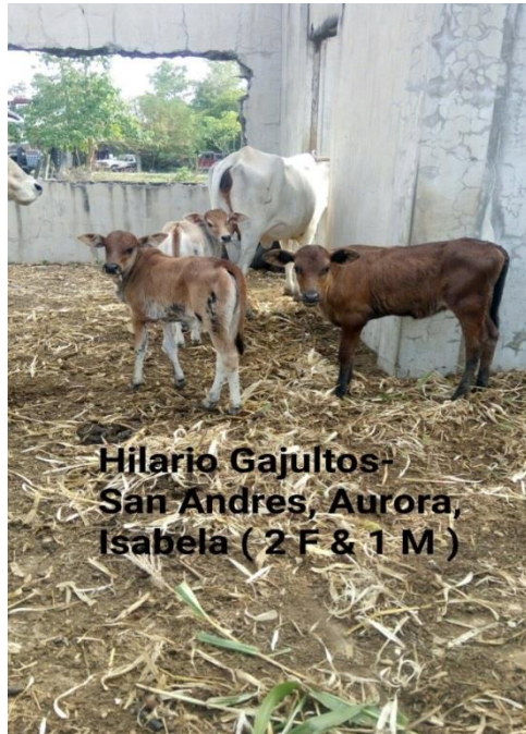
Hilario Gajultos- San Andres, Aurora, Isabela ( 2 F & 1 M )