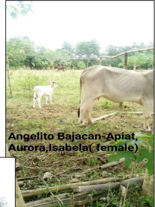
Angelito Bajacan-Apiat, Aurora,Isabela( female)