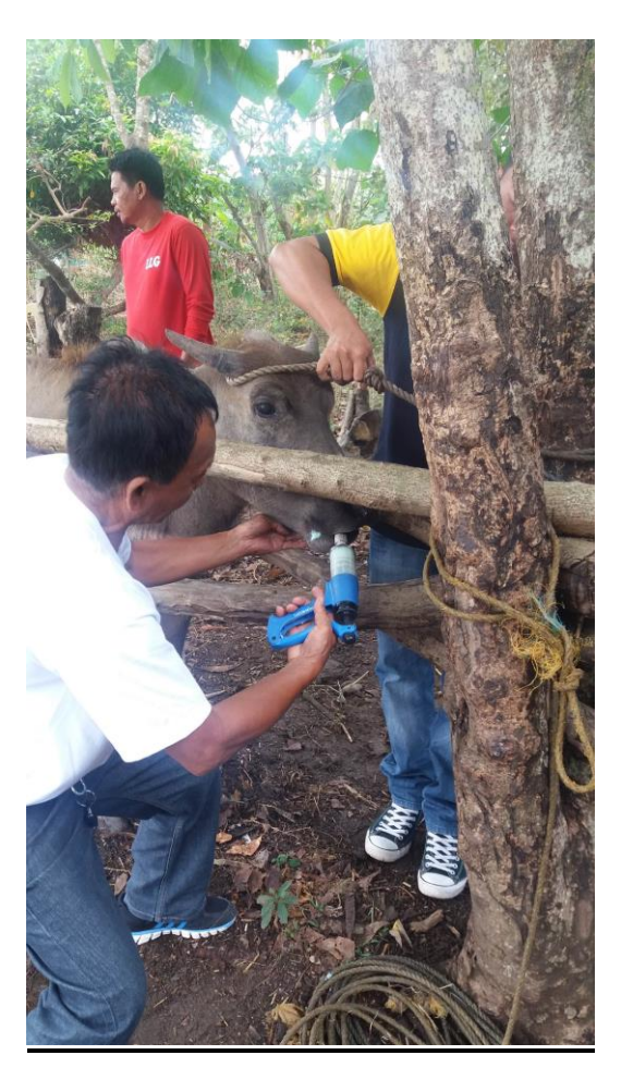
The Technical Staff of the NVSU and PVET Office collect blood and fecal samples in the selected municipalities of the province.