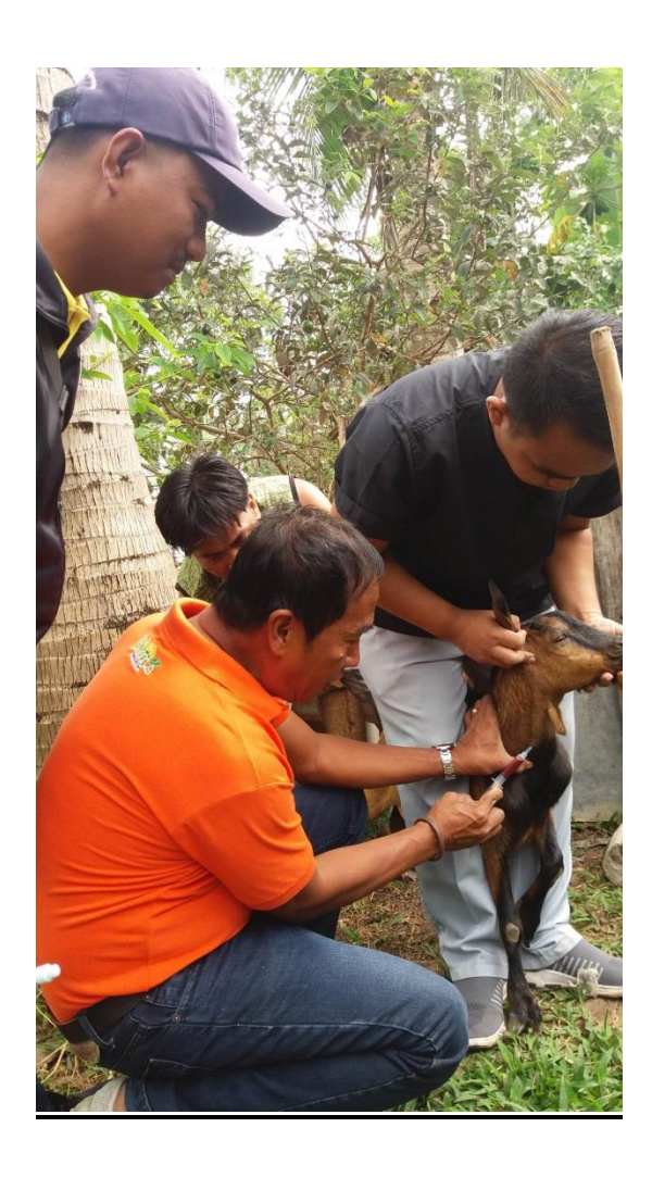
The Technical Staff of the NVSU and PVET Office collect blood and fecal samples in the selected municipalities of the province.