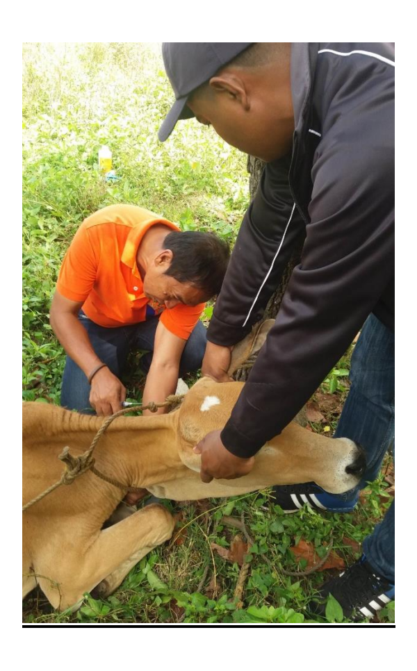
The Technical Staff of the NVSU and PVET Office collect blood and fecal samples in the selected municipalities of the province.