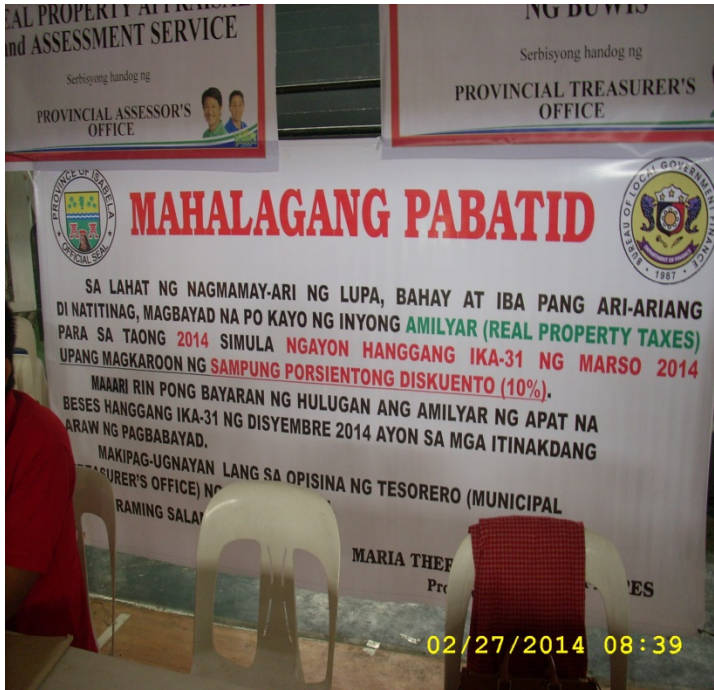
PTO Tarpaulins posted at our assigned booth during the 2014 Farmers’ Congress sa Barangay held at Roxas, Isabela.