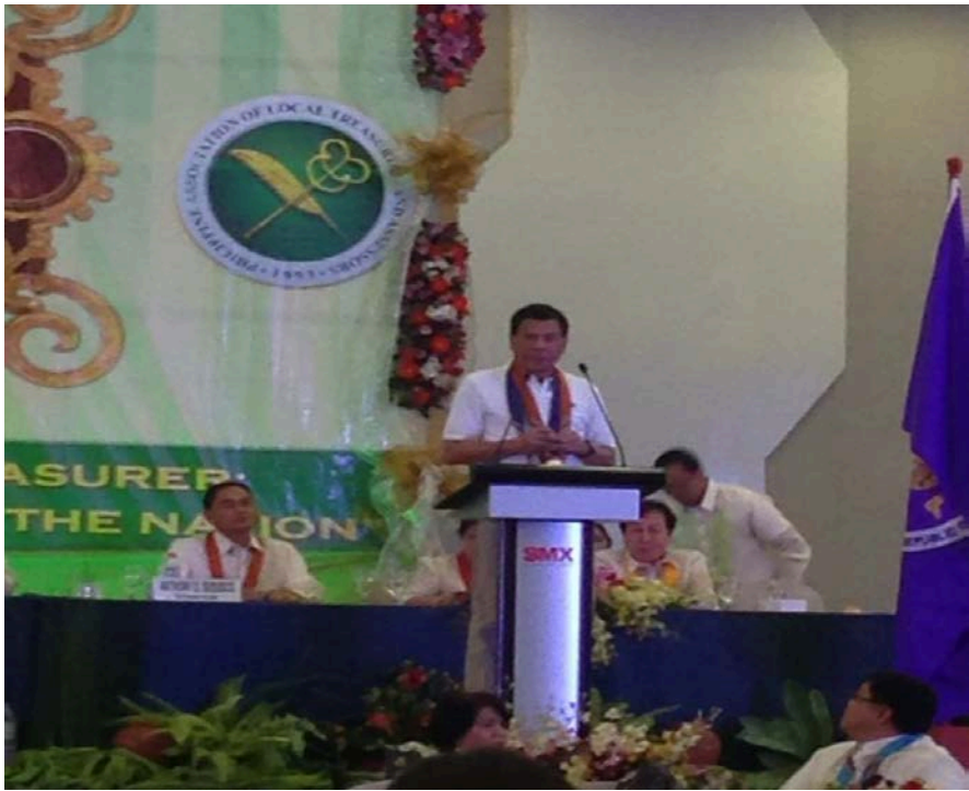
The controversial, yet very charismatic and well-respected Mayor of Davao City, Hon. Rodrigo Duterte delivering his very amusing but relevant message