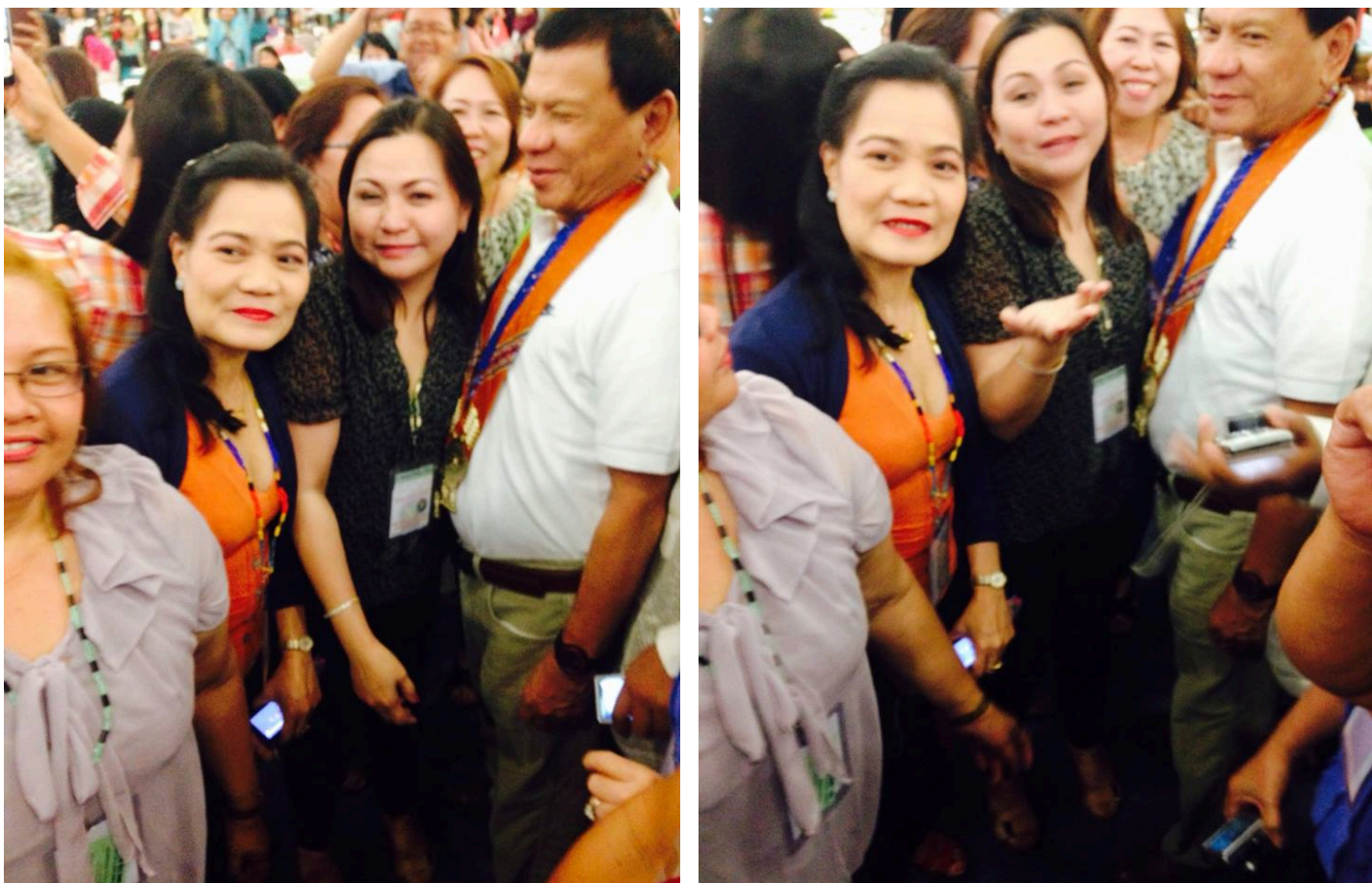
With the Hon. Mayor Rodrigo Duterte of Davao City