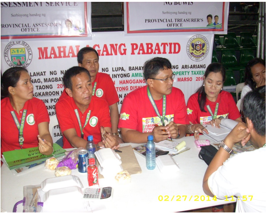
Staff of the Provincial Treasurer’s Office and Provincial Assessor’s Office with the Municipal Treasurer of Roxas attended to clients who have inquiries and those who came to to pay their taxes.