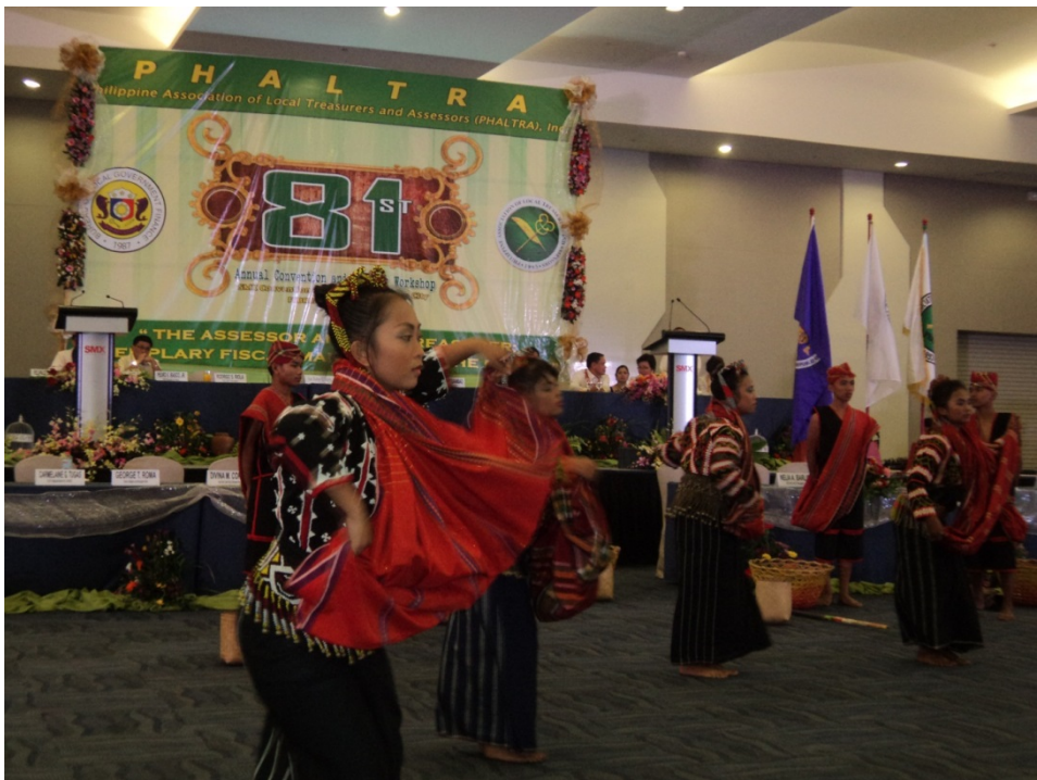
The performance of the T'boli Dance Troupe added color and luster to the 81 st PHALTRA National Convention