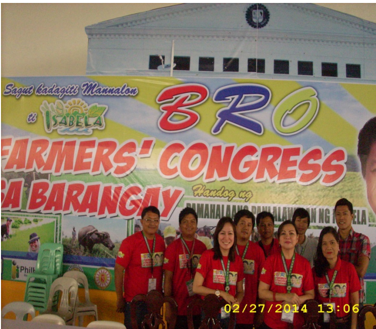
Provincial Treasurer with the PTO Staff in the assigned booth and at the stage of the 2014 Farmers' Congress in Roxas, Isabela