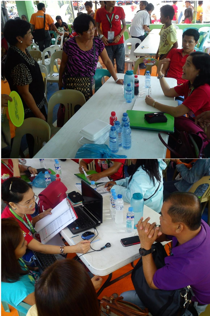
PTO Team attends to clients during the Farmers' Congress sa Barangay in Burgos, Isabela