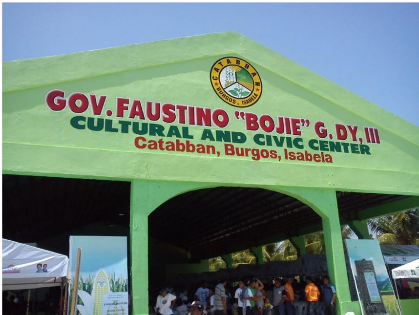
The Venue: Gov. Faustino “Bojie” G. III Cultural and Civic Center, Barangay Catabban, Burgos, Isabela