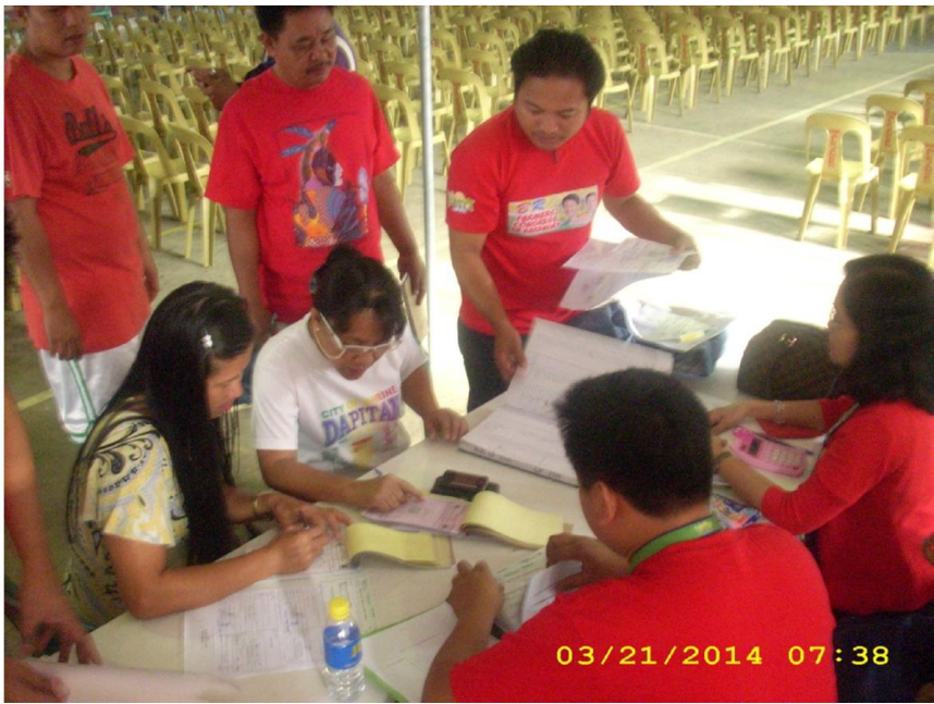
Early birds: First-to-arrive clients attended by the PTO Team during the Congress