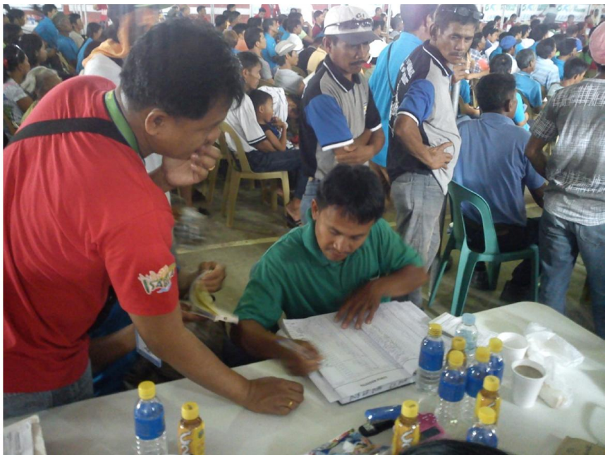
PTO Team attend to clients during the Congress