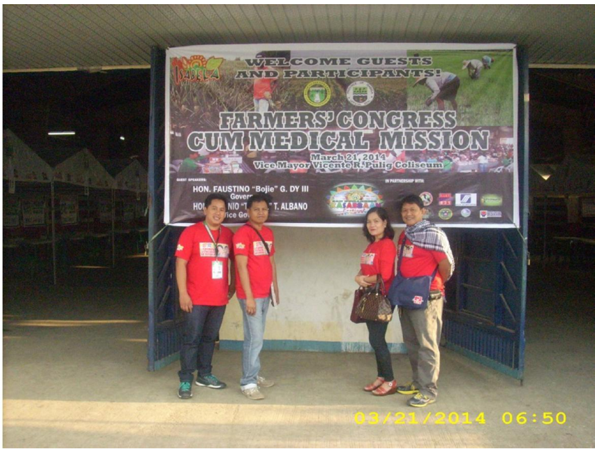
The Venue: Vice Mayor Vicente R. Pulig Coliseum, San Guillermo, Isabela