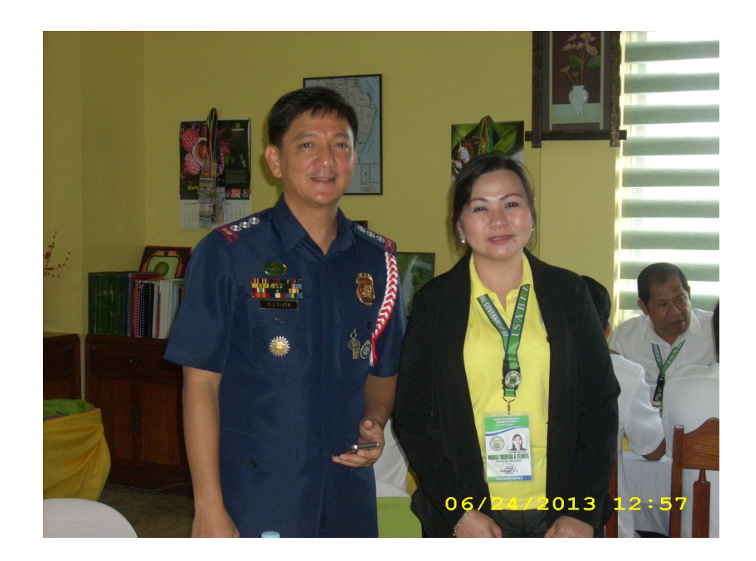
Distribution of Election Supplies and Paraphernalia to Municipal Treasurers