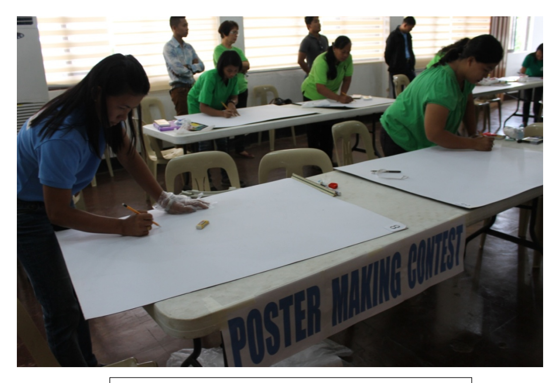
In the left corner.. the poster making contest!