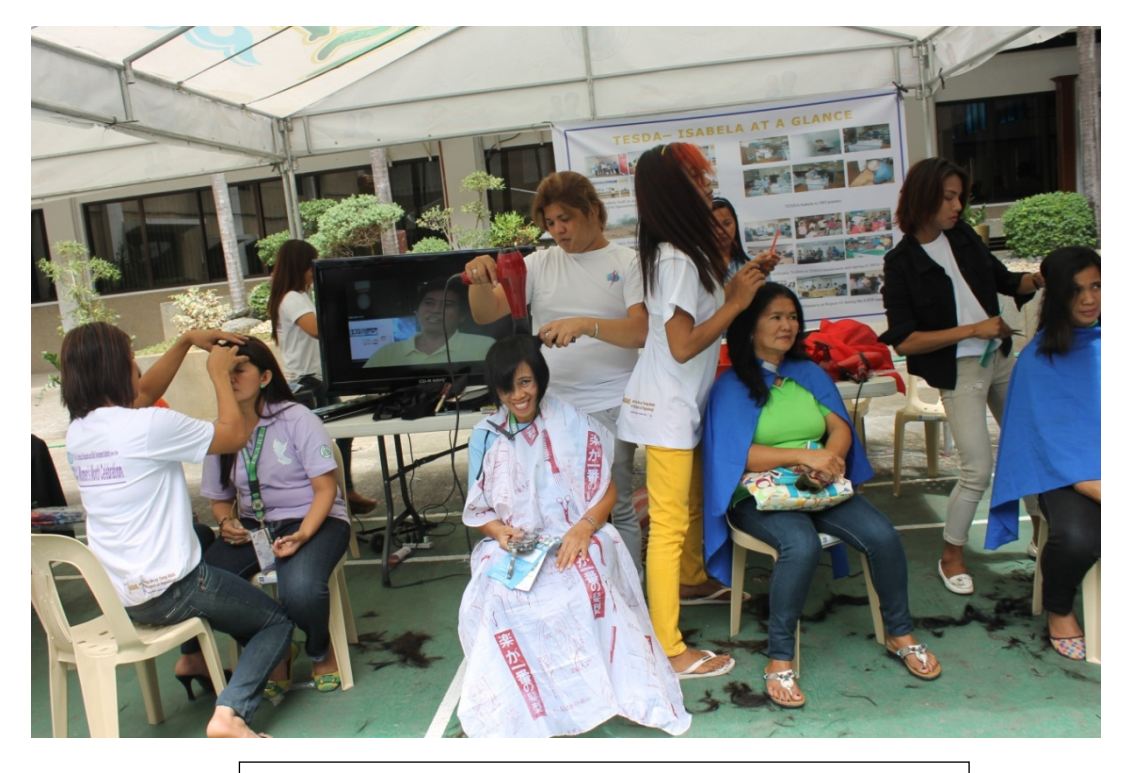
Free hair cutting service courtesy of TESDA