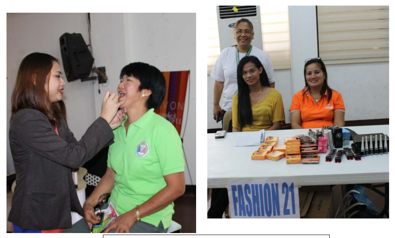
Free makeover from Avon Cosmetics and Fashion 21