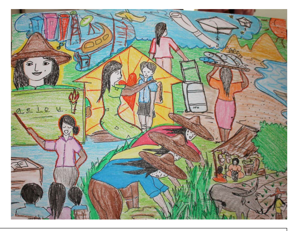
Entry number 13 from the Municipality of Dinapigue, Isabela gets the 3<sup>rd</sup> place.