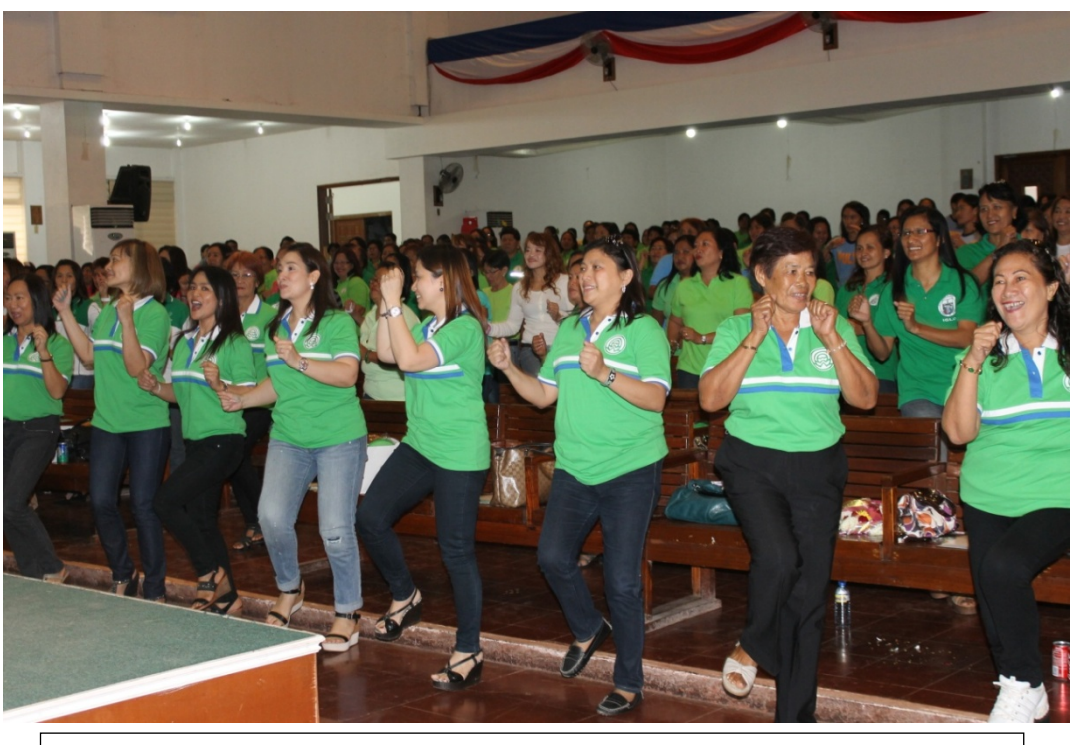
Girls just want to have fun!... Physical Fitness after the Thanksgiving Mass