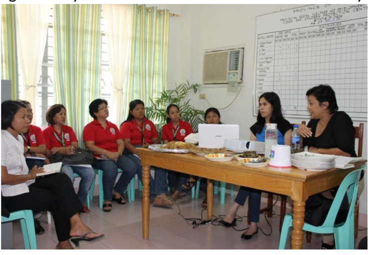
During the orientation on Inter Country Adoption at the PSWD – WCPC Alibagu, City of Ilagan, Isabela

Adoption among social workers of the PSWD Office, WCPC and Lingap Center while on April 29, 2014 as a continuation, social workers of the WCPC and Lingap Center proceeded to Reception and Study Center for Children, Solana, Cagayan for the on-site matching of children subject for intercountry adoption.