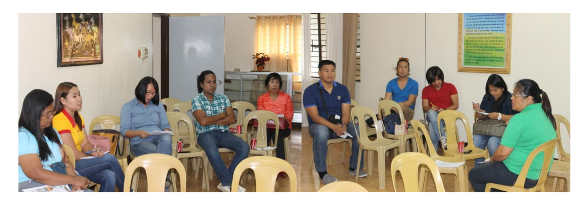
During the PYAP-OSY 1<sup>st</sup> quarter meeting

On April 29, 2014, the PSWD Office conducted the 1<sup>st</sup> quarter Pag-asa Youth Association Program - Out-of-School Youth (PYAP-OSY) meeting among OSY leaders and focal officers provincewide at the Senior Citizens Office, Capitol compound, Alibagu, City of Ilagan, Isabela.