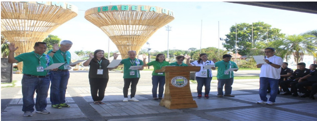
NEWLY ELECTED BOD

ployee-cooperative members. Isabela Governor Faustino G. Dy III also graced said event to the delight of everyone as he also provided additional prizes for the raffle portion of the day's program.