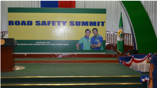
2nd PROVINCIAL ROAD SAFETY SUMMIT

The summit was held at the GFNDY Hall and Ampitheatre last April 4, 2018. Main agenda for the Summit was to discuss existing Road Safety Laws, ordinances and issuances as well as the matter of it's implementation throughout the Province. Discussion with LGU leaders was also in the Agenda to further broaden the reach of the Council on mat-