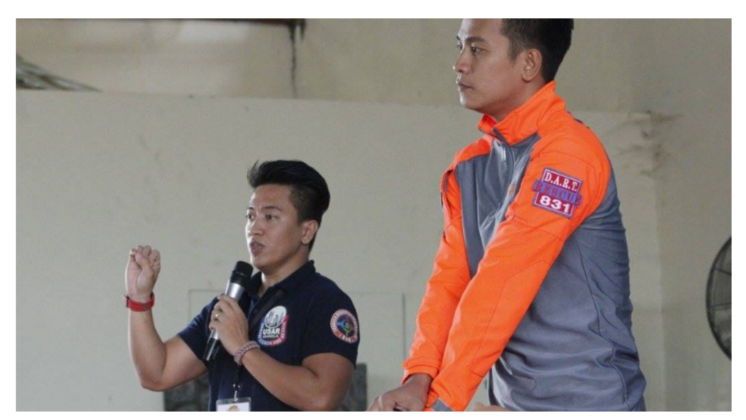
DART 831 PERSONNEL IN ACTION