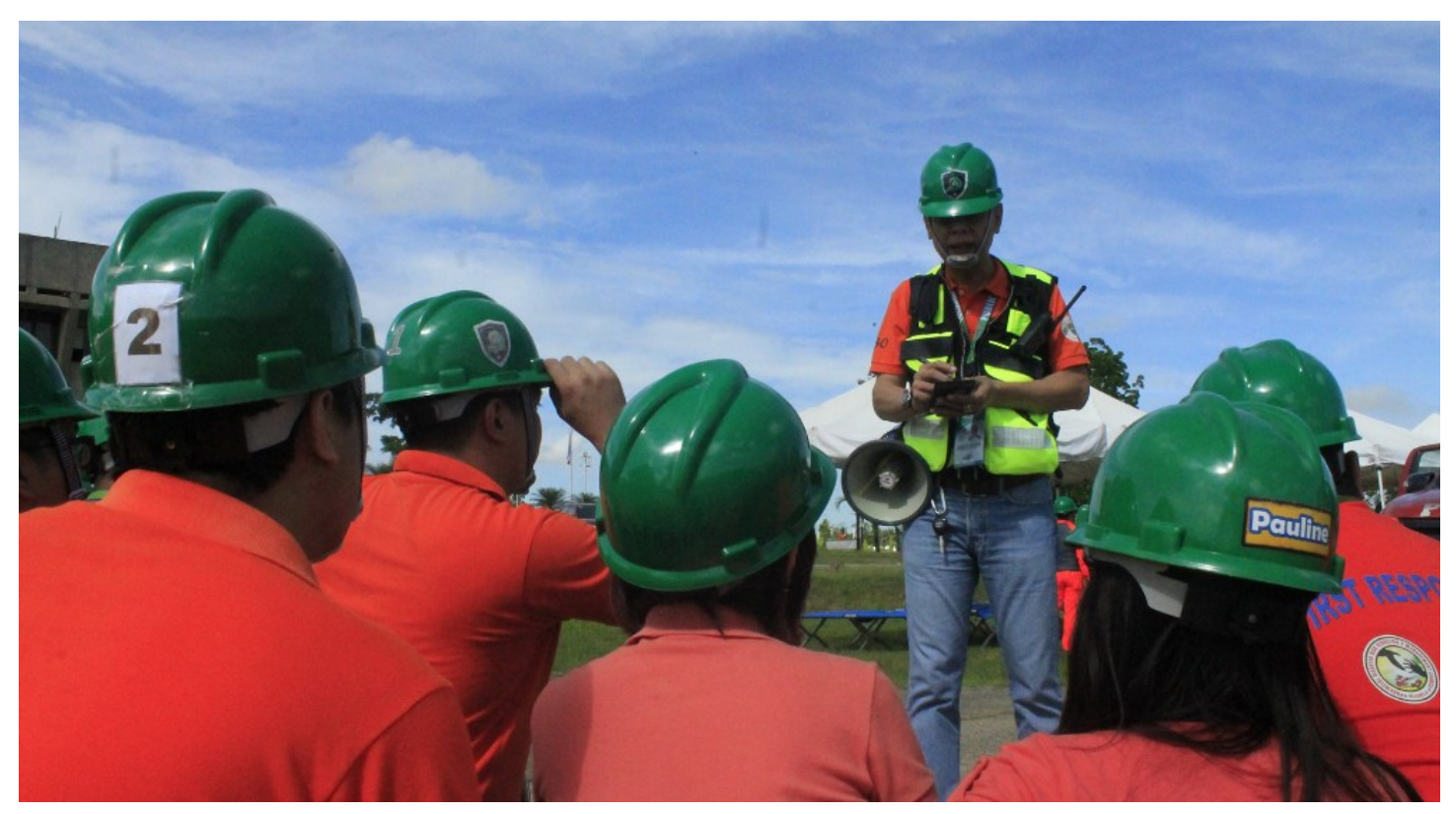
THE 3RD NATIONAL SIMULTANEOUS EARTHQUAKE DRILL WAS CONDUCTED ON ISABELA CAPITOL GROUNDS SEPTEMBER 27, 2017