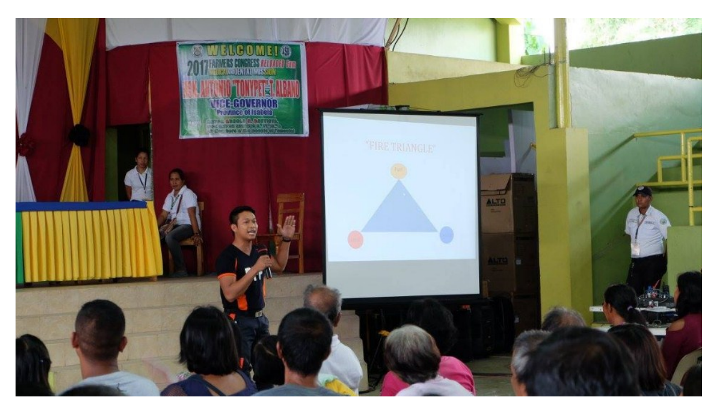
BFP, DART 831 AND PSO PERSONNEL IN ACTION