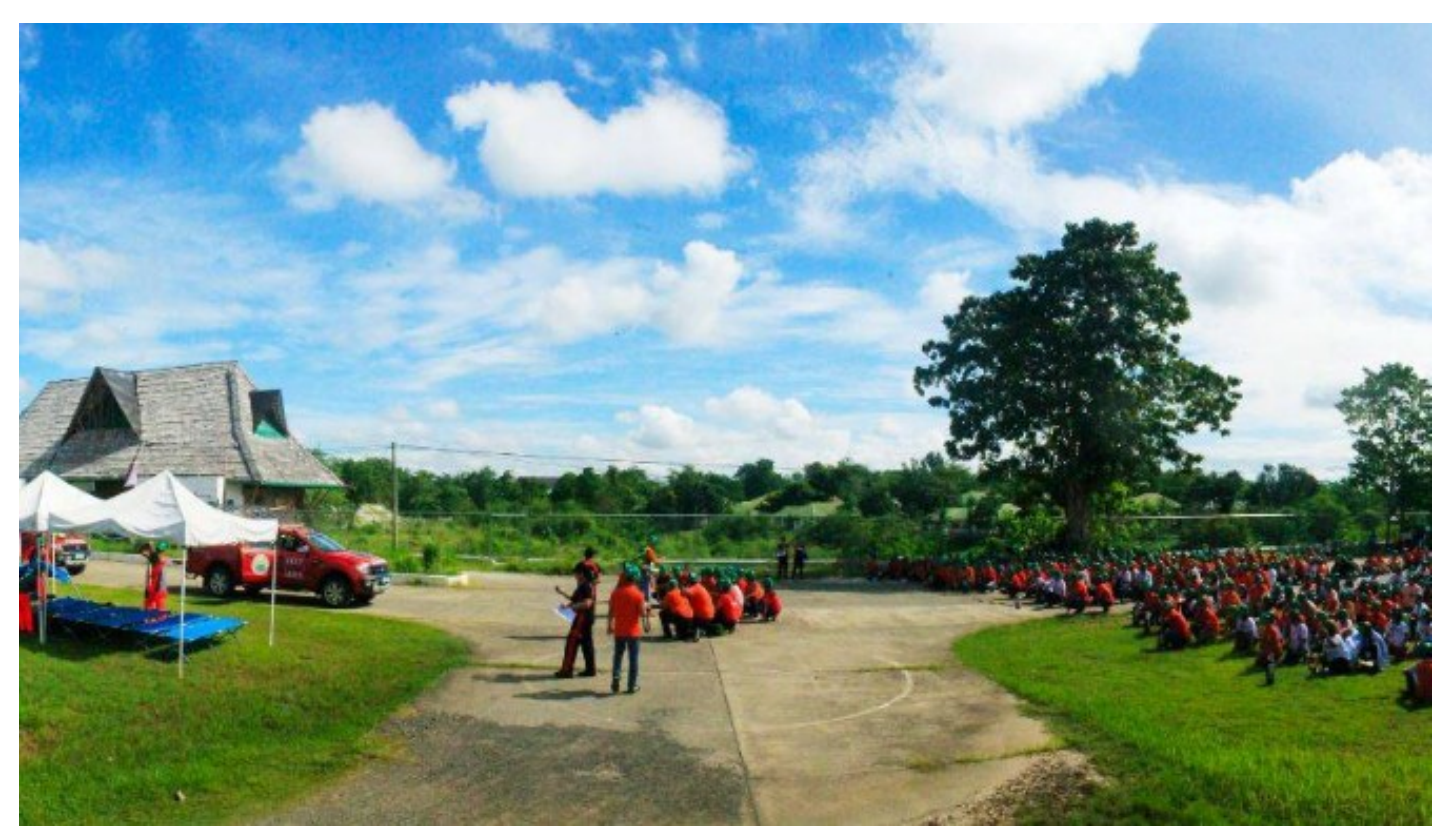
THE 3RD NATIONAL SIMULTANEOUS EARTHQUAKE DRILL WAS CONDUCTED ON ISABELA CAPITOL GROUNDS SEPTEMBER 27, 2017