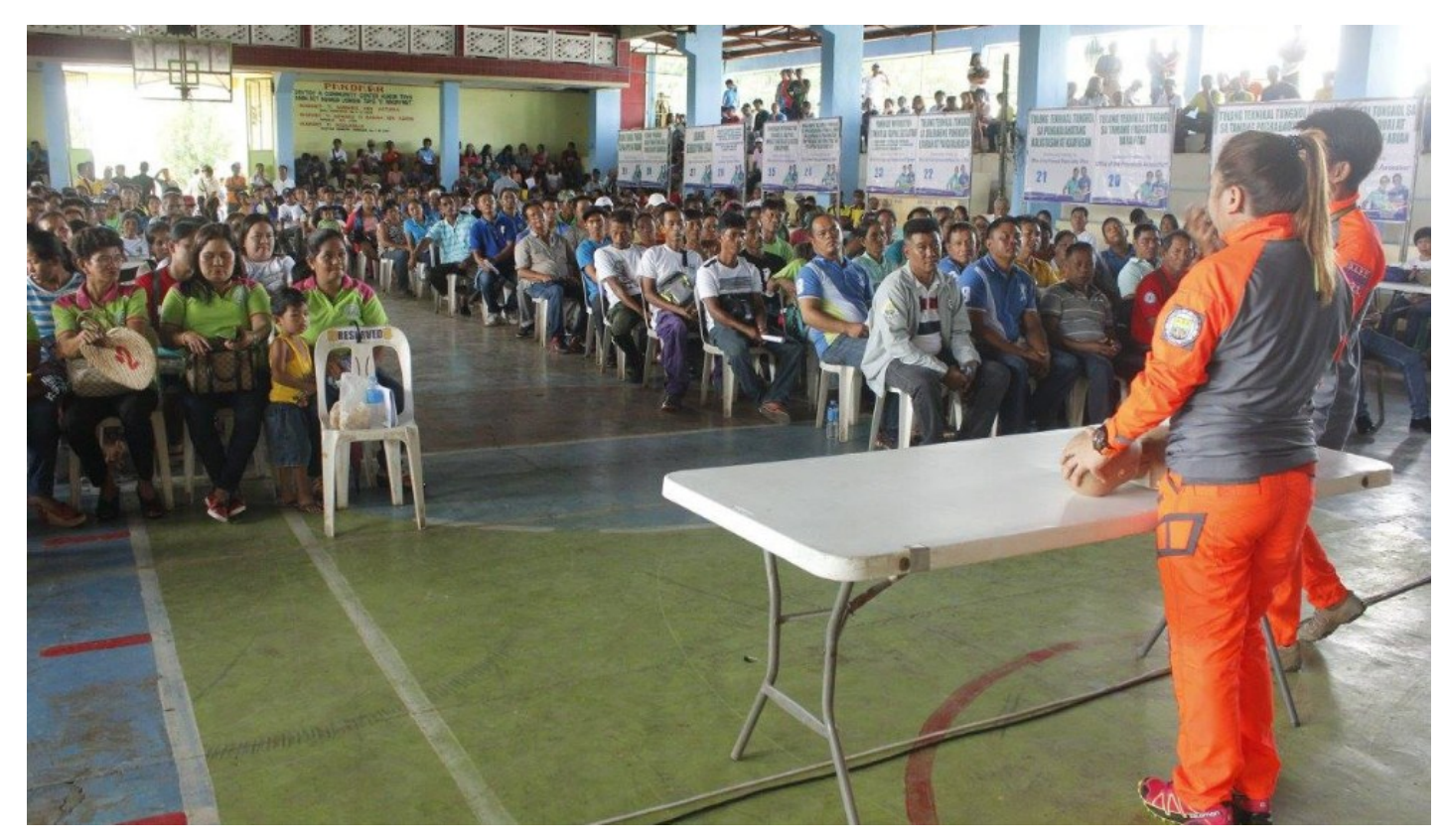
DART 831,BFP AND PSO PERSONNEL IN ACTION