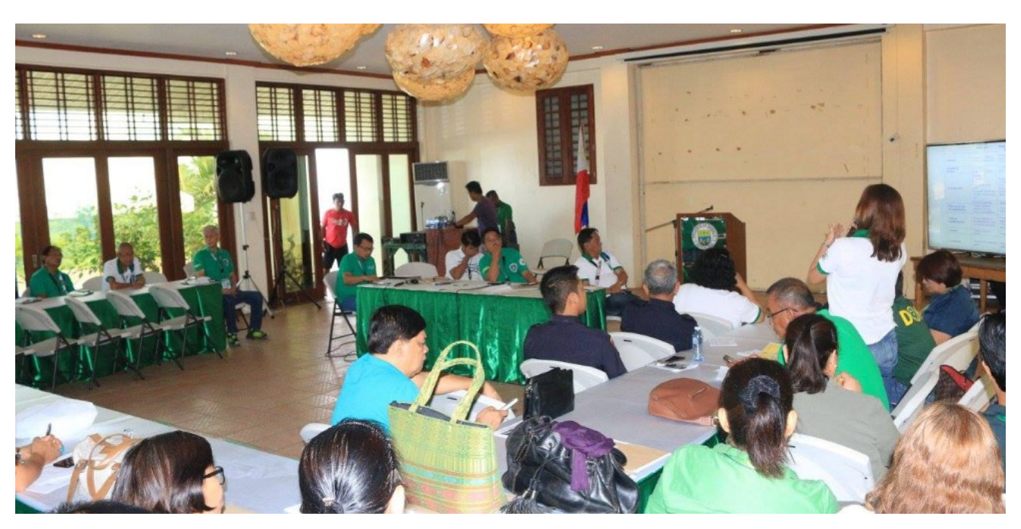
REPRESENTATIVES FROM THE DOH-IPHO DISCUSS THEIR DEPARTMENT'S ACTION PLANS