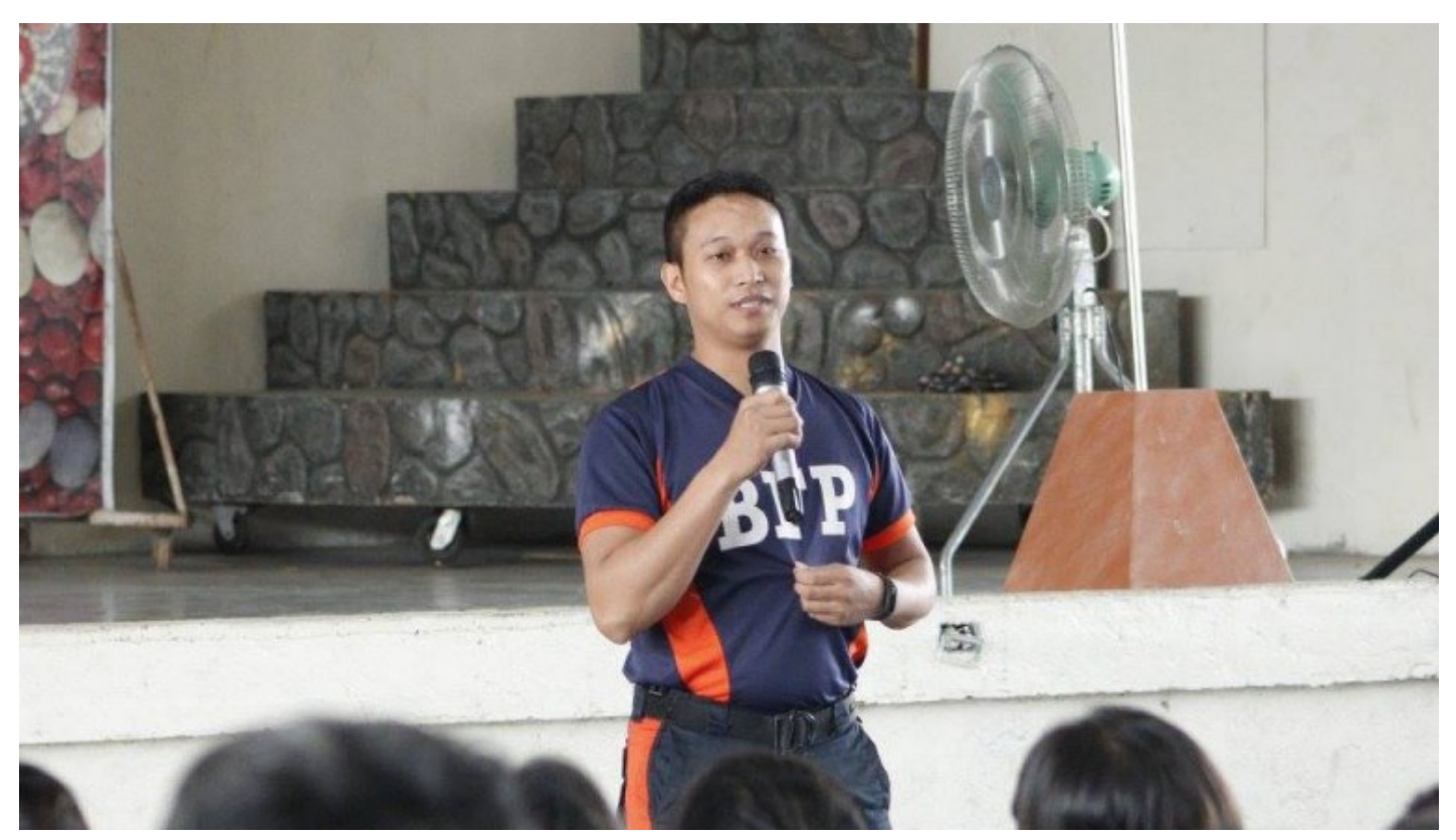
BFP AND PSO PERSONNEL IN ACTION