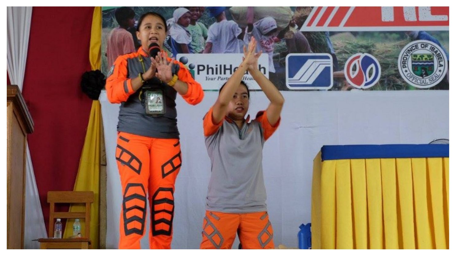
BFP, DART 831 AND PSO PERSONNEL IN ACTION