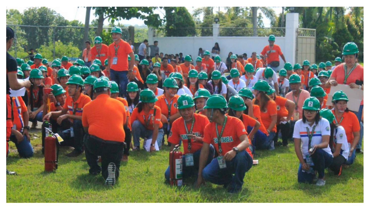
THE 3RD NATIONAL SIMULTANEOUS EARTHQUAKE DRILL WAS CONDUCTED ON ISABELA CAPITOL GROUNDS SEPTEMBER 27, 2017