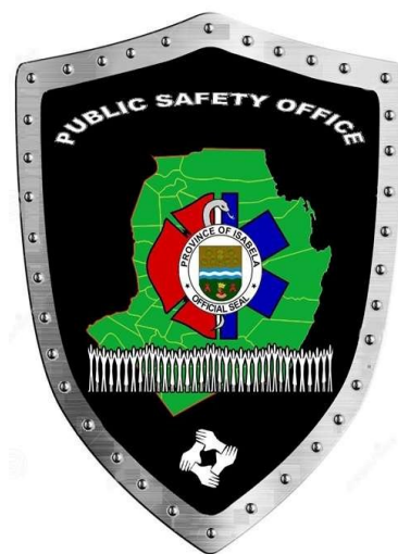
ISABELA PROVINCIAL PUBLIC SAFETY OFFICE

The Office, tasked to facilitate and monitor the planning and operations of the PNP-PDRRMC Quick Response Motorcycle Riders, by virtue of Executive Order #18, series of 2014 continues to work with various Government agencies such as the Land Transportation Office, Highway Patrol Group, and the Philippine National Police to craft countermeasures against Road Safety Hazards by spreading awareness and the enforcement of existing Philippine Road Safety Laws thru our deputized Law Enforcement Operatives. As part of it's continuous education for LEO's (Law Enforcement Operatives), seminars are being conducted to make certain that new Laws such are explained in detail to ensure understanding of it's implementing rules and regulations and for LEO's to fully observe the same during operations.