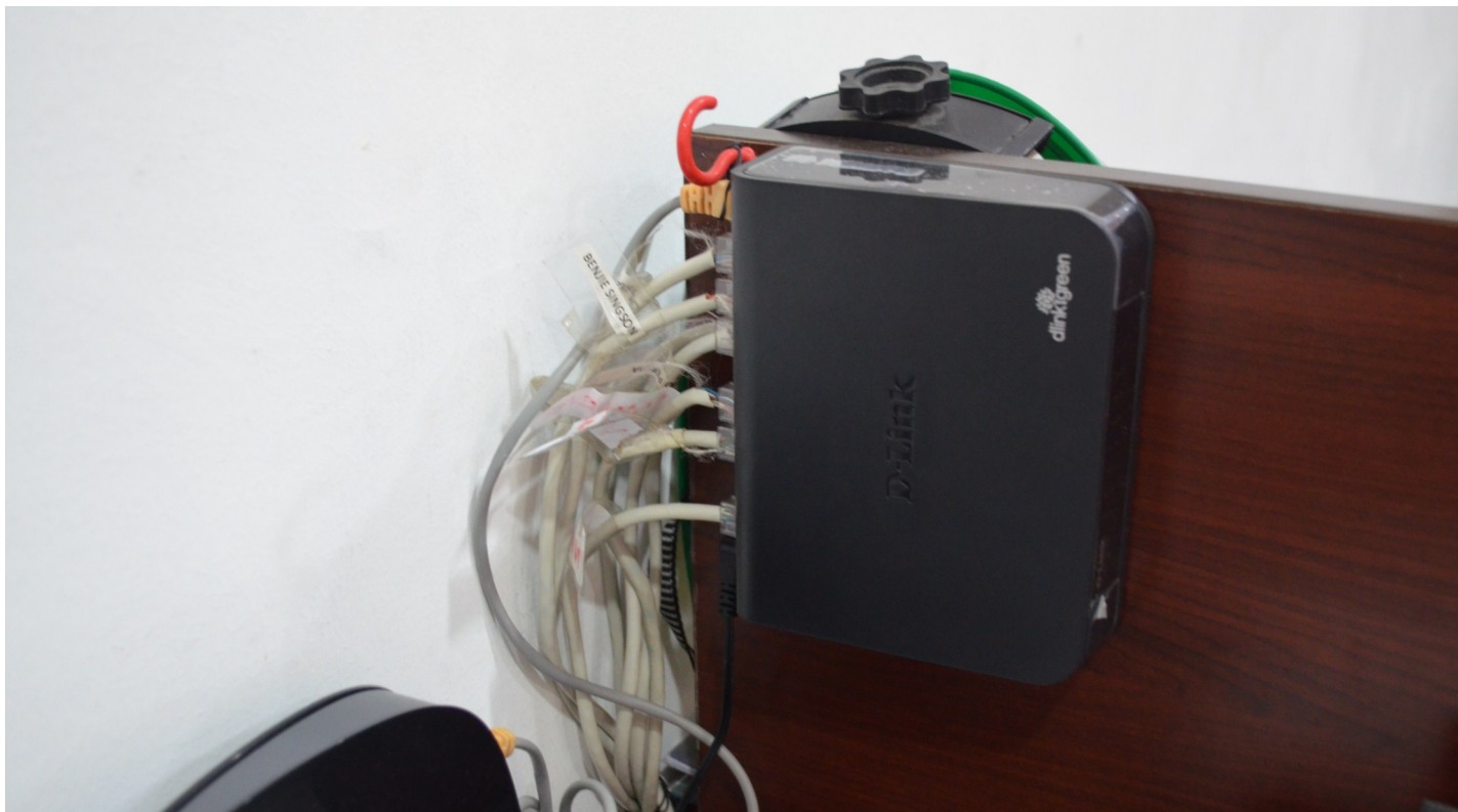
PSO AND PSG PERSONNEL CONDUCTS RE-WIRING AND INSTALLATION OF ETHERNET HUB TO IMPROVE NETWORK CONNECTIVITY