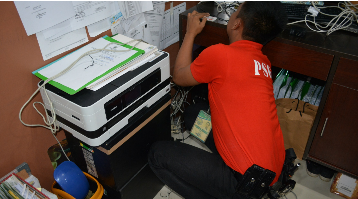
PSO AND PSG PERSONNEL CONDUCTS RE-WIRING AND INSTALLATION OF ETHERNET HUB TO IMPROVE NETWORK CONNECTIVITY