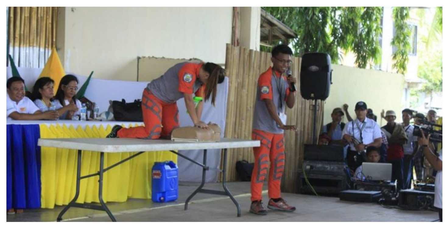
DART 831 AND BUREAU OF FIRE PROTECTION COUNTERPARTS IN ACTION DURING THE FARMERS CONGRESS HELD AT BENITO SOLIVEN, ISABELA