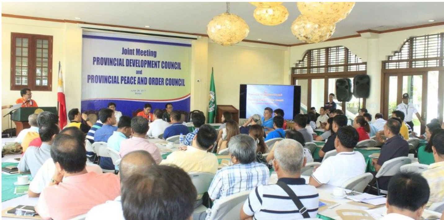
GOVERNOR FAUSTINO “BOJIE” G. DY III LEADS THE PDC AND PPOC 2ND QUARTER JOINT MEETING HELD AT BALAI CONFERENCE HALL, ISABELA PROVINCIAL CAPITOL GROUNDS, CITY OF ILAGAN, ISABELA