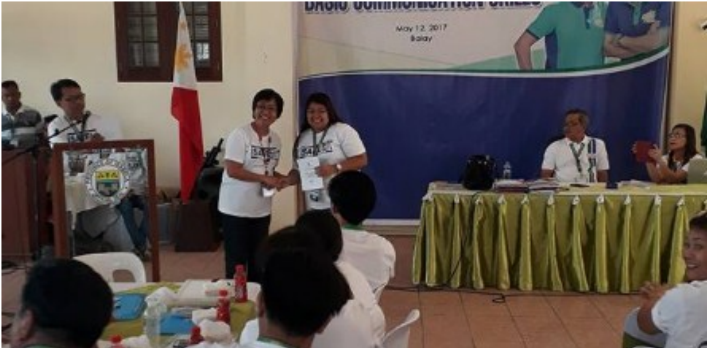
PSO PERSONNEL ATTENDS PGI INITIATED TRAINING FOR PROVINCIAL EMPLOYEES