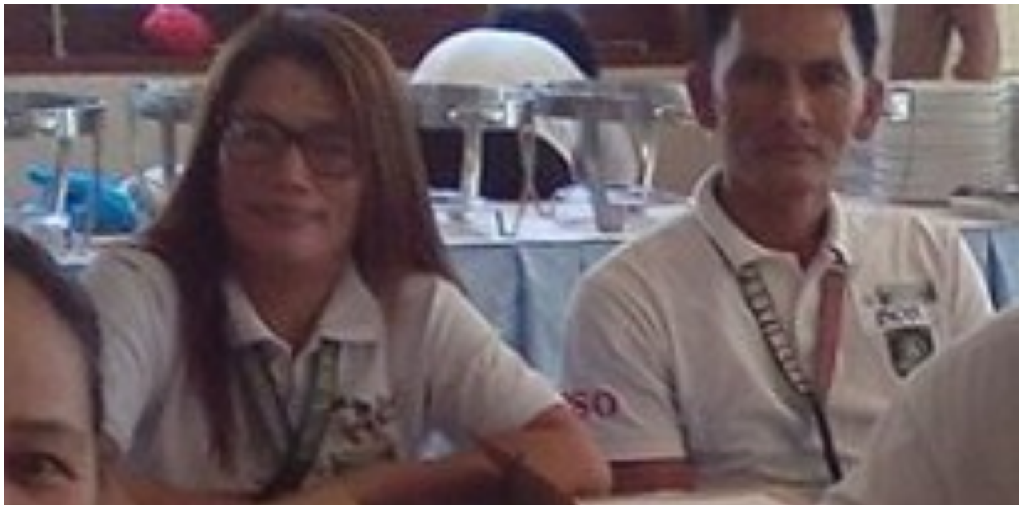
PSO PERSONNEL ATTENDS PGI INITIATED TRAINING FOR PROVINCIAL EMPLOYEES