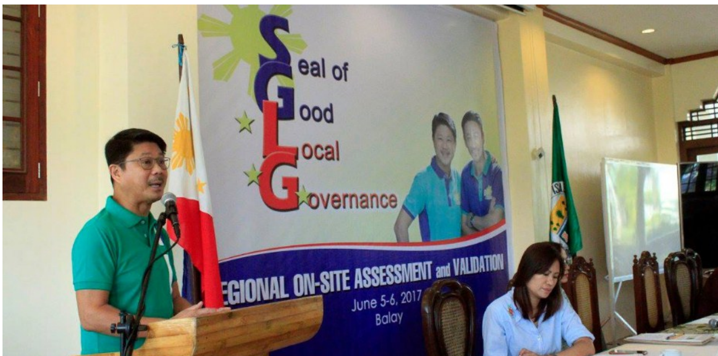
GOVERNOR FAUSTINO "BOGIE" G. DY III DELIVERS HIS MESSAGE DURING THE SEAL OF GOOD LOCAL GOVERNANCE REGIONAL ON-SITE ASSESSMENT AND VALIDATION MEETING