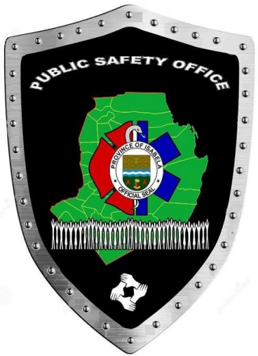
ISABELA PROVINCIAL PUBLIC SAFETY OFFICE

The Office, tasked to facilitate and monitor the planning and operations of the PNP-PDRPMC Quick Response Motorcycle Riders, by virtue of Executive Order #18, series of 2014 continues to work with various Government agencies such as the Land Transportation Office, Highway Patrol Group, and the Philippine National Police to craft counter-measures against Road Safety Hazards by spreading awareness and the enforcement of existing Philippine Road Safety Laws thru our deputized Law Enforcement Operatives. As part of it's continuous education for LEO's (Law Enforcement Operatives), seminars are being conducted to make certain that new Laws such as RA 10913 otherwise known as the Anti-Distracted Driving Act are explained in detail to ensure understanding of it's implementing rules and regulations and for LEO's to fully observe the same during operations.