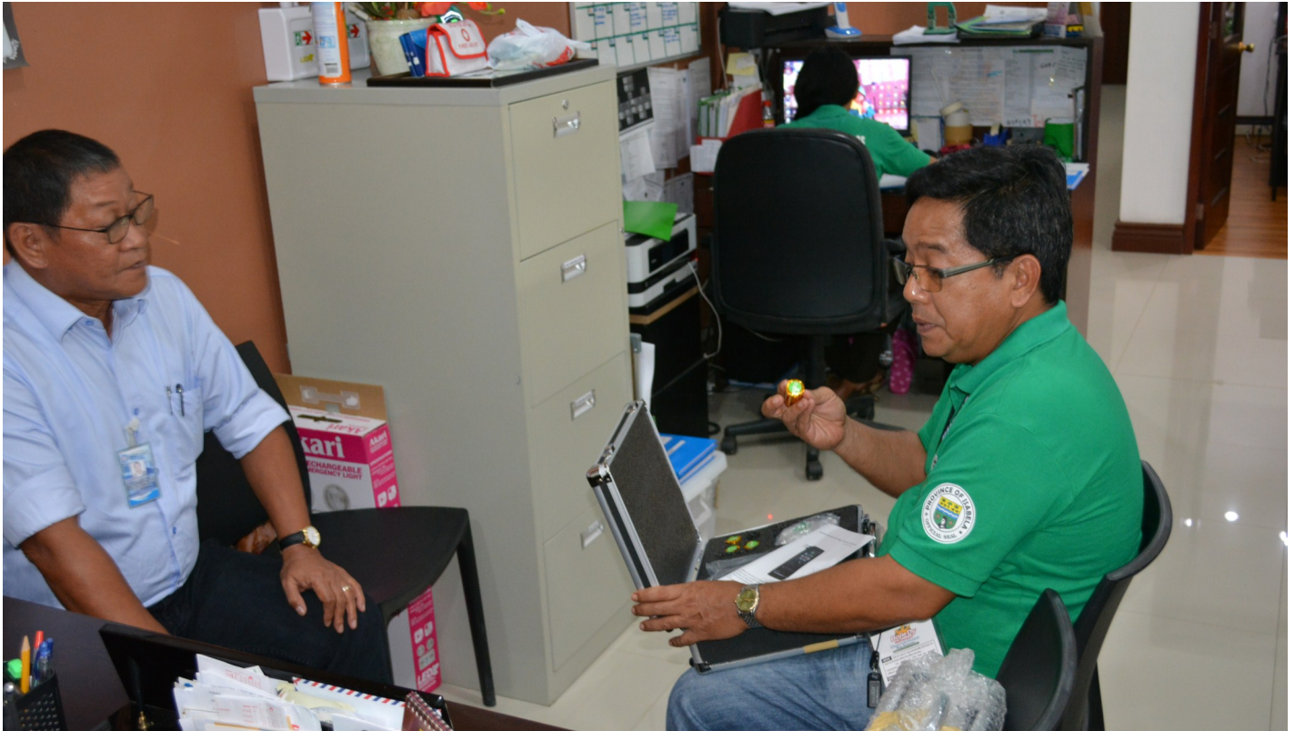
LTO ILAGAN CHIEF TURNS OVER 1 UNIT ALCOHOLIC BREATH ANALYZER TO PUBLIC SAFETY OFFICE