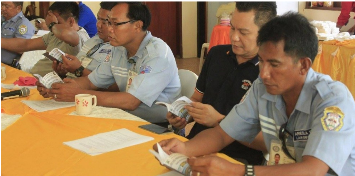
ROAD SAFETY LAW ENFORCEMENT OPERATIVES PERUSE THE PSO LAWS AND ORDINANCES HANDBOOK, A PROJECT INITIATED BY THE PUBLIC SAFETY OFFICE ROAD SAFETY PROGRAM