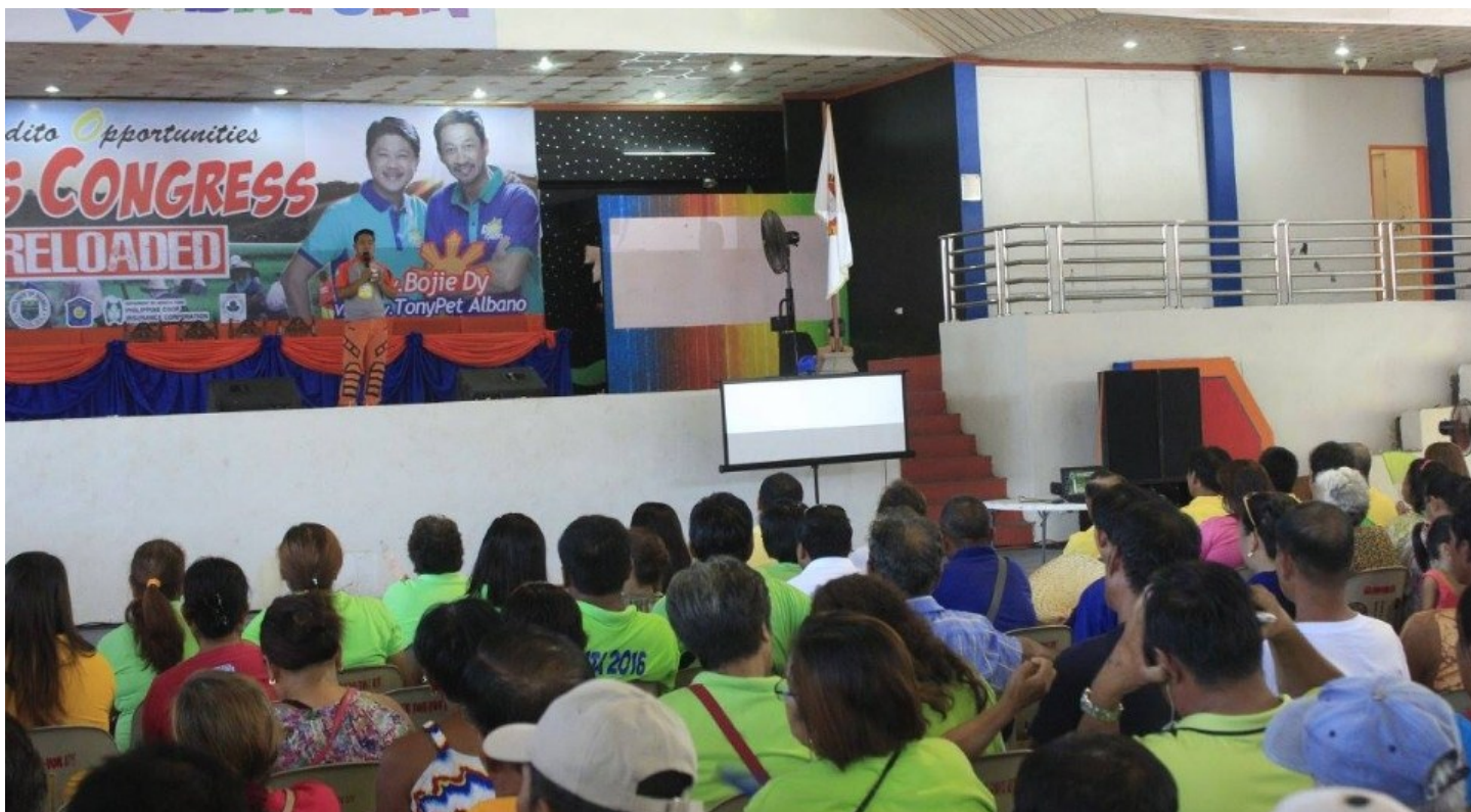
DART 831 AND BFP PERSONNEL IN ACTION