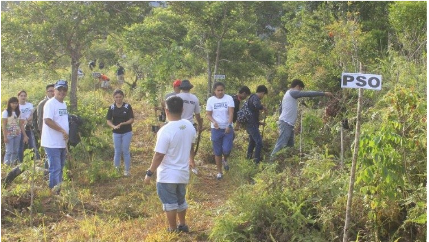
ISABELA PROVINCIAL ADMINISTRATOR, ATTY NOEL MANUEL R. LOPEZ LED THE CAPITOL CONTINGENT DURING THE TREE PLANTING CEREMONY HELD IN CELEBRATION OF THE DISASTER PREPAREDNESS MONTH