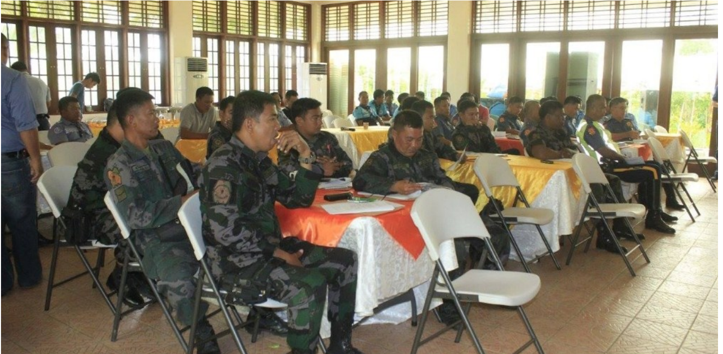
ROAD SAFETY LAW ENFORCEMENT OPERATIVES IN ATTENDANCE DURING THE SEMINAR/WORKSHOP