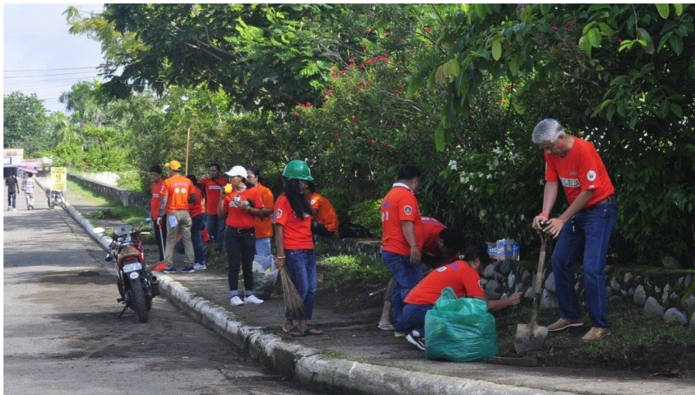
THE PUBLIC SAFETY OFFICE, TOGETHER WITH DESIGNATED SAFETY OFFICERS FROM ALL DEPARTMENTS JOINED THE CLEAN-UP ACTIVITIES WITHIN CAPITOL GROUNDS