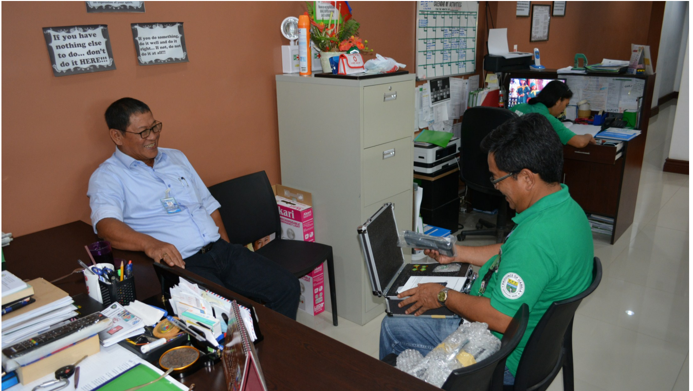
LTO ILAGAN CHIEF TURNS OVER 1 UNIT ALCOHOLIC BREATH ANALYZER TO PUBLIC SAFETY OFFICE