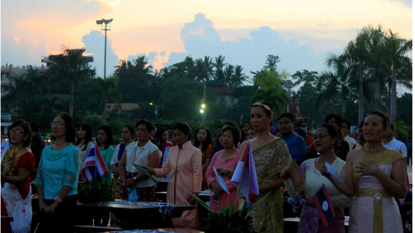
ISABELEÑOS CELEBRATE ASEAN'S 50TH ANNIVERSARY BY WEARING DIFFERENT SOUTH EAST ASIAN COSTUMES