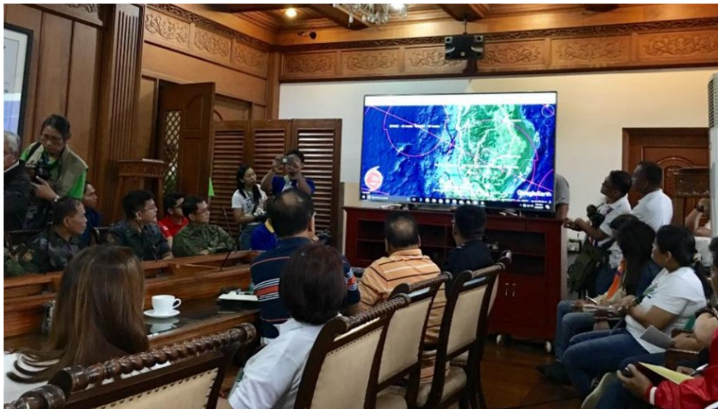
ACTION PICTURES DURING THE PDRPMC EMERGENCY MEETING IN PREPARATION FOR TS JOLINA HELD AT GOVERNOR'S CONFERENCE HALL, CAPITOL BUILDING, ILAGAN, ISABELA