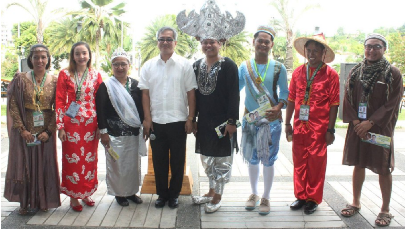
PGI EMPLOYEES WEARING DIFFERENT TYPES OF ASEAN COSTUMES EVERY 1ST MONDAY OF THE MONTH TO COMMEMORATE ASEAN'S 50TH ANNIVERSARY CELEBRATION