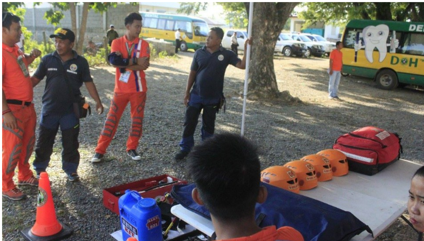
DART 831, PIO AND PSO PERSONNEL IN ACTION