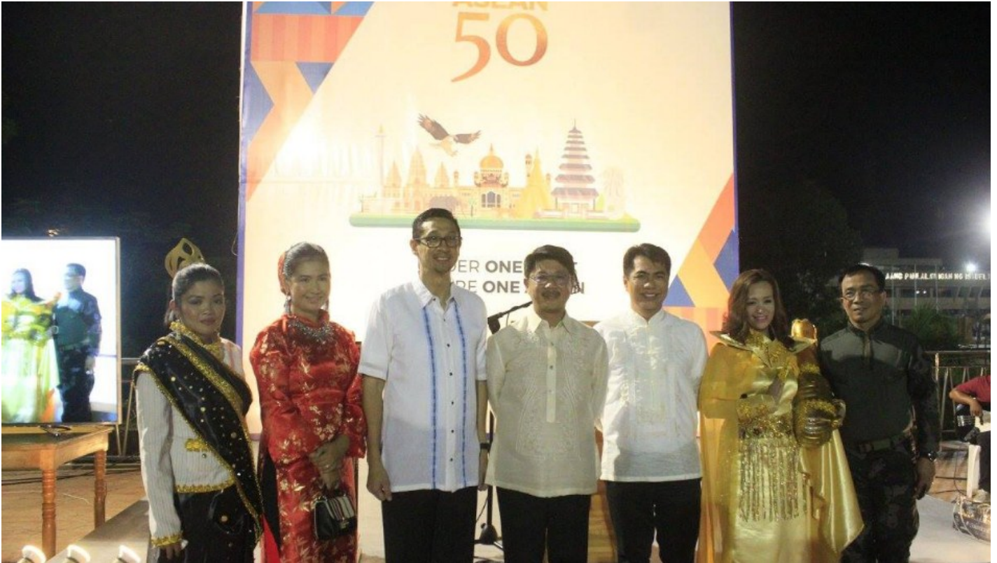
ACTION PICTURES DURING THE ASEAN LANTERN LIGHTING CEREMONY HELD AT THE QUEEN ISABELA PARK, CAPITOL GROUNDS, CITY OF ILAGAN, ISABELA