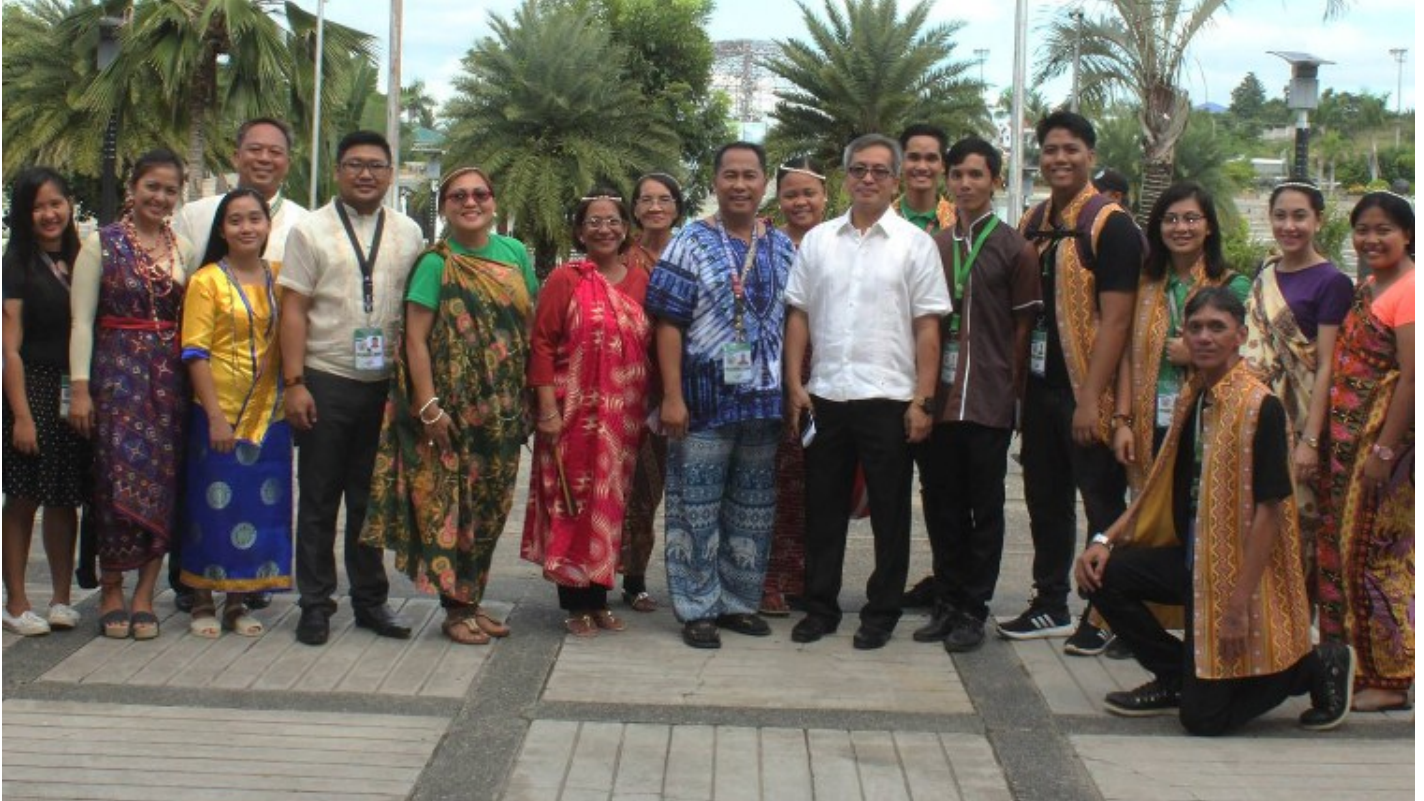
PGI EMPLOYEES WEARING DIFFERENT TYPES OF ASEAN COSTUMES EVERY 1ST MONDAY OF THE MONTH TO COMMEMORATE ASEAN'S 50TH ANNIVERSARY CELEBRATION