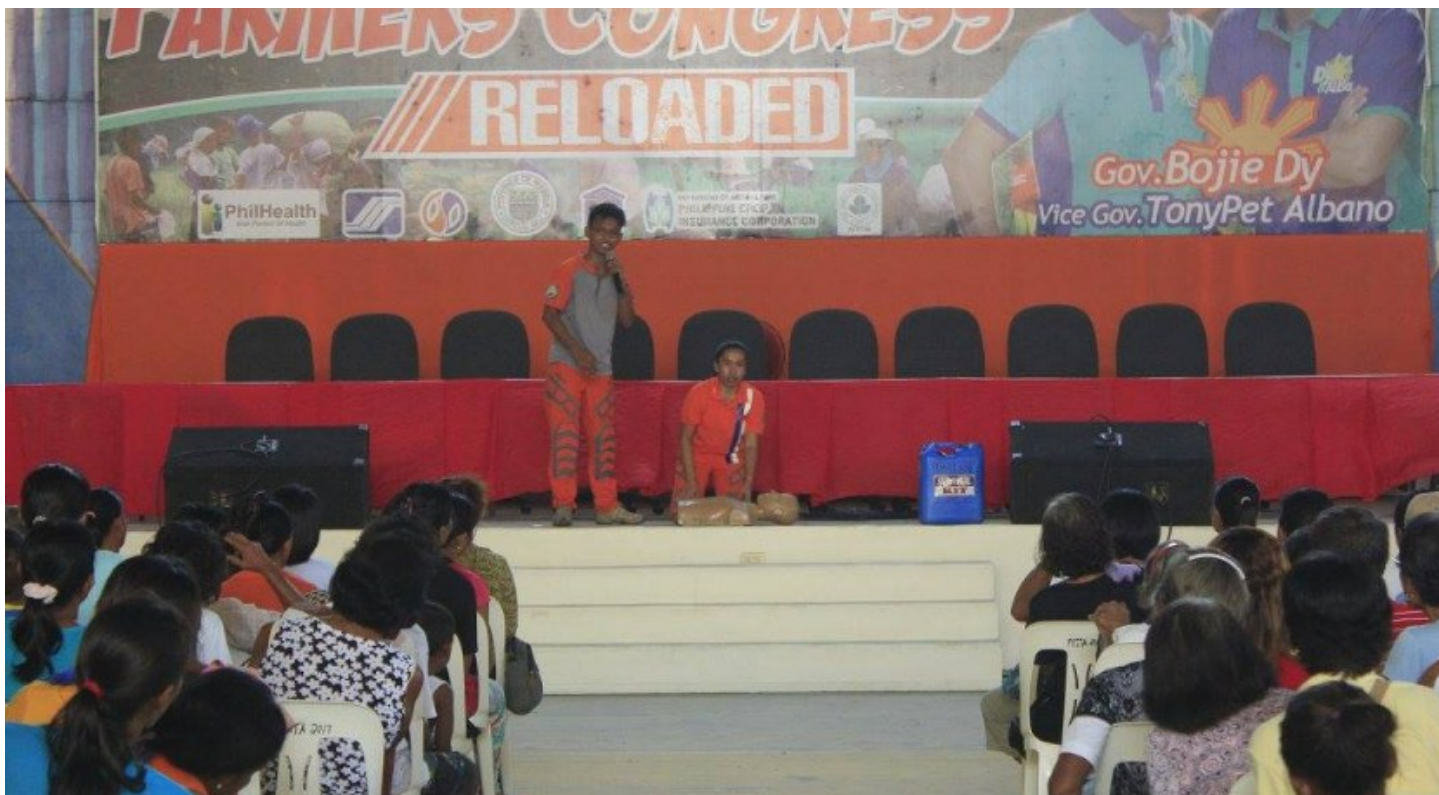
DART 831 AND BFP ERSONNEL IN ACTION