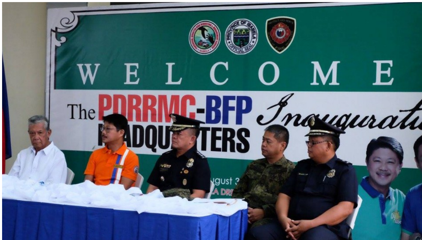
ISABELA GOVERNOR FAUSTINO “BOJIE” G. DY III DURING THE INAUGURATION OF THE PDRRMC-BFP HEADQUARTERS ATTENDED BY THE PSO LEADERSHIP AND STAFF WHEREIN THE GOVERNOR ANNOUNCED HIS VISION TO CONSTRUCT A DISASTER PREPAREDNESS COMPLEX HE SUBSEQUENTLY NAMED THE ISABELA-DRRM COMPLEX WHICH WILL ALSO HOUSE THE OFFICES OF THE PUBLIC SAFETY OFFICE, PROVINCIAL SOCIAL WELFARE AND DEVELOPMENT OFFICE AND A COMMAND CENTER FOR THE PDRRMC