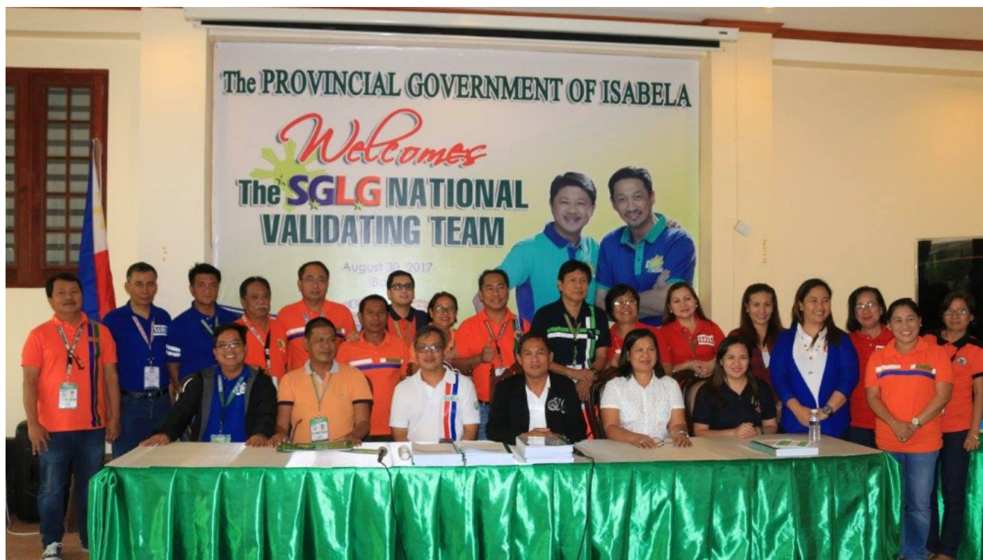
PGI DEPARTMENT HEADS WELCOME THE SGLG - “SEAL OF GOOD LOCAL GOVERNANCE” NATIONAL VALIDATING TEAM FOR THE ON-SITE ASSESSMENT CONDUCTED AT THE BALAI CONFERENCE HALL, ISABELA PROVINCIAL CAPITOL