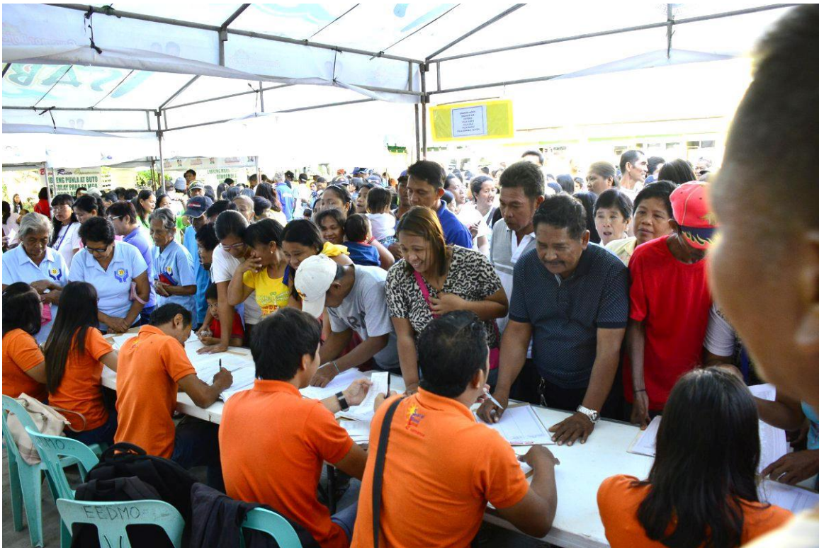
RDC 2 – Social Development Committee (SDC) 102 nd Regular Business Meeting 16 March 2018