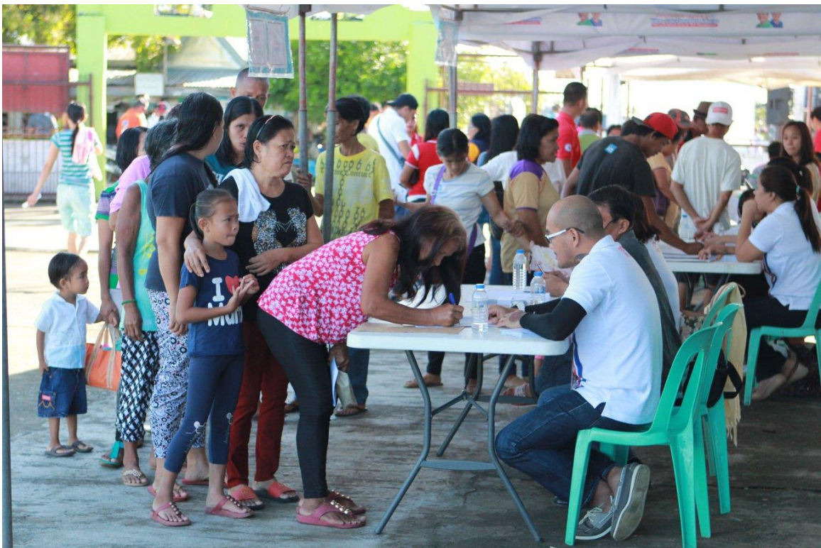
Comprehensive Land Use Plan (CLUP) Review of Cabatuan, Isabela 3 March 2018