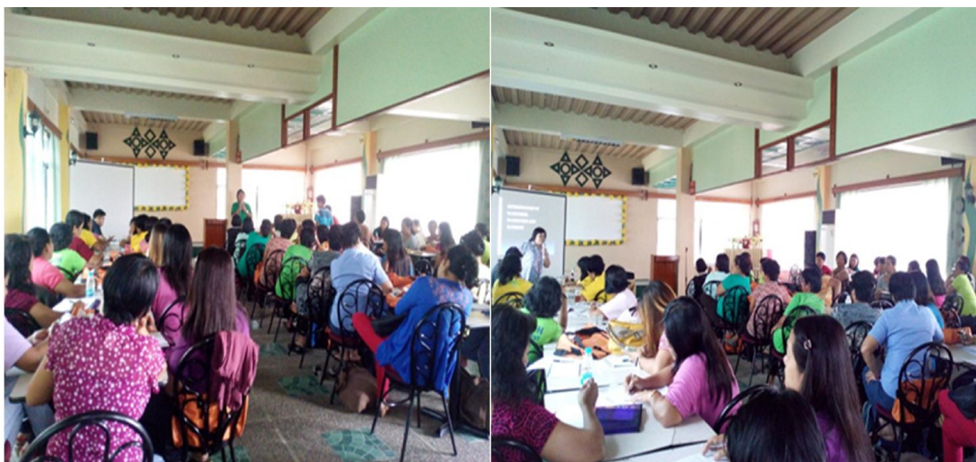
The NTP Nurse and Med. Tech coordinators as they lectured on Basic facts about Tuberculosis and the roles of BHWs as treatment partners

The Case finding activity shall start simultaneously once the training in other provinces of Region 2 is completed. This initiative is expected to create motivation and enthusiasm among Barangay Health Workers who participated in the activity in the coming years.