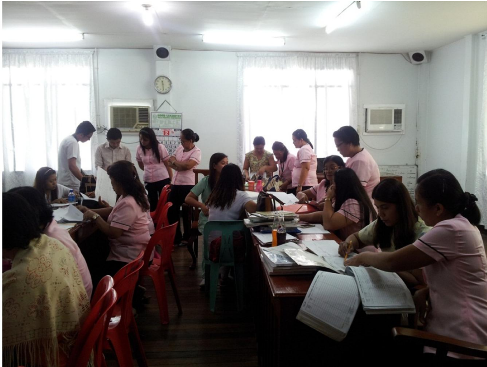
The PHO team with the midwives of San Mateo, Isabela while reviewing their TCLs during the DQC activity conducted last March 4-6, 2014.