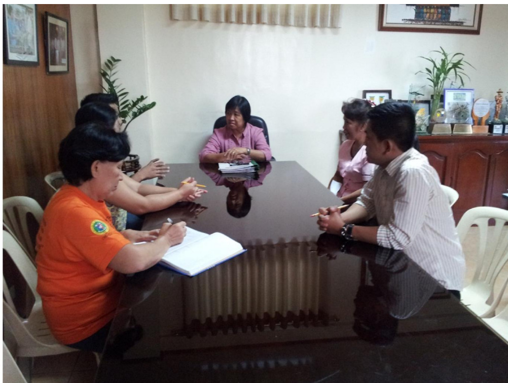
Courtesy call with the Municipal Mayor, Hon. Crispina R. Agcaoili together with the IPHO team and Representative from Luzon Health. Mayor Agcaoili emphasized that health is one of her program priorities.