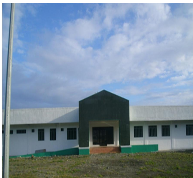
The new Dinapigue Community Hospital was conceptualized thru HFEP and the preparation of plans was undertaken by the Province of Isabela thru the Provincial Engineering Office. The construction started last June 2012 and completed January 2014.