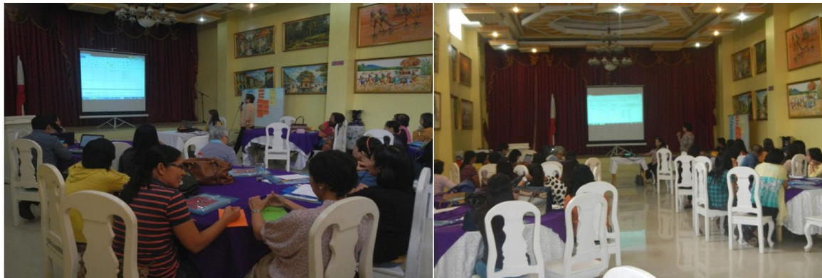
The participants are preparing for the presentation of their Laboratory plan to the group.