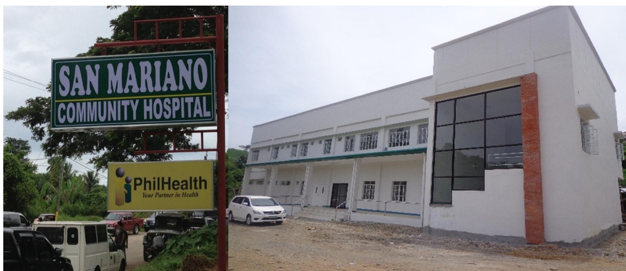
The new San Mariano Community Hospital, one of the recipients of the Health Facility Enhancement Program of DOH.