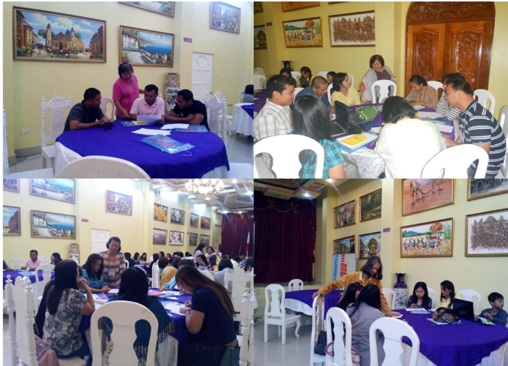
The participants are busy doing their plan with the technical assistance of the PHO staff during the workshop.