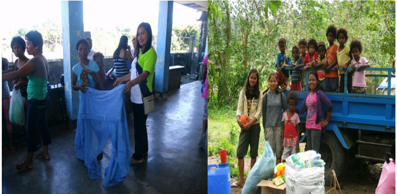
A Dumagat wife receives a Long Lasting Insecticide-Treated Net (LLIN) last February 24, 2014 in Barangay Digumased, Dinapigue while other families are waiting. Looking on are barangay folks and their children with much happiness evident in their faces.