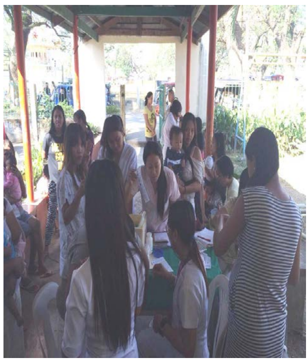
Start of Mass Immunization in Cabagan, Isabela