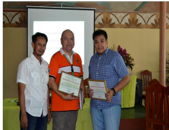
The Awarding of the Certificate of Appreciation to our Respective Speakers