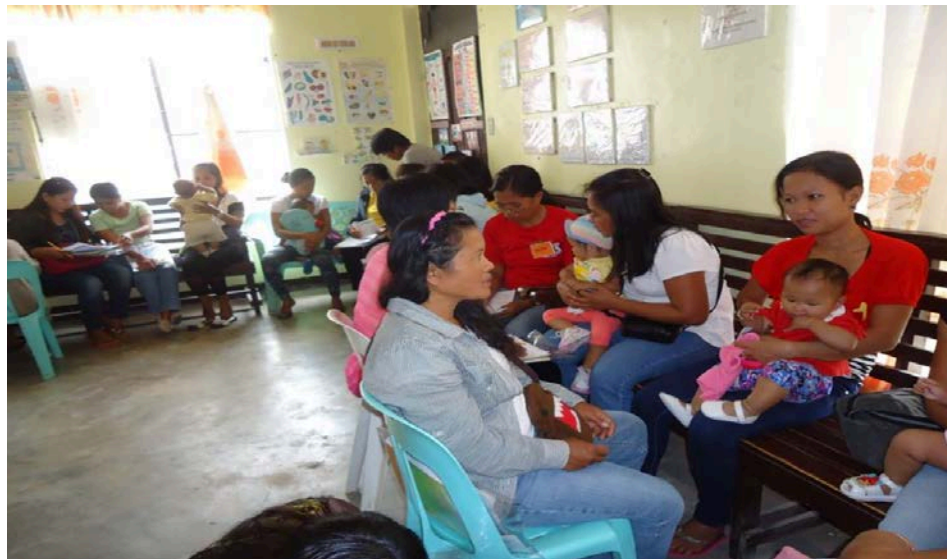
During the practicum of participants where they have to conduct an interview to a mother on feeding practices