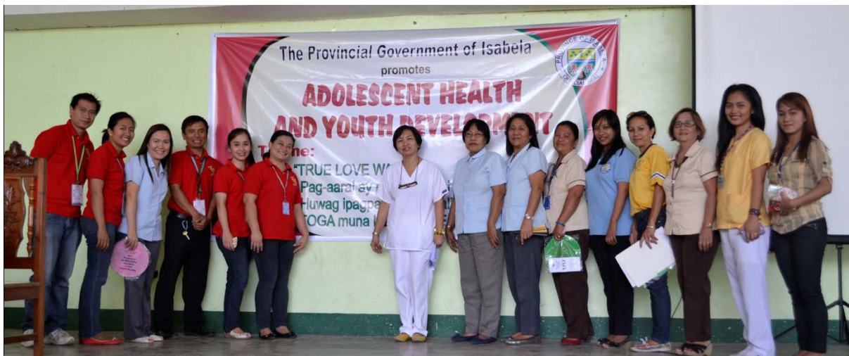
The PHO team and INHS staff at the end of the activity. A total of 1,350 students and teachers joined this teen campaign.