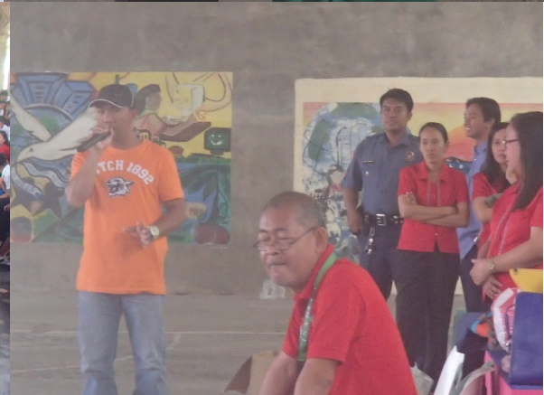
The interested students during the open forum where questions were raised. A parent leader ( clad in orange shirt) also participates.