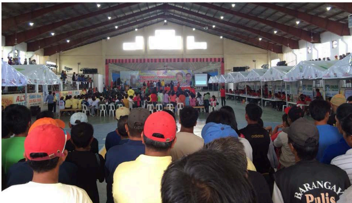
A glance at the site of the Medical Mission where patients wait for their turn to seek medical care.