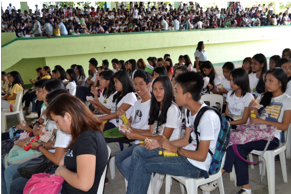
The whole studentry of Isabela National High School