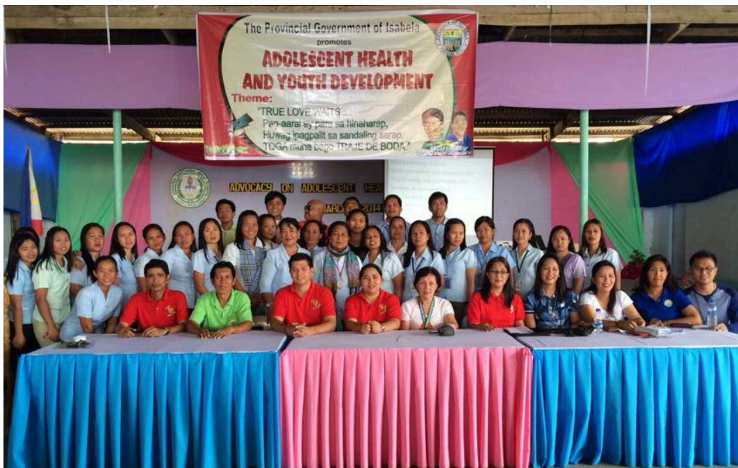
The teaching staff and administration of Echague National High School and the PHO team.