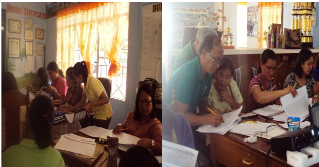
The PHO technical team during the 3-day Data Quality Check(DQC) Workshop conducted at Cauayan City Health Office II last February 25-27, 2014.

With the developed action plan which serves as a commitment springboard among the health personnel, it is strongly recommended that Data Quality Check Workshop be institutionalized in every RHU as a way towards full and efficient implementation of the Field Health Service Information System (FHSIS).