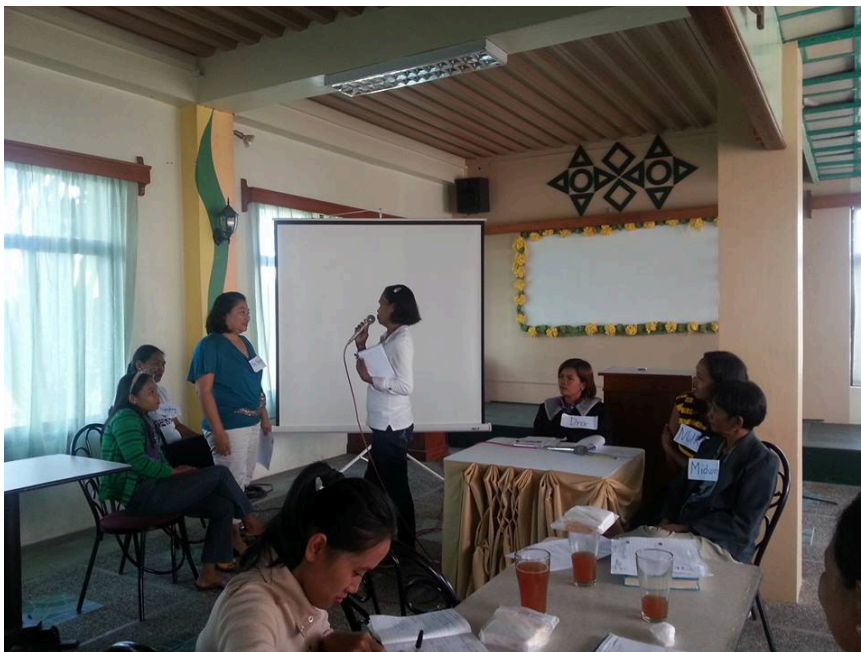
During the return - demonstration thru role-playing of BHWs on "How to Advocate TB program to Barangay officials"