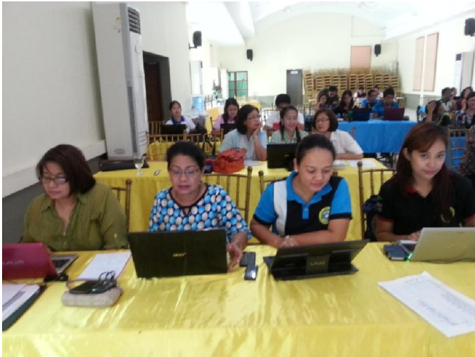
The Development Mngt. Officers (DMOs) of Isabela and Cagayan actively participate during the hands-on activity.