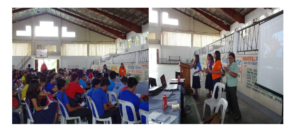
"Hamon sa Kabataan" jingle was sung jointly by the students and the facilitators.