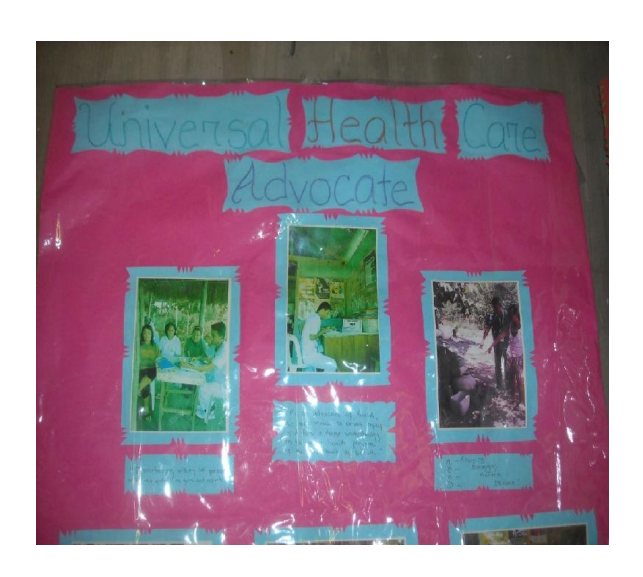
A sample work in progress made by the deployed Nurses from DOH posted at the Barangay Health Station of Villa Buena, Sta.