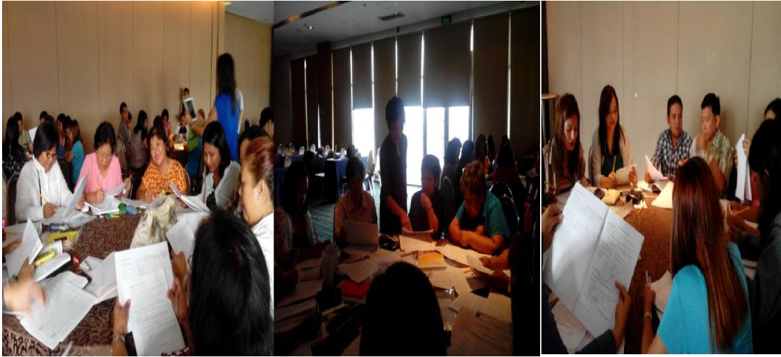
The participants actively join the group in answering the exercises.