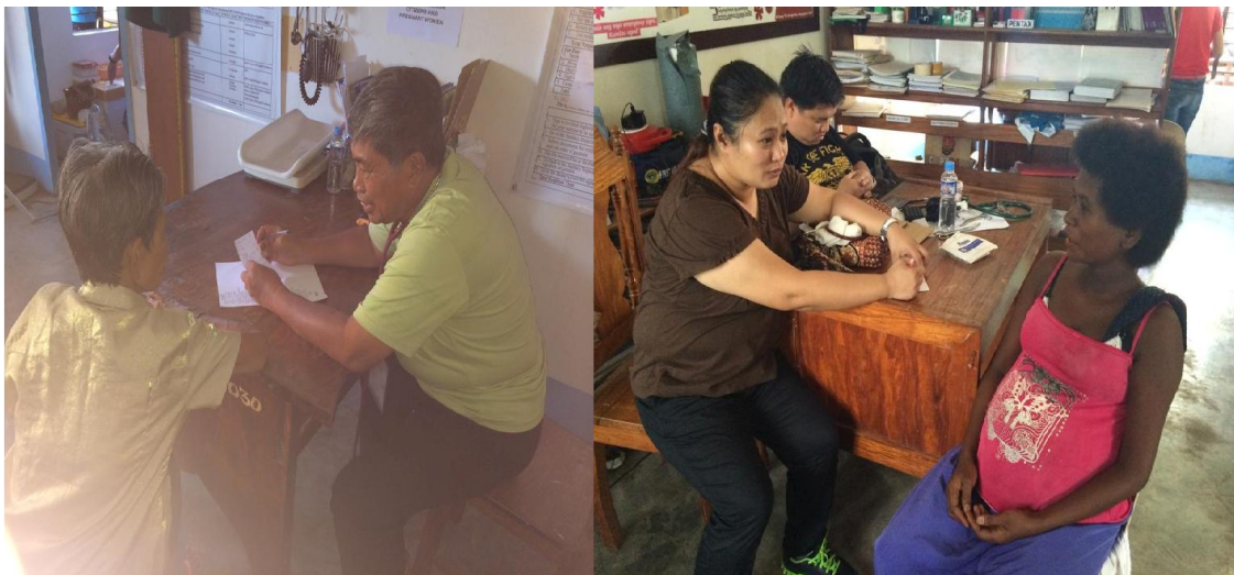
Medical Doctors from different Hospital assess and prescribe medicines to citizens of Dinapigue.