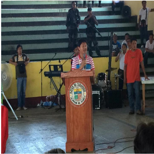
The Governor warmly gives his message to the Dinapigueños including the vast number of town folks.