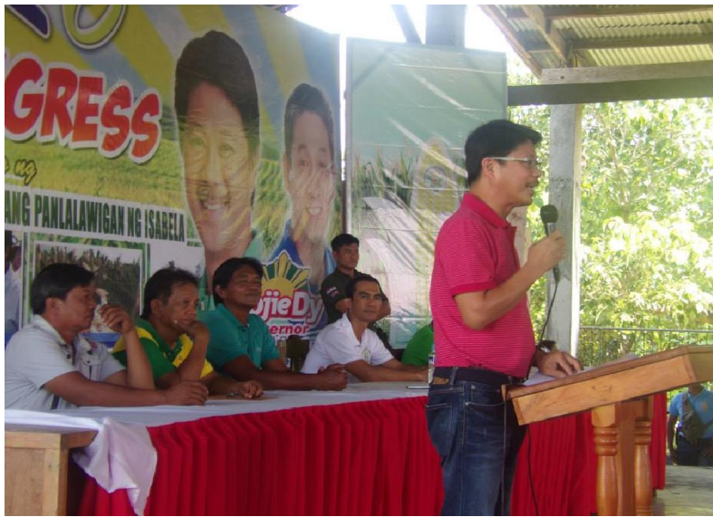
The Governor warmly gives his message to the different municipal and barangay officials including the vast number of town folks.