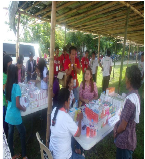
Dispensing of free medicines by the pharmacists from MARDH.