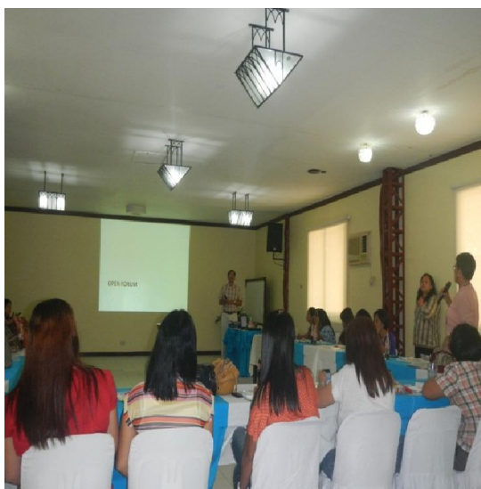
Participants actively share their queries during the open forum portion.