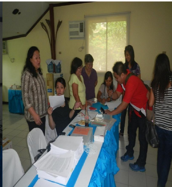
Registration of the participants during the 2 nd batch of the Orientation workshop