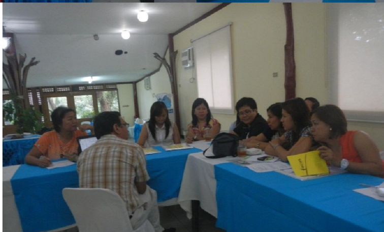
Participants with their assigned group to work on their assigned workshops on the Potential Roles of Public Schools in TB control