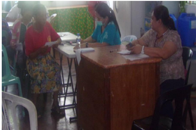
Medical doctors from MARDH examine and prescribe medicines to their constituents from the municipality of Quezon.