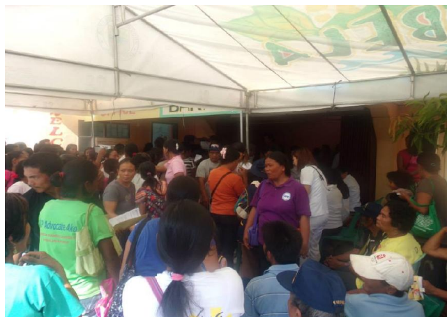
People from different barangays of Quezon eagerly line up for the listing of names in the admitting section of the medical-dental