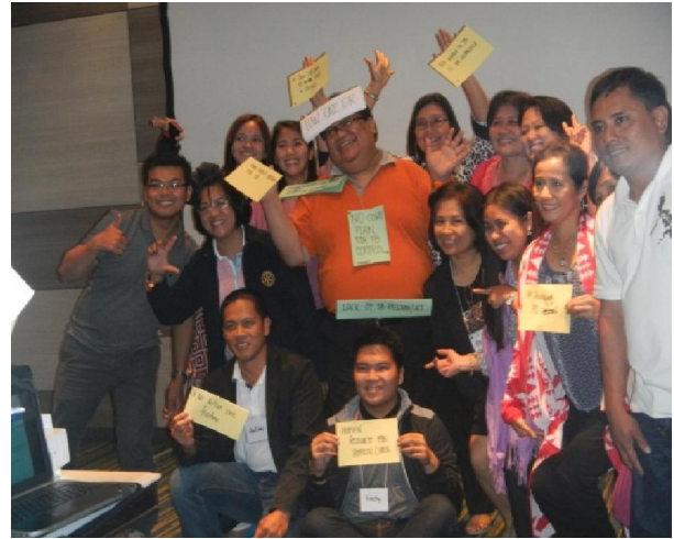
District 4 group post for group picture after the presentation of their output

Presenting the Final Group Output ----- All 4 districts gamely present their work thru Role playing.