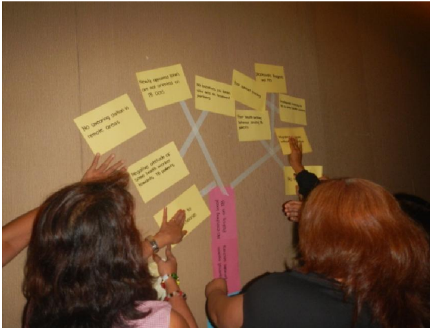
District 3 group during the Workshop on Identification of Policy Gaps and Issues in their respective DOTS facilities.