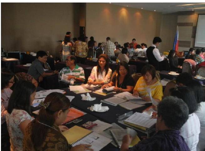
District 1 group during workshop on the Analysis of Data and Issues on Local TB Programs/Drafting of Proposed Ordinances for presentation