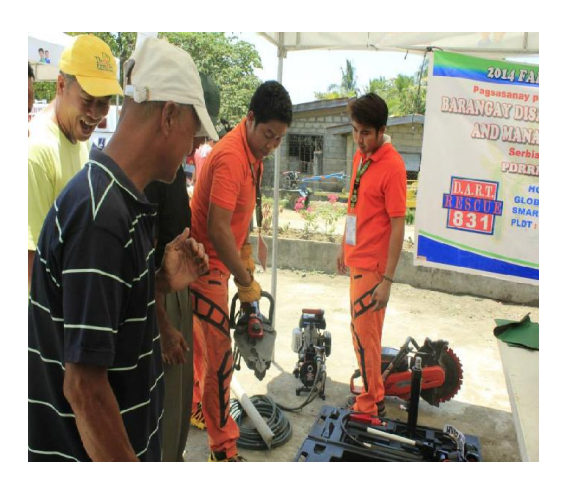
The Provincial Disaster Risk Reduction Team, provide preventive and safety measures in cases of calamity.