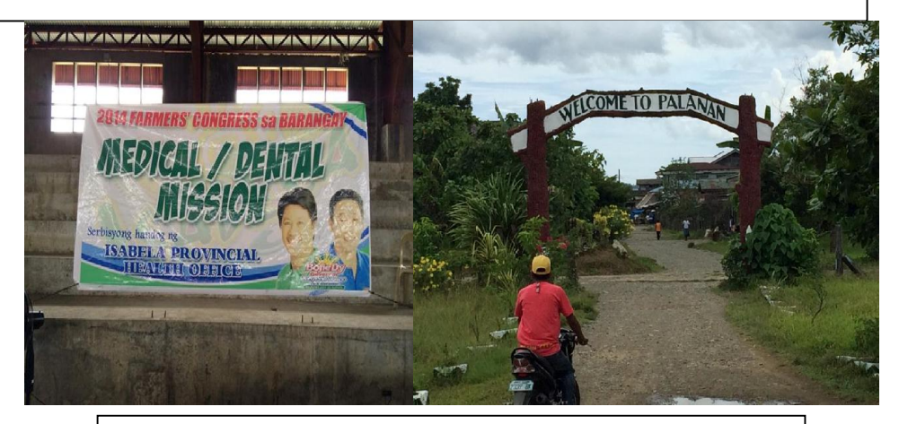
Palanan, Isabela, gateway to the scenic tourist destination!

The much-loved Isabela Governor Faustino G. Dy III gives his message with Hon. Rolly Tugade, Sangguniang Panlalawigan and Hon. Angelo Bernardo, Mayor of Palanan.