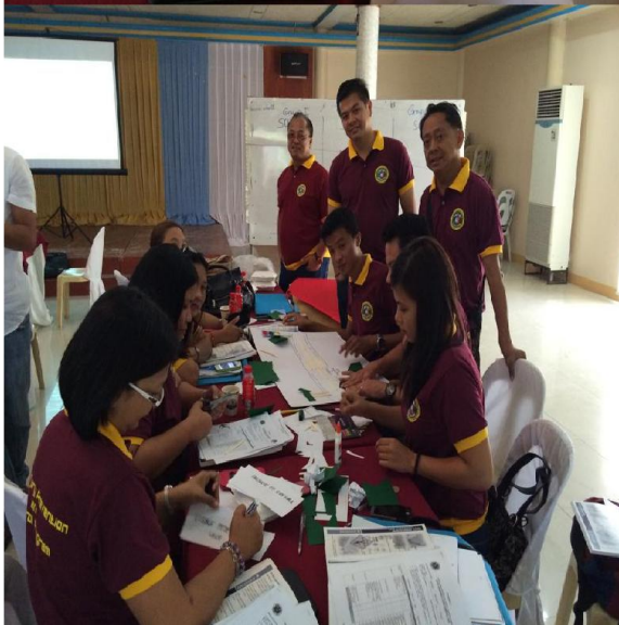
The Participants having their group activity.