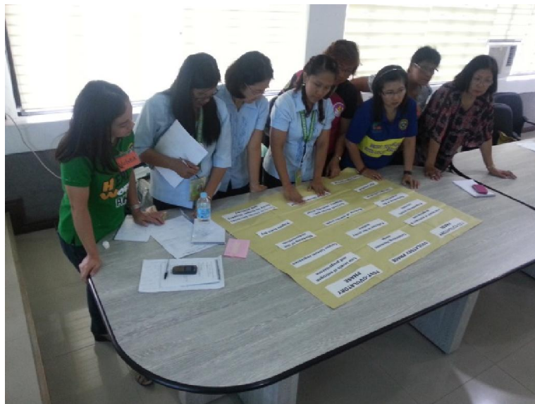
Involvements of all the participants were observed during the workshop sessions.