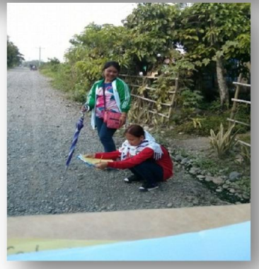
One of the best practices: Group 3B conducts RCA while Mop-up team joins to ensure zero-missed children.

reaching far flung areas. Four (4) transportation services were provided by Governor Dy, to Complement the five(5) vehicles provided by DOH. These vehicles brought the teams to far flung barangays from uphill to downhill where the fixed sites were located. With these vehicles, the Provincial RCA Teams conducted their main task-RCA monitoring which entailed crossing clear creeks, roving rivers