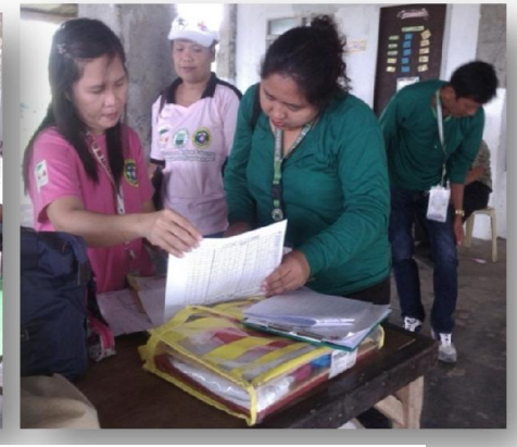
Group 1B during the fix site visit at Brgy. Binarsang, Reina Mercedes