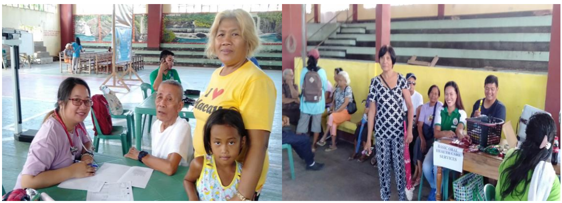
Actual physical check- up of the medical practitioners for the elderly group