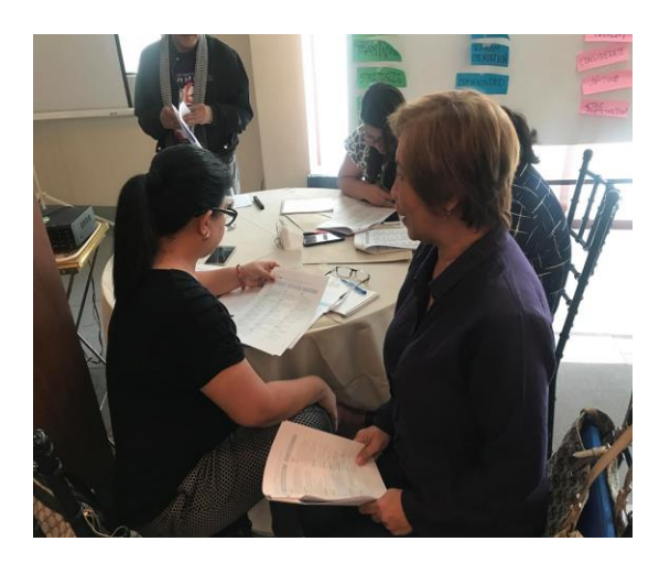
Participants go through one-on-one counseling exercises on giving brief advise on smoking cessation.