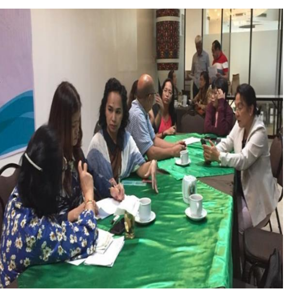
National, Regional and Provincial MNCHN coordinators conduct a systematic review of Maternal and Neonatal Death