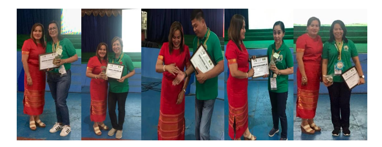
Invited Resource Speakers receive their plaque of Appreciation from the CHOI, City of Ilagan, Isabela