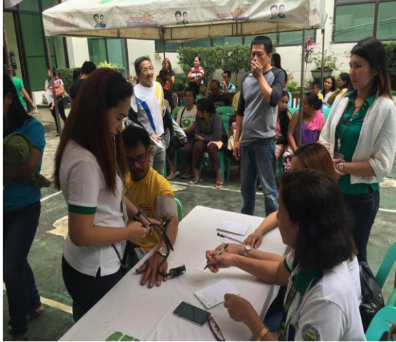
People from all over Isabela flock to GFNDY Memorial hospital for the free medical, surgical and dental mission.