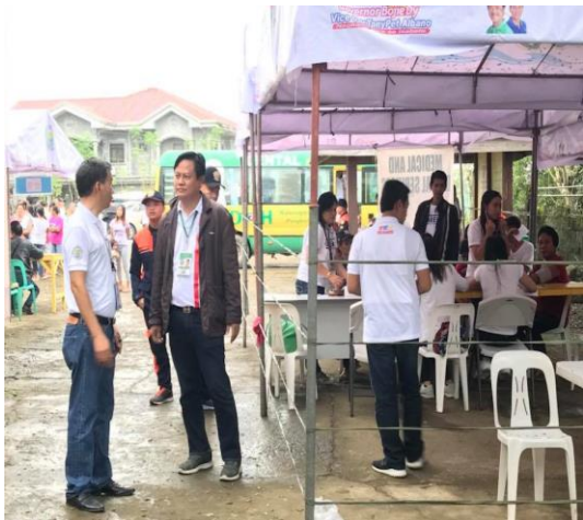
PHO II plans early on the medical service flow with the Isabela Health Care Chief.