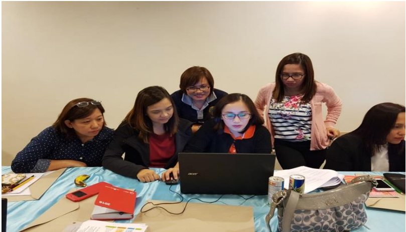
NTP Core Team of PHO Isabela and staff from the City Health Offices of Ilagan and Cauayan during the planning workshop.