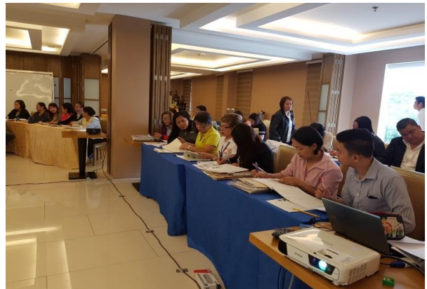
Validation of Hospital DOTS reports