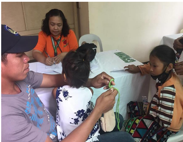
Pool of doctors from the GFNDY Memorial Hospital and other districts attend to sick Isabeleños