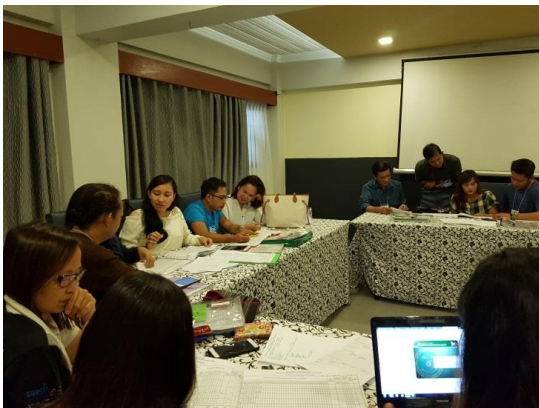
Validation of records and reports