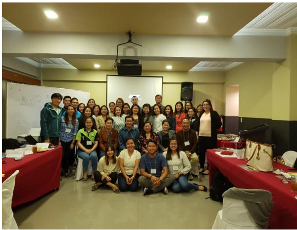
Group picture together with PBSP, DOH-NTP and NTRL staff after the training.