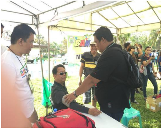
The Morning and afternoon shifts- as they go about attending to people who are suddenly taken ill at Bambanti Village on January 26-27, 2018