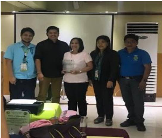
The Provincial dentists proudly smile as they receive the plaque of recognition in behalf the Provincial Government of Isabela