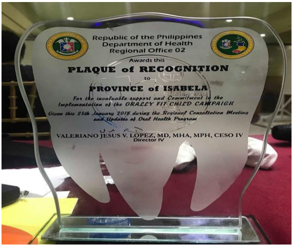
A commemorative plaque- a manifestation of Isabela’s service to the Oral Health Program of the government.