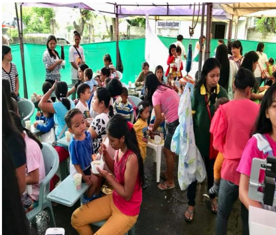
The Bro-Lusog recipients enjoy their Gourmix food .