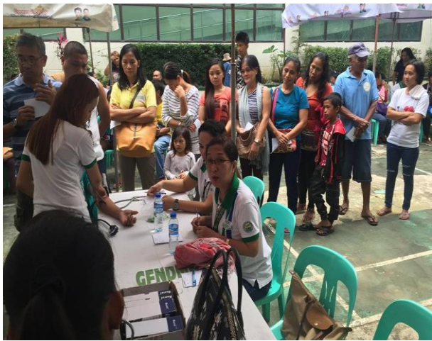
Nurses from the IPHO and GFNDY Memorial hospital and other districts facilitate in the admission of patients.