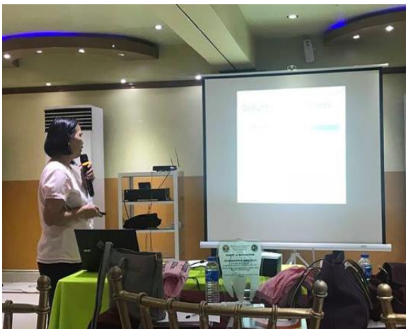
The Provincial Dentists present the provincial status on the Oral Health Program of Isabela as well as the annual accomplishments in terms of the Orally fit child campaign.