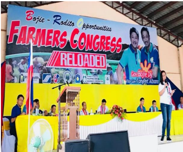
PHO Nutritionist III enlightens the people of Naguilian on the BRO-LUSOG Program