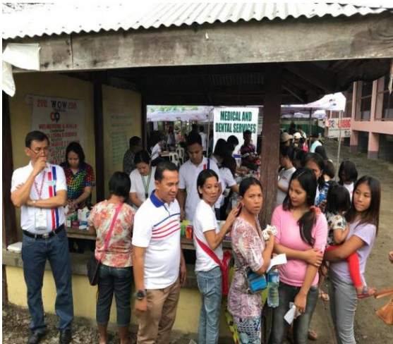
Naguilian townspeople line up for free medicines