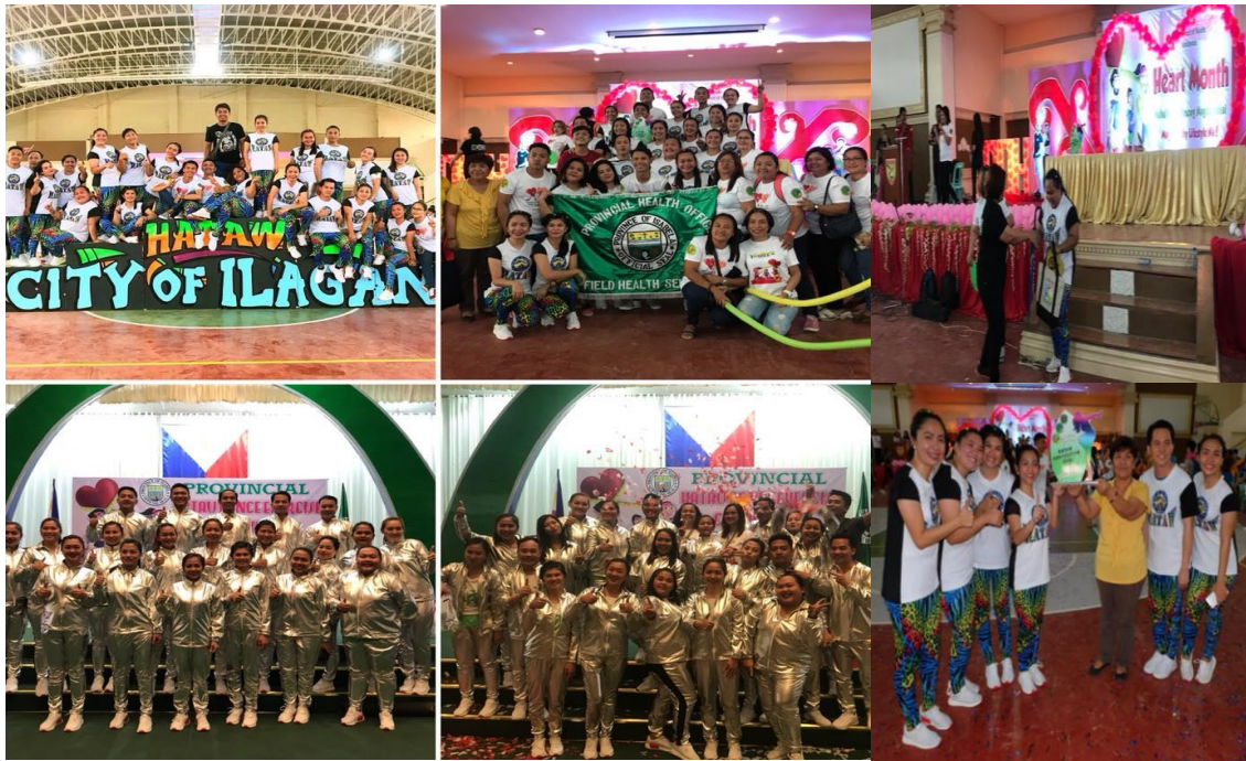
The champion of the Regional Hataw Dance Competition and the best female dancer goes to the City of Ilagan- Mammangui Movers!