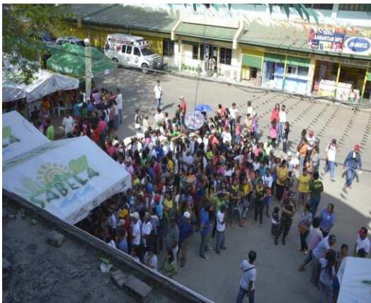
The aerial view of the crowd of people who gather for the Farmer’s Congress Reloaded