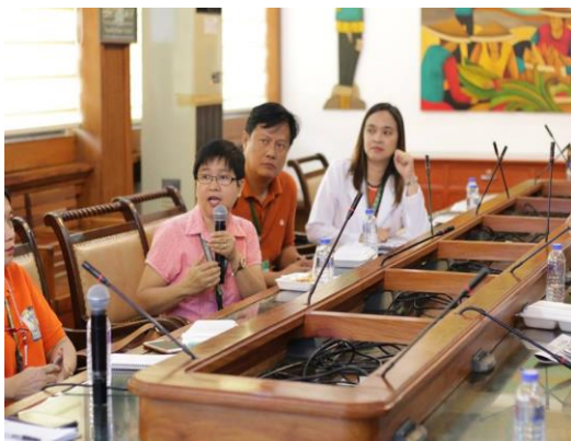
The Chief of Hospital of GFNDY Memorial Hospital shares her ideas regarding the Accomplishment of Fully Immunized Child (FIC).