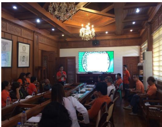
The program manager of Maternal & Newborn Health presented a 2D Infomercial for advocacy use