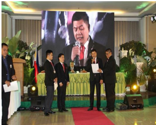
Our very own Provincial Dentist II takes his Oath of Office as National President