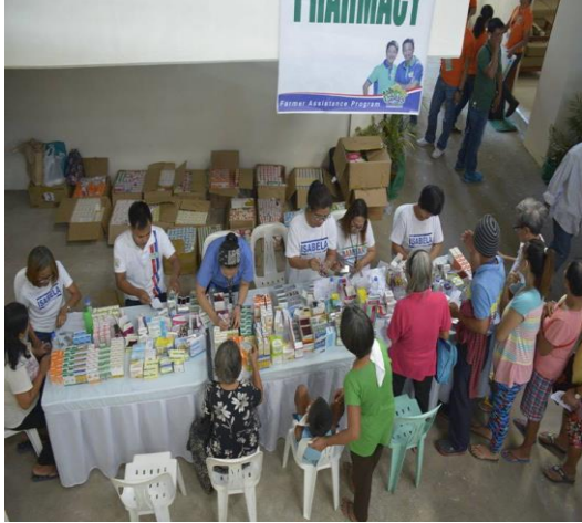
Young and old lines up for free medicine after medical consultations.