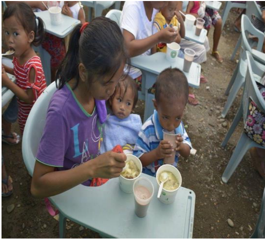
A young mother feeds her children with Gourmix at the BRO-LUSOG booth