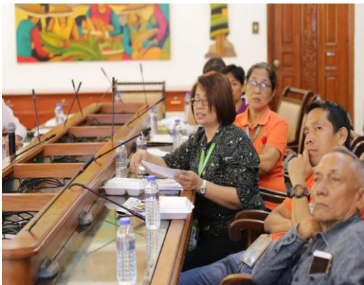
The DMO V of the DOH RO2 explains the draft EO on Creating a Provincial Implementation Team (PIT) for RA 10354