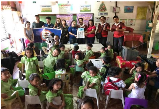
An outreach activity for the daycare pupils at a certain barangay in Palawan a day before the convention