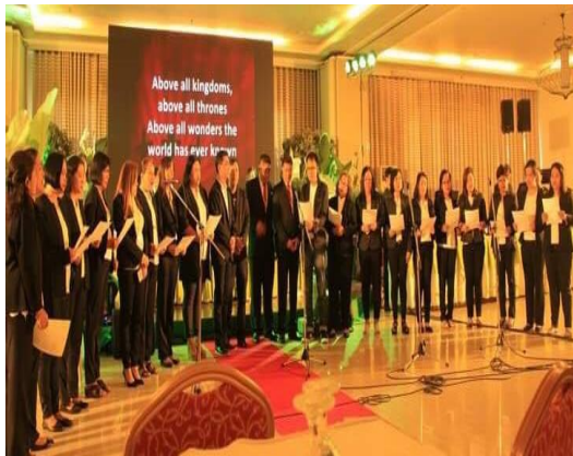
The Isabela Delegate opens the program with a Doxology

Around six hundred (600) Public Health Dentist s from the different provinces attended the said event with much enthusiasm and excitement as all listened attentively to the interesting lectures. It was also an opportunity to renew ties and camaraderie with dentists all over the country for the promotion of dental health goals and aspirations.