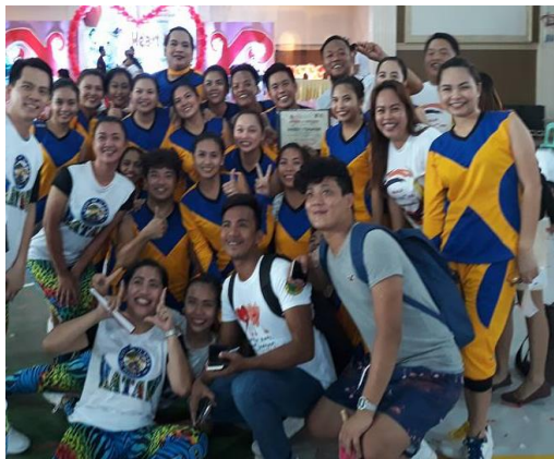
1 st placer- Cagayan Province