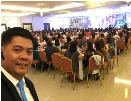
Around six hundred (600) Public Health Dentists from the different provinces attend the convention