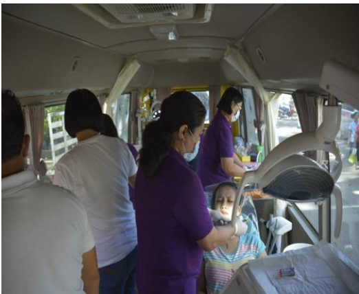
Dentists at work inside the mobile Dental Health Bus.