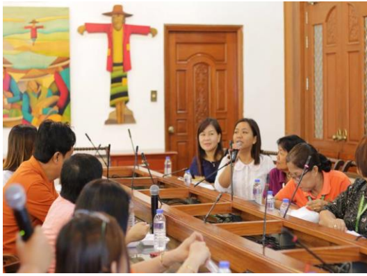
A DEP-Ed Representative inquires regarding free medical examination among teachers in 1 st district of Isabela.