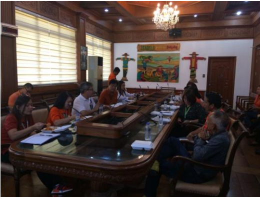
The Provincial Administrator talked about creation of composite team during incidence of dengue outbreak in the province.