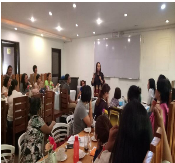
The POPCOM Regional Director talks about

The Provincial Population Office (PPO) of Isabela in collaboration with POPCOM Region II, DOH RO2, and DSWD RO2 as mandatory agencies in the implementation of the PMOC, conducts a three (3) days training on the Enhanced Pre-Marriage Orientation and Counseling Manual: Module 1. The participants will be active PMC team members at the municipal level composed of Population Officers as the team leader/secretariat; the midwives/nurses from the Municipal Health Office (MHO/RHU); Municipal Social Welfare Officers (MSWDOs) as mandatory members and the Local Civil Registrar (LCR); other relevant local offices such as but not limited to Agriculture, Education Gender and Development Focal point; and Civil Society organizations (CSOs) as optional members.