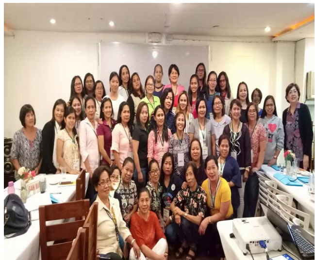
Municipal Population Officers, LCRs and MSWDO officers gather for a souvenir picture