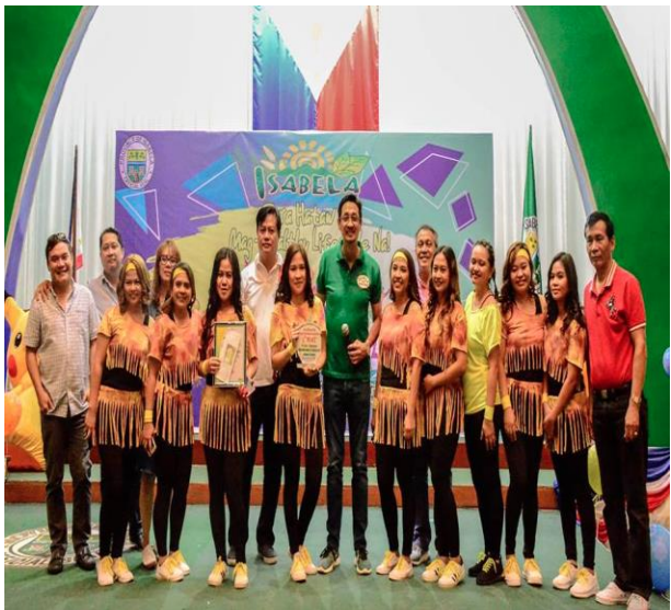
Third place- Isabela Health Care Office.