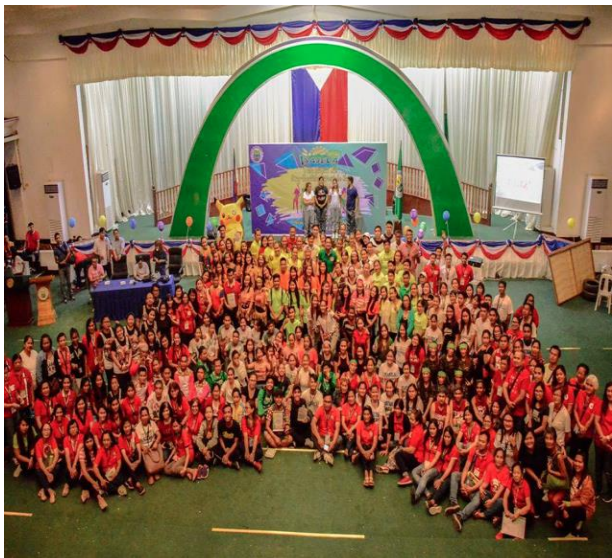
Jubilant participants share a photo-op with no less than the Vice Governor of Isabela after the event.