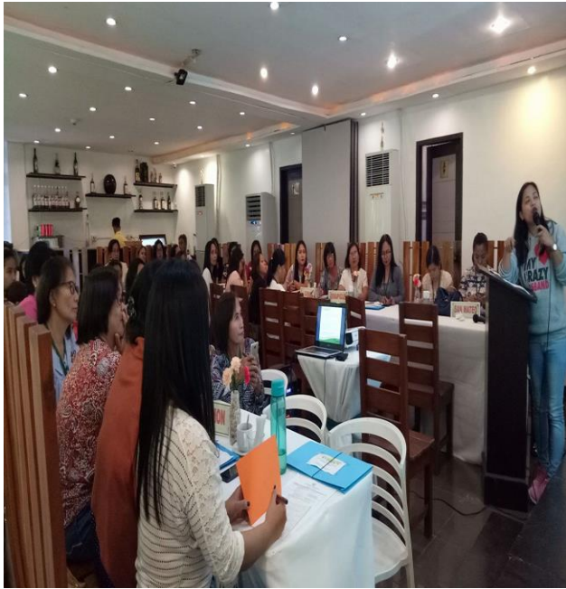
PMOC counselors from the 10 municipalities listen to the speaker