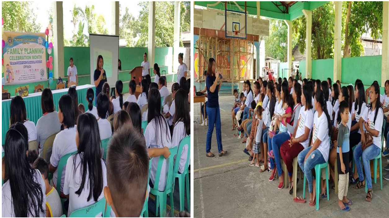
The Provincial Family Planning Program Coordinator lectures on the different FP methods to Women of Reproductive Age of Tumauni, Isabela