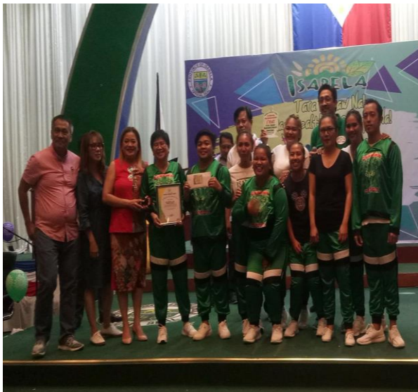
Second place – GFNDY Memorial Hospital