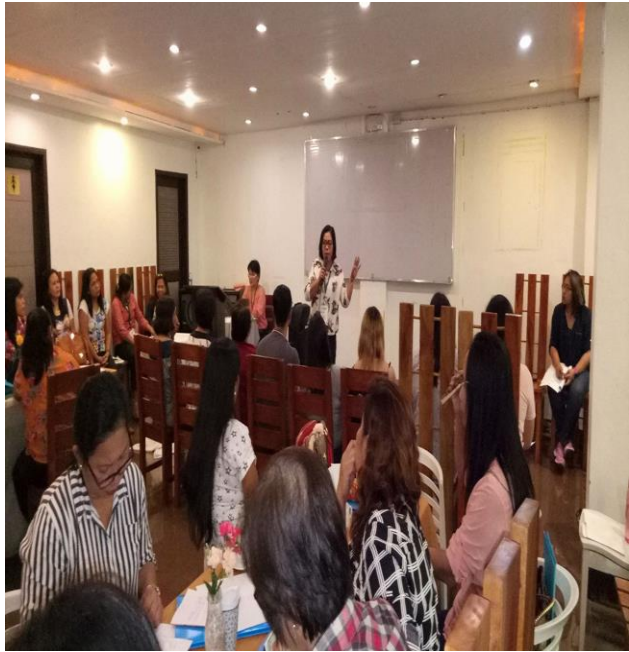
Actual Return Demonstration on Pre-Marriage Counseling