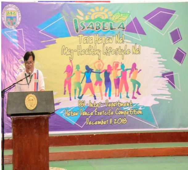
PHO II warmly welcomes everyone