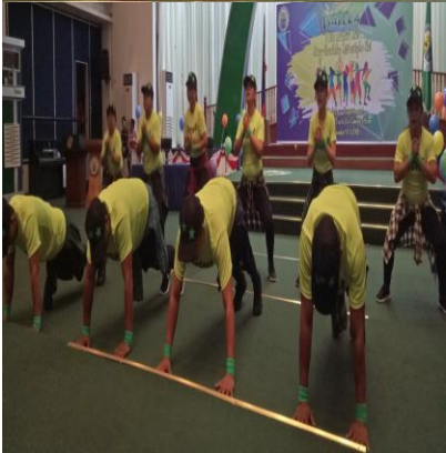
Some of the contenders show- off their dancing prowess during the contest.