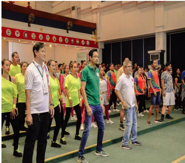
Three powerful men of the Provincial Government of Isabela leads everyone in the warm-up exercise