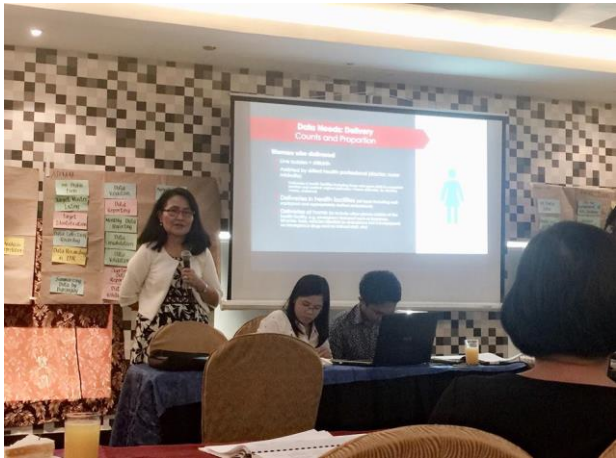
One of the DOH Program Managers discusses the new indicators in Maternal Care