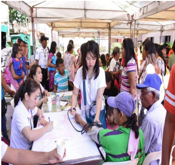
Nurses assist in admitting constituents of San Pablo, Isabela