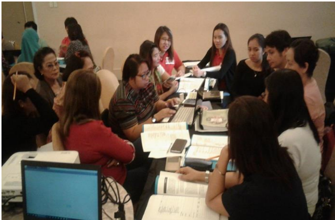
Final Output: Rapid Assessment on FHSIS Implementation and Action Planning per region