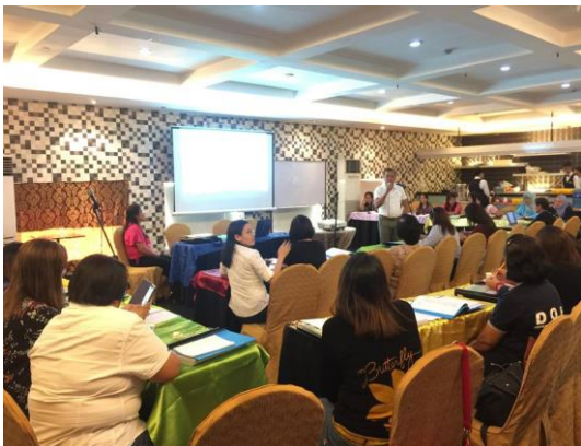
The Director of DOH-Epidemiology Bureau gives his inspirational message to all participants