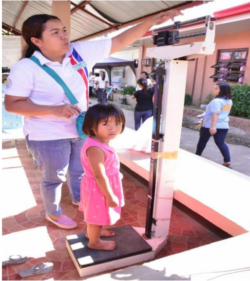
Weighing of a young child as part of the BRO-LUSOG Program of the provincial government.