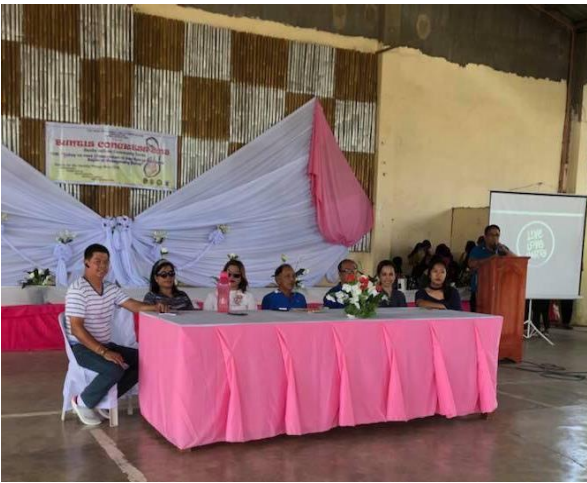
Board of judges for the Search for Healthy Preggy Mom