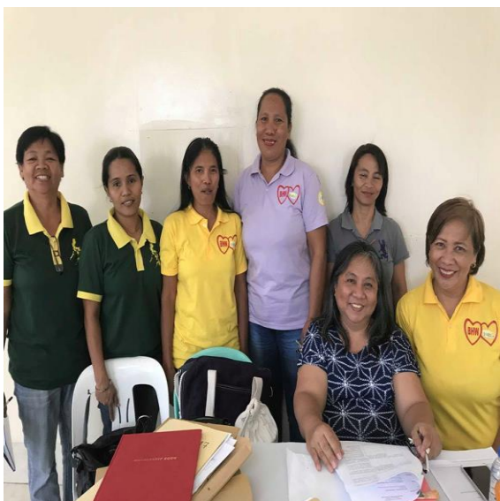
The Regional and Provincial BHW coordinators meet the newly-appointed BHW president in their respective areas