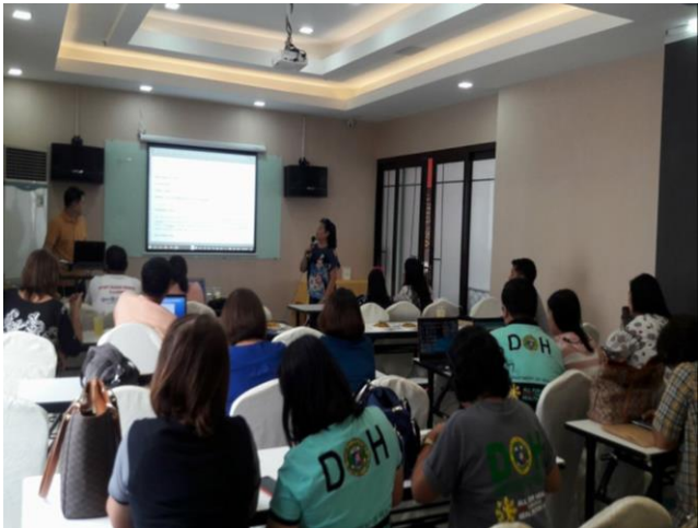
The PESU Coordinator of Isabela presents the output of IMRAD report