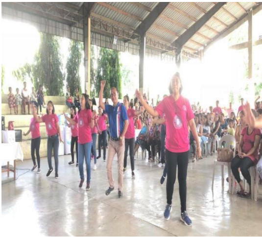
RHU staff & IPHO HEPO coordinator energetically display their HATAW moves before the crowd