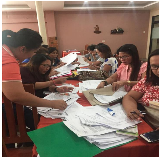
Two workshops: Consolidation and updating of RHUs on unmet need and MNCHN Format and PHIC accreditation