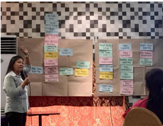
Workshop Output of Region 02: The Regional FHSIS Coordinator presents the FHSIS Process and Tools

With the integration of the new indicators, health workers will braised themselves with diligence in record management since they shall be attending a roll-out training in the next months in preparation for its full swing implementation by January 2019.