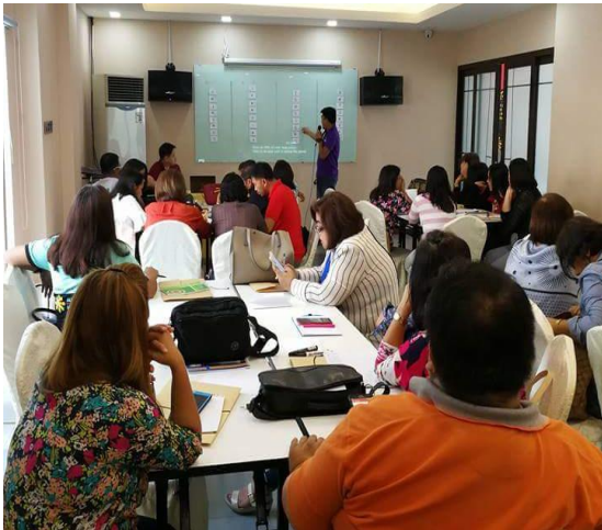
The speaker discusses the importance of surveillance in making a descriptive study.