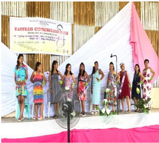
The highlight of the activity is the search for Ms. Healthy Preggy Mom 2018