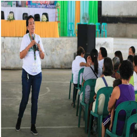
A Nutritionist enlightens everyone about the BRO-LUSOG program of the Provincial Government of Isabela at Quezon, Isabela