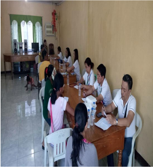
A pool of doctors attend to the medical needs of patients from Aurora, Isabela