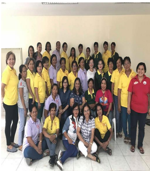
The first quarter meeting ends up with a souvenir photo-shoot