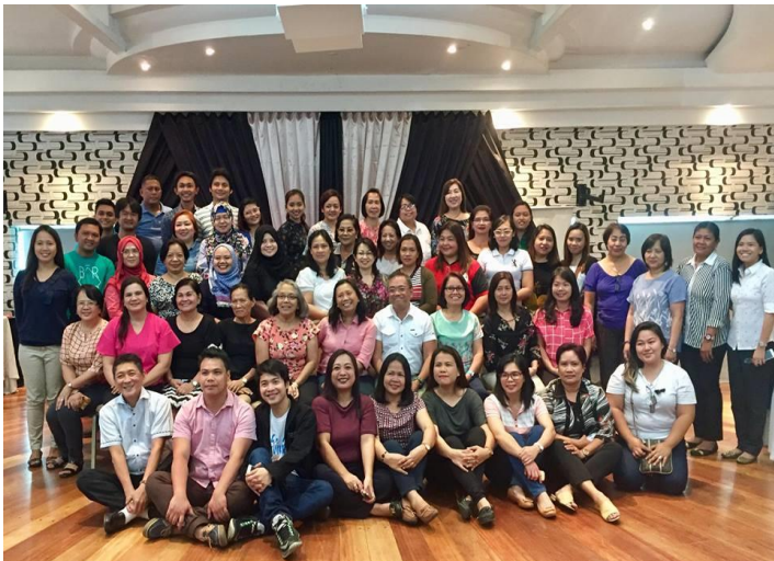
DOH- Epidemiology Bureau FHSIS Batch 1 composed of Regions 1, 2, CAR and ARRM.