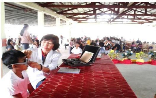
Final Visual Screening and refraction by Licensed Optometrist.