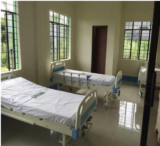
A well-kept Recovery Room with a 5-bed capacity