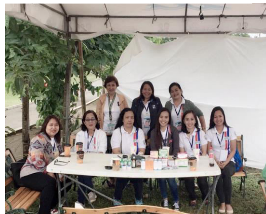
The IPHO –FHS Medical Rescue Team morning shift stations at the Bambanti Village.