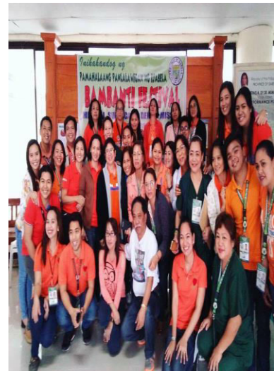
The workforce of the GFNDY Memorial Hospital and IPHO-FHS takes a pose after the successful Medical-dental surgical Mission.