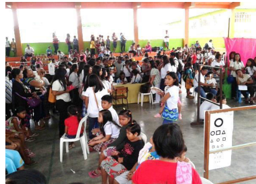
Vision Screening of the pupils/students by the Teachers and School Nurses.