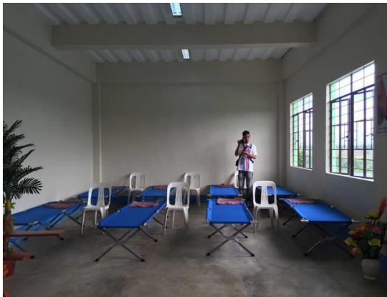
The Lactation Room located at the second floor of the Isabela Evacuation Center offers a clean, secure, and user-friendly environment for women who need to breastfeed their babies during emergency and disasters.