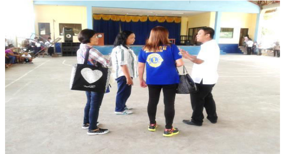
Coordination with the President of Lions Club International-Marikina Chapter, Optometrist and Dep-Ed Nurse of Cauayan.