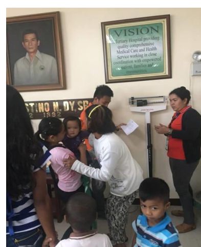
Isabeleños line up for the medical-dental surgical mission at GFNDY Memorial Hospital