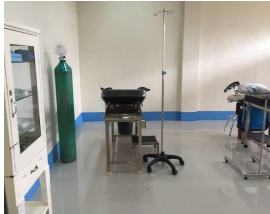
The Labor Room in complete amenities await patients in labor