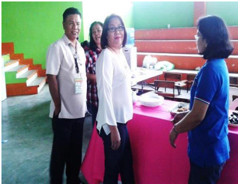
Courtesy call with the Principal of Cabagan Science Elementary School.