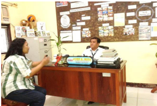
Courtesy call with the Principal of Cauayan City National High School