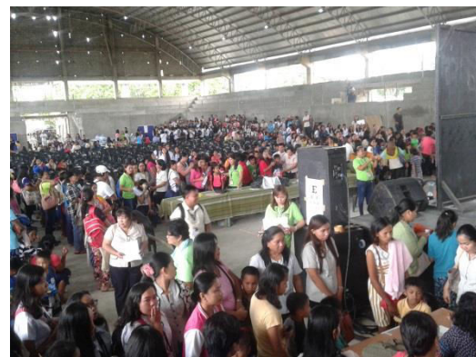
The Pupils line up for the Vision Screening.