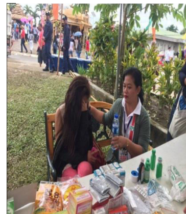
IPHO Field Health Services staff perform their duties for Isabelleños who were suddenly taken ill. Services include blood pressure-taking, dressing of wounds and cuts and taking care of a patient with dizziness.