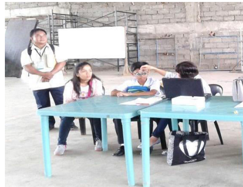
Final Visual Screening and refraction by Licensed Optometrist.