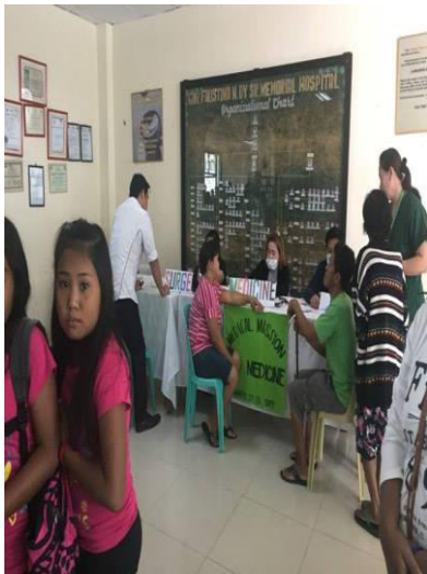
Pool of Medical Doctors attend to every sick Isabelleños during the week-long Medical-Dental-Surgical Mission