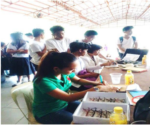
A nurse from Provincial Health Office assists in Vision Screening and validation.