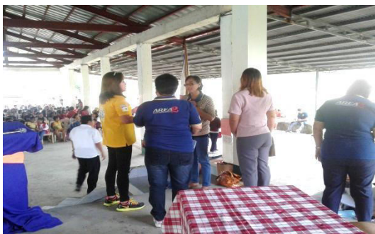
The Lions Club International President works together for the Vision Screening .