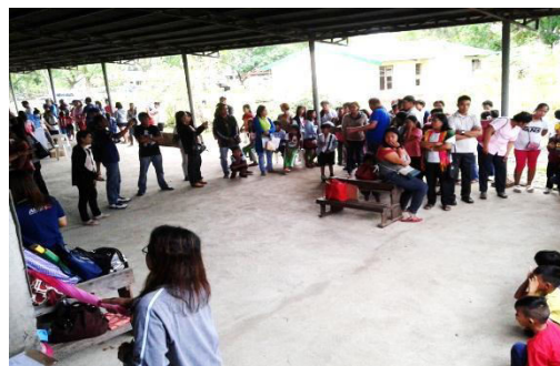
Vision Screening of the pupils/students by the Teachers and School Nurses.