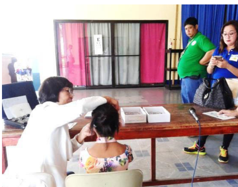
Final Visual Screening and refraction by licensed Optometrist.