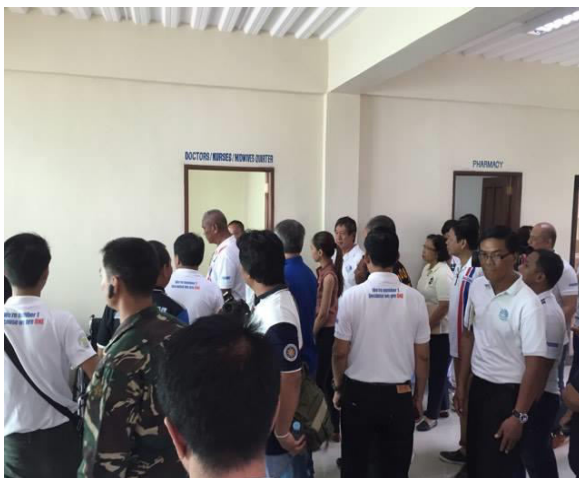
First stop: a quick visit to the Isabela Infirmary and Birthing Facility by the Evaluation team

The early part of the year prompted the workforce of ISABELA to join together for the Gawad Kalasag Evaluation last January 5, 2017 at the Isabela Evacuation Center, City of Ilagan, Isabela. Gawad KALASAG is the country's premier annual award for outstanding contribution in the fields of disaster risk reduction and management and humanitarian assistance. It is the principal mechanism by which the NDRRMC advances awareness of the best practices of DRRM and humanitarian response and action. Moreover, it aims to appreciate individuals, groups or institutions which have shown extraordinary courage, heroism and sacrifice in times of emergencies, be it natural or human-induced.