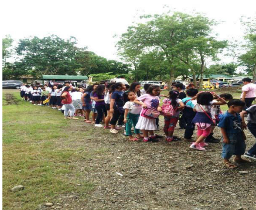
The Pupils wait in line for the Vision Screening and Validation.