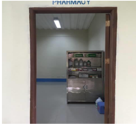
The Pharmacy for the storage of drugs, medicines and basic supplies for treatment