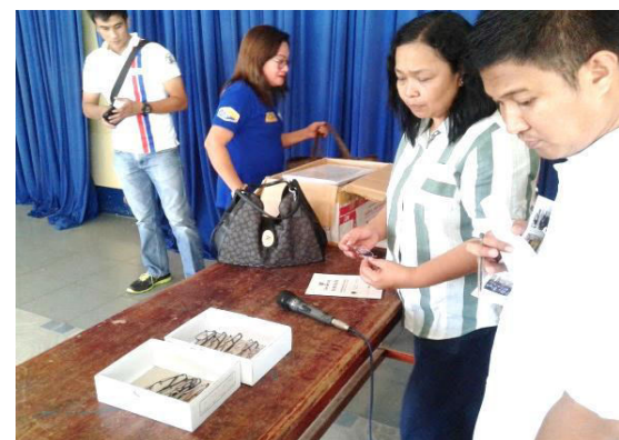
Testing of Sample Frame of Eyeglasses for students during Screening