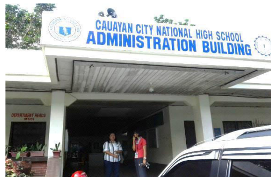
The Medical Doctor of Isabela Provincial Health Office coordinates with the School Nurse of Cauayan City National High School.