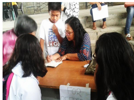
The Medical Doctor of Provincial Health Office during the validation of pupils for referral to Ophthalmologist.