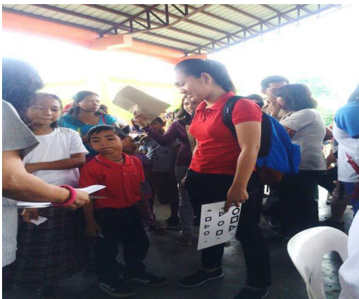
A nurse from the Provincial Health Office helps in Vision Screening and Validation.