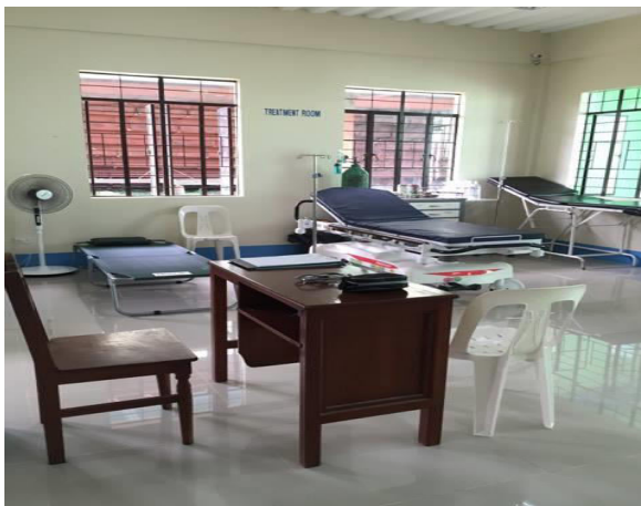
The physical set-up of the Infirmary and Birthing Facility located beside the Isabela Evacuation Center