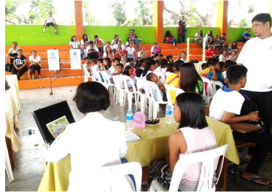
Final Visual Screening and refraction by licensed Optometrist.