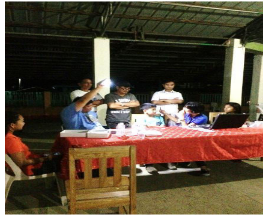
The untiring Optometrist checks on the vision of pupils or students