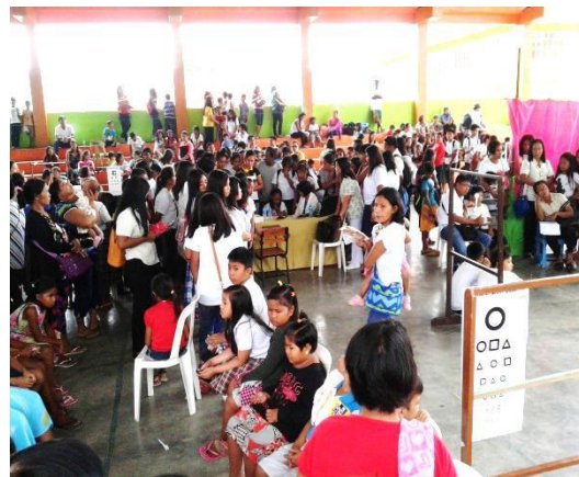
Vision Screening of the pupils/students by the Teachers and School Nurses.