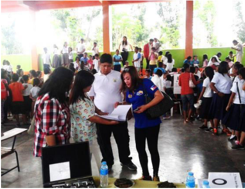
The Lions Club International President joins the Vision Screening