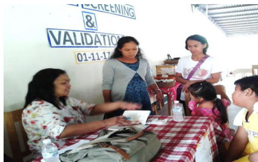
The Medical Doctor of Provincial Health Office validates the pupils prior to referral to Ophthalmologist.