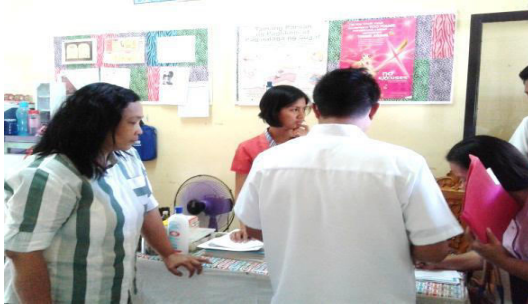
Registration of the Dep-Ed Teachers for their Students for eye screening and refraction