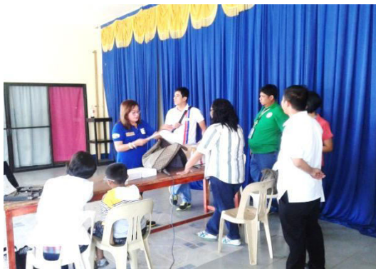
The Lions Club International President performs the Vision Screening