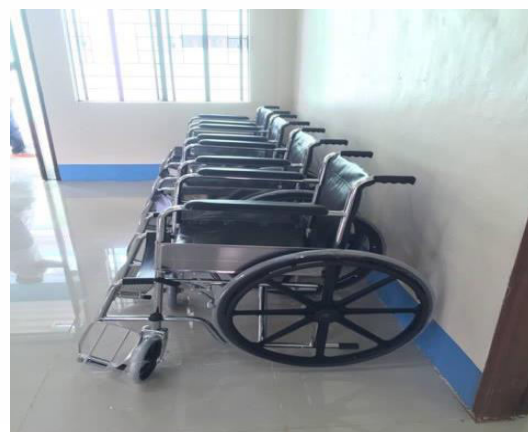
Wheelchairs standby for emergency transport of patients