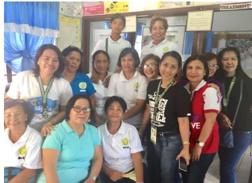
The workforce of barangay Minante Health Station in Cauayan City Isabela hams it up for a souvenir shot after the validation activity.