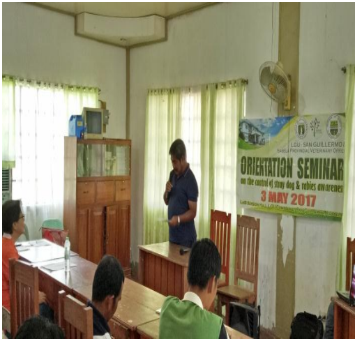
At San Guillermo with their LMB president as he conveys his appreciation for the multi-sectoral effort against Rabies.