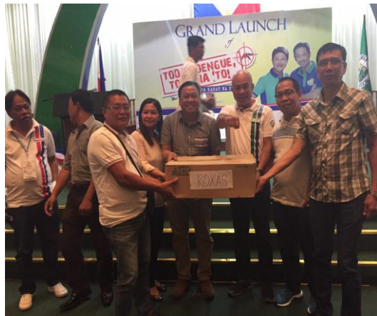
Distribution of insecticide-treated nets to the different municipalities.