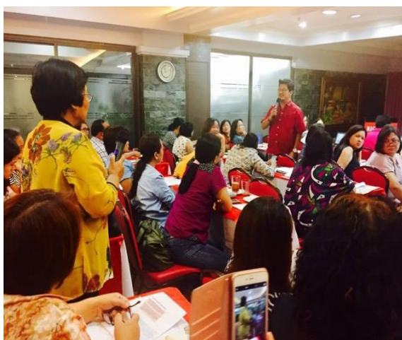
The OIC Division Chief of DOH- Disease Prevention and Control Bureau welcomes the participants.

Relative to this, the DOH- Disease Prevention and Control Bureau (DOH-DPCB) conducted a 3-day Orientation Planning with selected DOH and LGU personnel for the implementation of the Administrative Order on achieving the Desired Family Size through the Accelerated and Sustained Reduction in unmet need for Modern Family Planning.