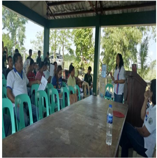
The Rural Health Physician presents the Rabies Situation of the province to the LMB of Cauayan City, Isabela