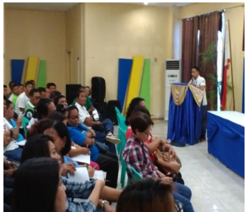
The Assistant Rabies Coordinator from the Isabela Provincial Health Office reminds everyone that proper and immediate first aid once bitten by an animal.