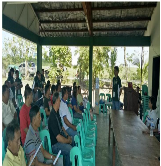
The PVET representative calls the community’s joint effort towards implementation of “Responsible Pet Ownership “.