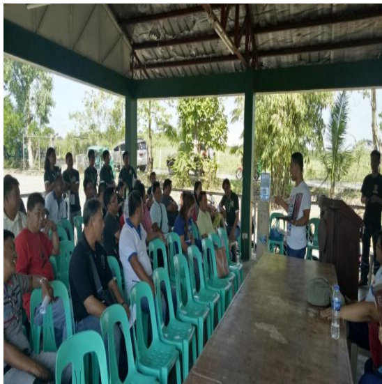
The Provincial Health Office Rabies Coordinator leads in strengthening public awareness on the prevention, control and management of rabies.