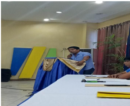
The LMB president of the City of Ilagan gives his inspirational message to his co – Barangay Captains and their important roles in the implementation of dog impounding in their respective areas