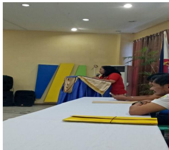
The Rural Health Physician from Isabela Provincial Health Office presents the on-going status of Rabies in the province.