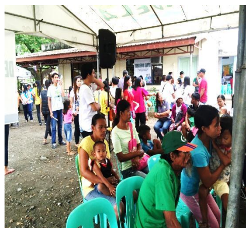
The people of Cordon while waiting to avail of the Medical/Dental Services that the province delivered to their place.