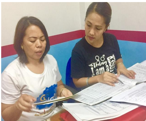
IPHO and PDOH teams up and validate records on TB and EPI programs taking in consideration its accuracy and completeness.