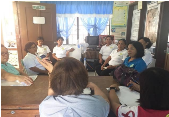
Barangay Health workers of Minante listens to the feedbacks from the PDOHO and IPHO