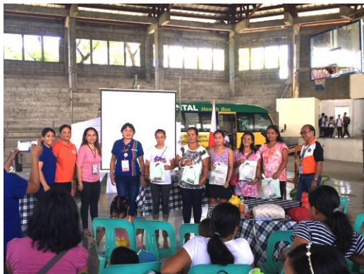
Group picture of the Barangay leaders, RHU staff of Jones and the team from the Provincial Health Office.