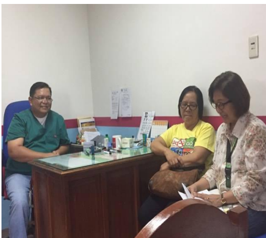
The team feedbacks to the City Health Officer of CHO1 citing their good practices and encourages them to improve more on their recording and reporting system