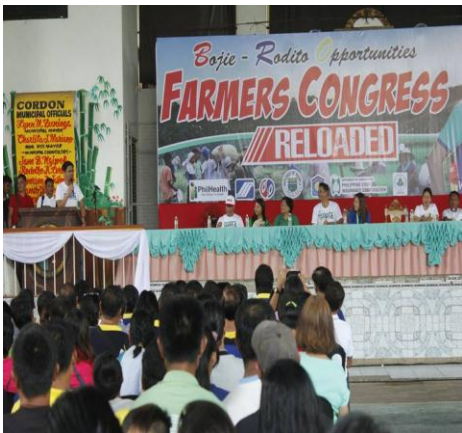
The Provincial Governor Faustino G. Dy III, gives a warm message to people of Cordon.