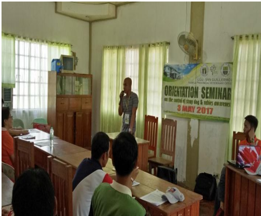
The Municipal Administrator of San Guillermo shares his personal experience on stray dogs in their municipality..