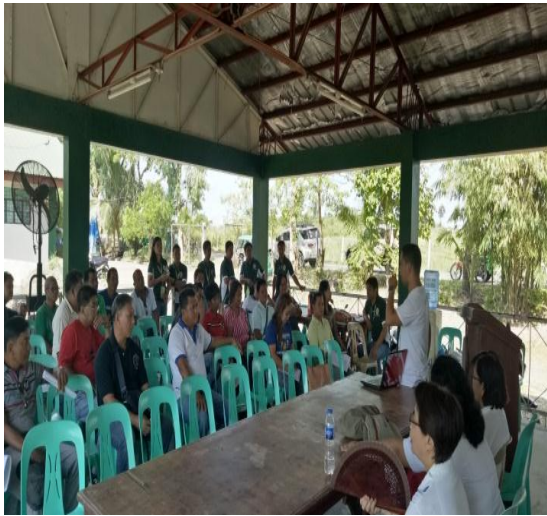
From Cauayan City’s Veterinary Doctor welcomes the delegate from the IPHO and PVET