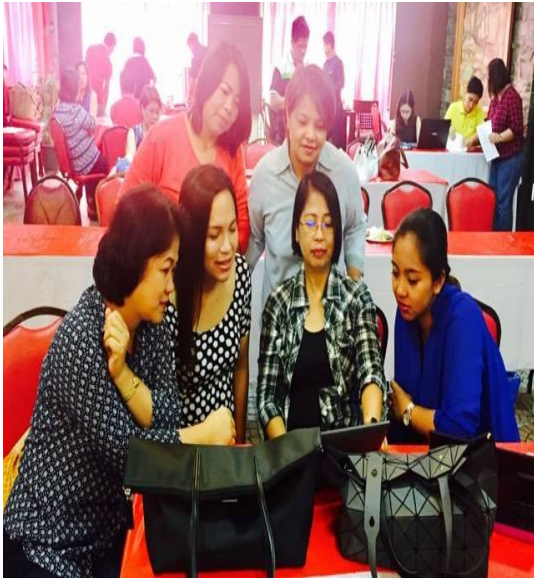
Day 2: Small group discussions on the Family Planning draft plan of Implementation for Region 2