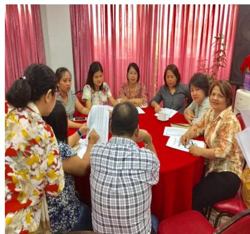
Day 1: Break-out group of Region 2, DOH Reg.2, IPHO, SIGH, CVMC, VRH convenes for the workshop.