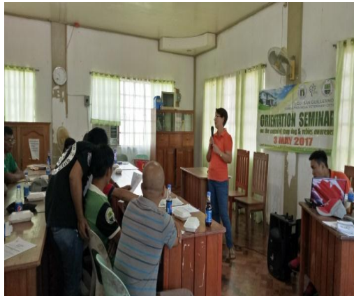
The Provincial Veterinary Office-Rabies coordinator, discusses the provisions of Rabies Management under R.A. No. 9482, otherwise known as the Anti-Rabies Act of 2007.