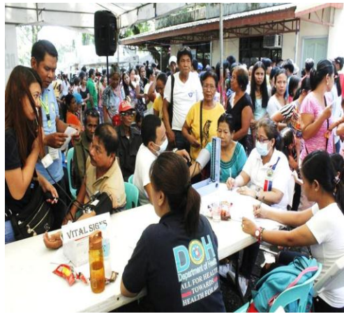
IPHO Nurses and GFND Nurses with the help of some RHU staff attend to patients for consultation.