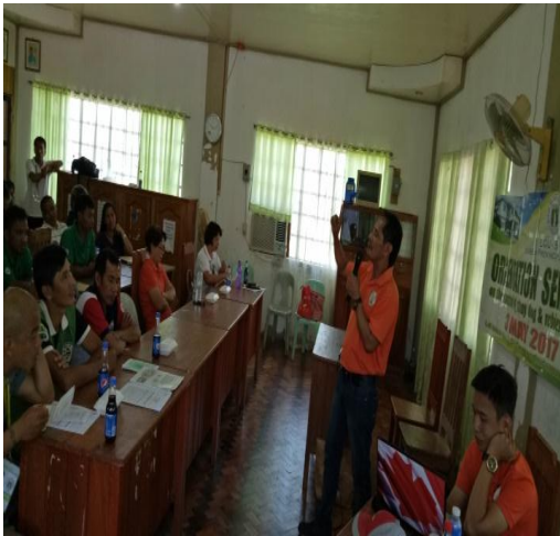
The Rabies coordinator of the IPHO during the open forum .