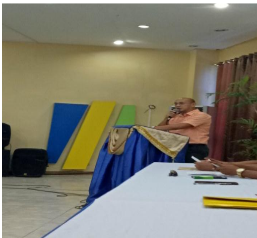
The SB on Health as a representative of the City of Ilagan delivers his message about Rabies affecting their community.