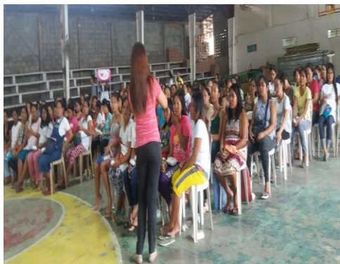
The MCH Coordinator of IPHO discusses Maternal Health during Pregnancy in San Manuel, Isabela