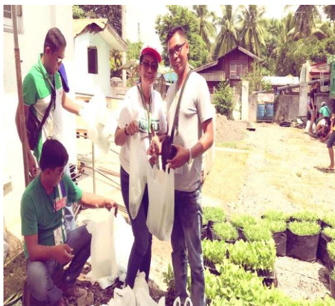
The Provincial Nutritionist-Dietician facilitates the distribution of seedlings for identified parents thru the BNS with a help from the Department of Agriculture.