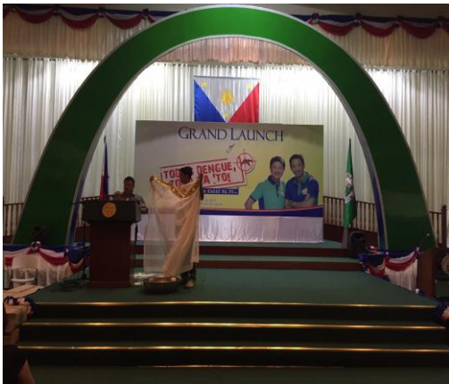
The Dengue Coordinator for Isabela demonstrates the proper soaking of curtains with the use of K-O tab.