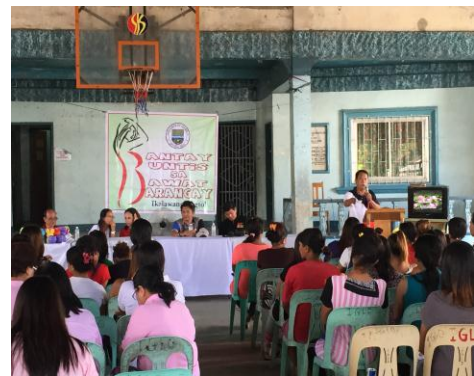
The Barangay Captain delivers his welcome message to the participants in San Manuel, Isabela.