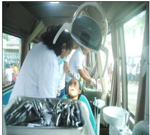
The Provincial Dentists lead the team in providing Oral Health care