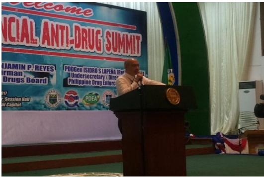
The Regional Prosecutor delivers the roles of the prosecutors in dealing with issues on drugs