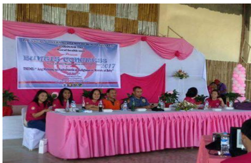
Guests and resource speakers convene for the success of the activity.