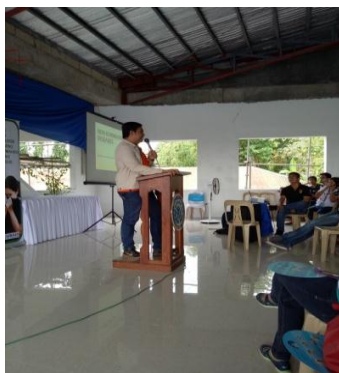
IIPHO staff as resource speakers during the interactive rundown of interesting topics to the eager students of TESDA.