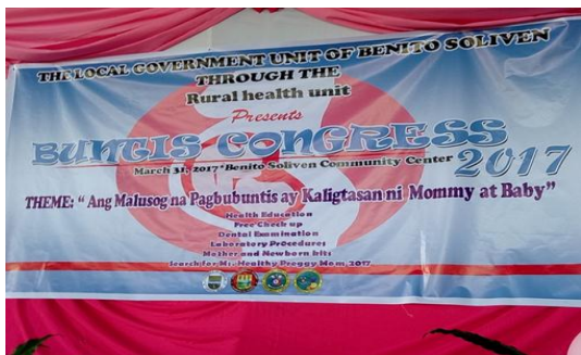
The backdrop developed by LGU Benito Soliven

Aside from these topics, vital health messages were tackled to include the increase of their involvement in the pregnancy tracking especially the teenagers, the importance of early detection of danger signs among pregnant women, and commitment of LGU Officials including the Barangay Officials and Health Workers thru creation of policies, ordinances or resolutions.