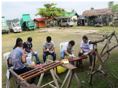
Smearing of sputum specimen of screened presumptive inmates.