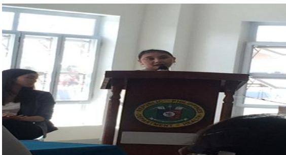
The Chief of Hospital of the Department of Health- Treatment and Rehabilitation Center conveys her welcome message to the participants.

The Isabela Provincial Health Office demonstrates once again its steadfast cooperation in battling drug abuse with its efforts in continuous screening and advocacy among various groups towards drugs abuse reduction and increasing public awareness. Along with this thrust, the personnel participates in the Seminar on Drug Abuse Prevention Program for Dangerous Drugs Board Authorized Representatives in the whole region held at Department of Health- Treatment and Rehabilitation Center(TRC), Centro, San Antonio, City of Ilagan last March 8, 2017.