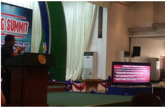
The Acting Provincial Director of Isabela Police Provincial Office presents the current status of Isabela in relation to the use of prohibited drugs