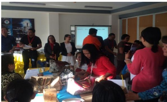
Participants from the Isabela Provincial Health Office receive their designation as Dangerous Drugs Board representatives with specific duties and responsibilities under Board Resolution No. 3 s. 2007.