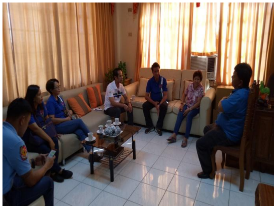
A courtesy call to the Local Chief Executive of Jones for the conduct of a special training on Rabies for the Liga ng mga barangay in the municipality.

In coordination with the Provincial Veterinary Office (PVET), Provincial Health Office (IPHO), Local Chief Executive (LCE) and Liga ng mga Barangays (LMB), a special meeting was conducted which aims to facilitate dog impounding in all barangays in order to decrease the number of stray dogs in the area and eventually decreasing the number of bite victim brought about by these stray dogs.