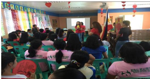
The Assistant AHYD coordinator during the Q&A portion where prizes are given to the participants