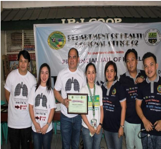
The Isabela Provincial Jail Warden awards the TB personnel a Plaque of Appreciation in cognizant of their effort on TB advocacy and active case finding