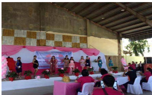
The Search for Sexy.Preggy begins !