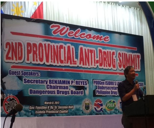
The Secretary of the Dangerous Drugs Board delivers his message during the summit