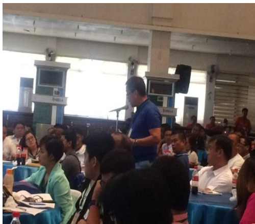
One of the highlights of the drug summit is an interactive forum