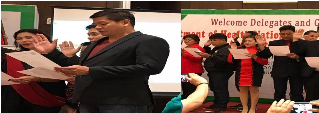
The newly elected officers for 2018-2019 Department of Health National Association of Dentists