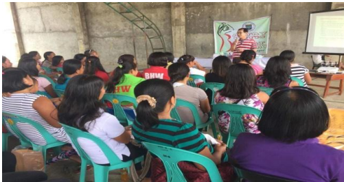
The Municipal Mayor of Gamu gives his opening message to everyone