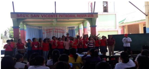
The Barangay Officials and Health Workers oath to protect the welfare of pregnant women