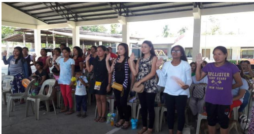
Pledge of Commitment for Safe Pregnancy and Delivery among the pregnant women