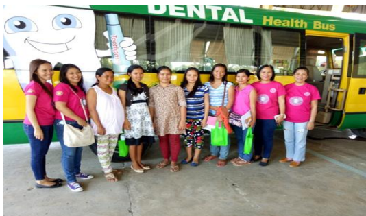
The Dental check-up as one of the vital services for all pregnant women.