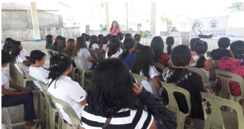
The participants actively listen to the lectures from the Provincial MCH coordinator regarding rationale and objectives among the participants