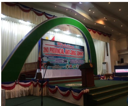
The 2 nd Provincial Anti-Drug Summit held at Gov. Faustino N. Dy Sr. Session Hall, Isabela Provincial Capitol

In finality, the Province of Isabela sees this summit as a valuable platform to influence Isabeleños to actively participate in the fight against drug abuse.