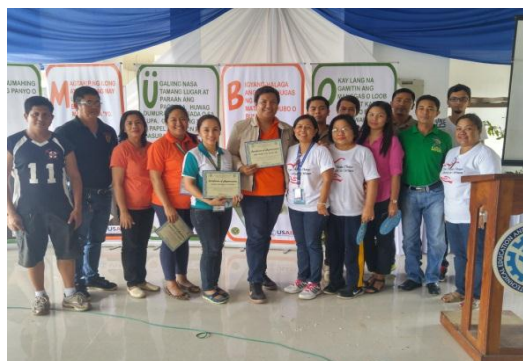
Left: The different resource speakers empower most women students of TESDA. Right: TESDA staff awards the certificates after the stimulating and motivating health awareness activity.