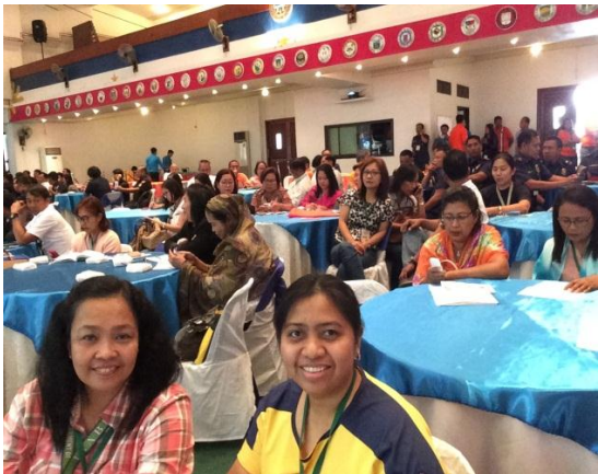
The Medical DParticipants of the 2 nd Provincial Anti-Drug Summit excitedly sits in anticipation for the meeting.