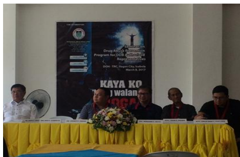
Keynote speakers from the office of the Solicitor General and Dangerous Drugs Board