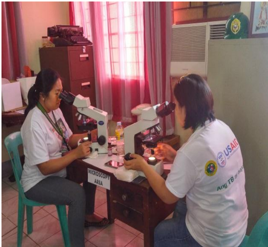
Active TB case finding prompts the IPHO Medtechs to perform direct sputum microscopy work