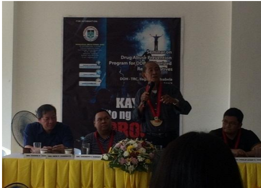
Question and answer portion between the participants and the speakers.