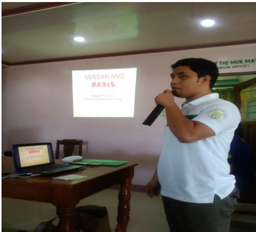
The Assistant Provincial Rabies Coordinator gives information about transmission as well as prevention of Rabies.