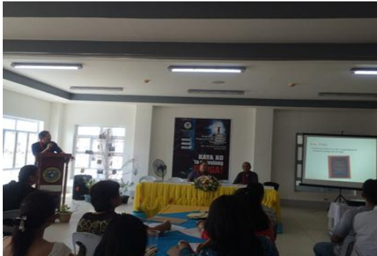
A lawyer from the Office of the Solicitor General lectures on “ Oplan Sagip: Guidelines on Voluntary Surrenderers of drug abuse ”.