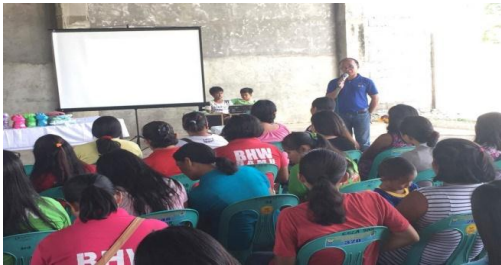
The Health Education & Promotion Officer (HEPO) discusses the rationale and objectives of the activity among the participants