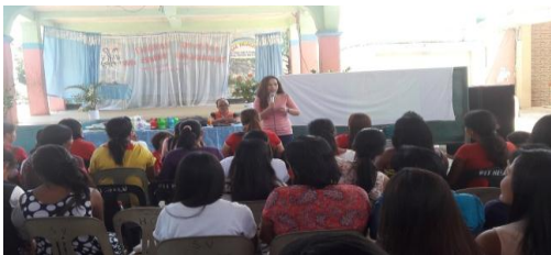
The MCH Coordinator discusses the Maternal Health in Pregnancy