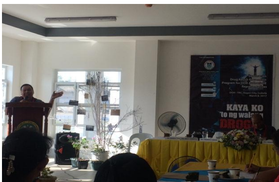
(Top) Secretary of Dangerous Drugs Board lectures on the Medical Aspect of Drug use, (R) a lawyer from the Dangerous Drugs Board tackles on “the Legal Aspect of Drug Abuse”