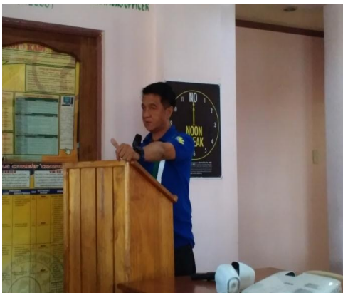
The Provincial Veterinary Coordinator emphasizes to all barangay captains their important roles in the implementation of dog impounding in their areas of concern.