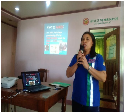
A representative from the Provincial Veterinary office discusses basic facts about Rabies.