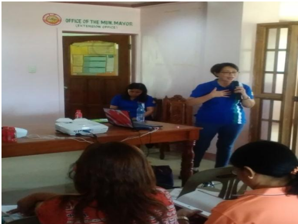
The Assistant Provincial Veterinary Officer presents the situation on Rabies Bite victim in the municipality of Jones and its impact