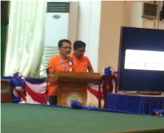
(Top) Acknowledgment of guests and participants by the Isabela- Provincial Anti-Drug Abuse Council Secretary, (Left) I-PADAC Action Officer welcomes the participants of the 2 nd Provincial Anti-Drug Summit