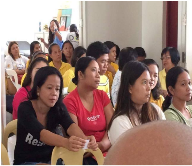
The participants as they view and react with FP messages through social media (film showing)