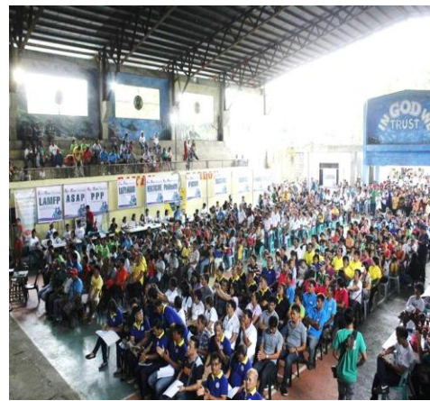
The community of Cordon gather around the town whie waiting for the activity to begin.