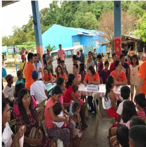
Barrio folks excitedly wait their turn for registration and vital signs taking.