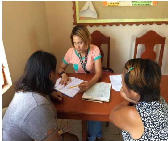
Day 1: Record Validation with health workers of Jones , San Pablo and Reina Mercedes Rural Health Units