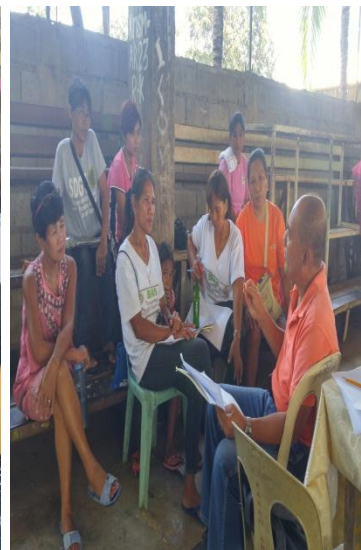
Day2: Focus Group Discussion(FGD) among BHWs, TB patients, Post Partum women using set of questions to determine their knowledge regarding health services offered by the RHUs.