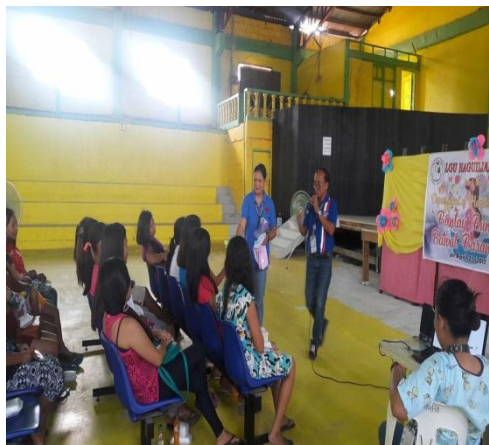
The Health Education Promotions Officer facilitates the Q&A regarding maternal care activity for the pregnant women.