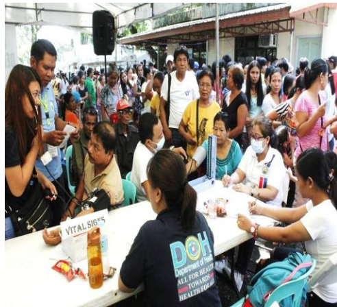
IPHO Nurses and GFND Nurses with the help of some RHU staff attend to patients for consultation.