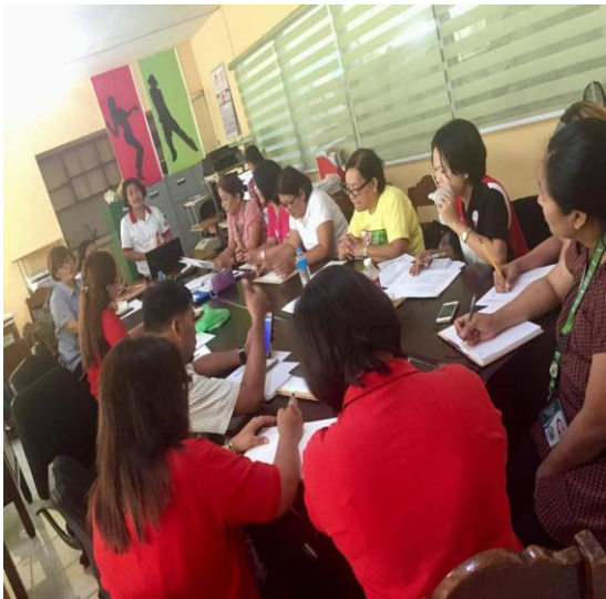
The Developmental Management Officer of the Provincial DOH presides the meeting.