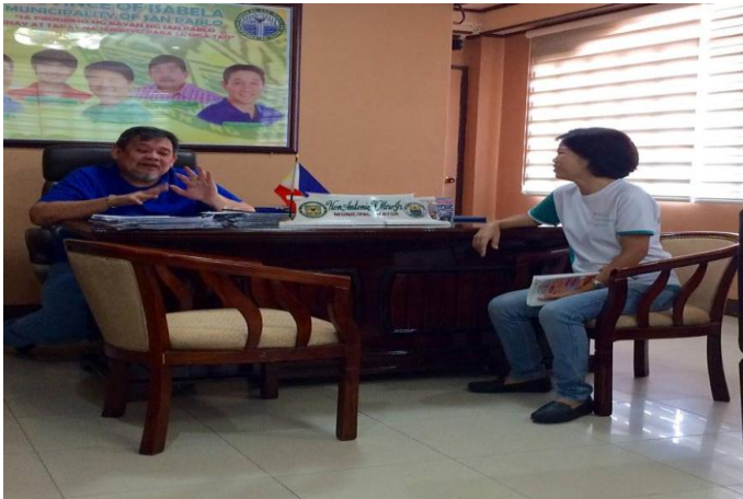
Courtesy call and feedbacking of the activities to the Local Chief Executive of San Pablo, Isabela

The two teams set forth for the actual scorecard validation: