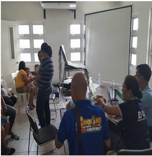
LuzonHealth and IPHO Health Education Promotions Officer and supervising Nurse addresses the factors that contribute to unmet needs for Modern Family Planning.