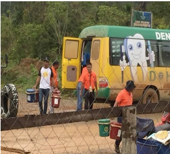
The IPHO staff unload the commodities for the people in the Patrol Based Camp 2.