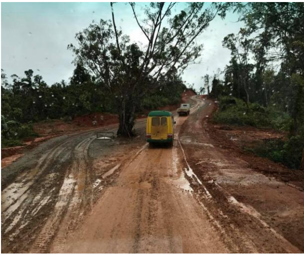
The muddy 30 km road leading to the Ilagan-Divilacan road rehabilitation and improvement project