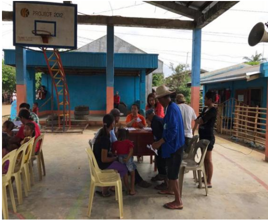
The two (2) medical doctors attend to patients of Sindon Bayabo