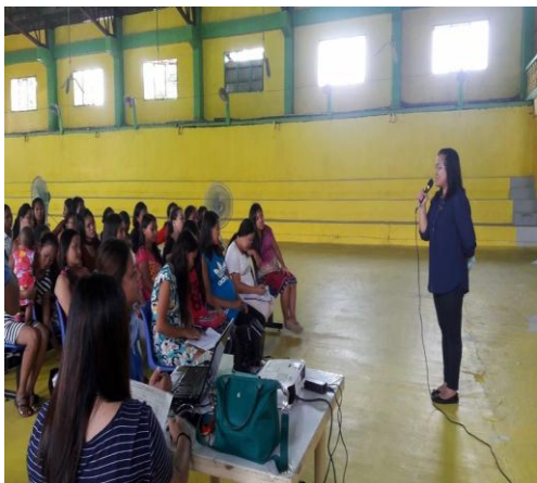
The Municipal Health Officer closes the program with a powerful message of commitment from everyone present in the event.