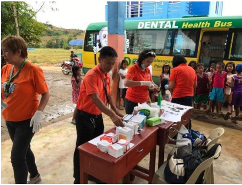
Even kids bravely line up for possible tooth extraction