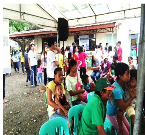
The people of Cordon while waiting to avail of the Medical/Dental Services that the province delivered to their place.