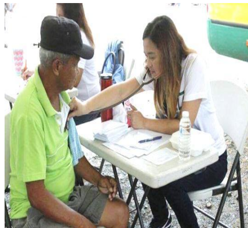
Outpouring of patients while the health team from IPHO and GFNDY attend to their health concerns