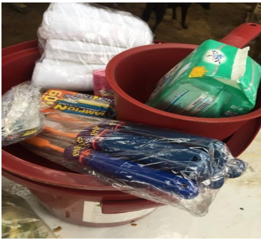
The contents of the Hygiene Kit which made the beneficiaries contented.