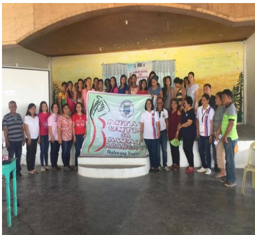
Group picture of the Barangay leaders, together with the participants and Health workers from RHU Quirino and the team from the Provincial Health Office