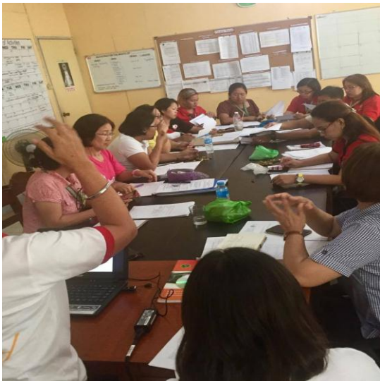
Meeting of the minds..... deliberation , planning and scheduling of the actual validation of the LGU scorecard per district.

The two teams set forth for the actual scorecard validation: