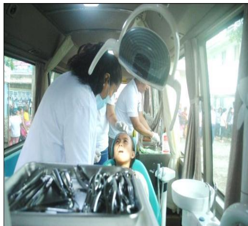
Provincial Dentist leads the Dental team in providing Oral Health care