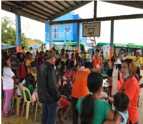
Constituents of Barangay Sindon Bayabo, City of Ilagan, line up for the medical /Dental mission.

Following the event, a special trip to the Ilagan- Divilacan road rehabilitation and Improvement project, Forestry Unit Office took place. Here, constituents from the Based Camp were provided with Hygiene kits and water jugs for use.