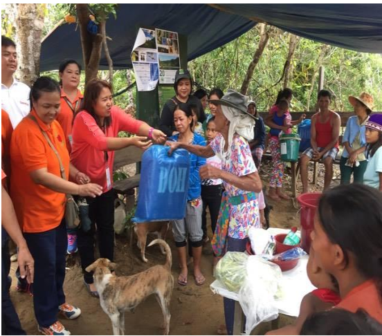
Happy faces were visible among the constituents as they receive their hygiene kit and water jug.