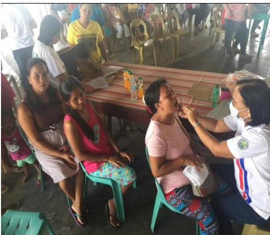
The Provincial Dentist performs oral examination as part of quality Maternal Care