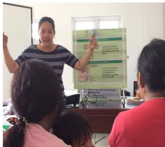
A partner from LuzonHealth facilitates during the Family Planning discussions