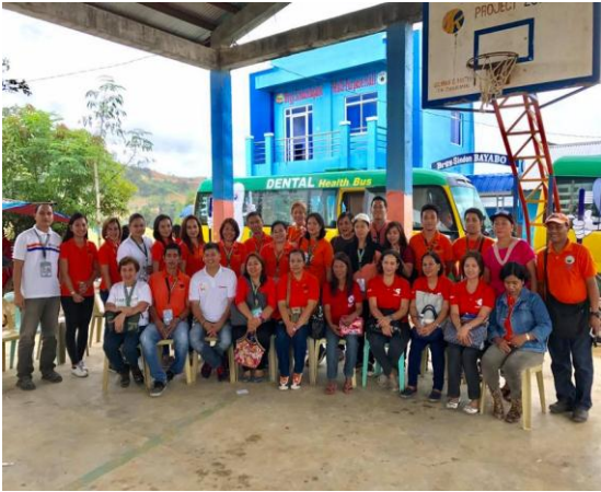
The PGI's team with the barangay officialdom of Sindon Bayabo strike a pose after the activity.