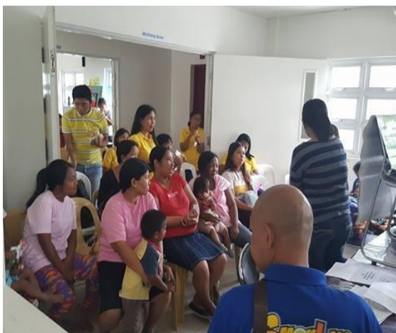
Women of reproductive age (WRA) from Cabagan attend the Usapan session.