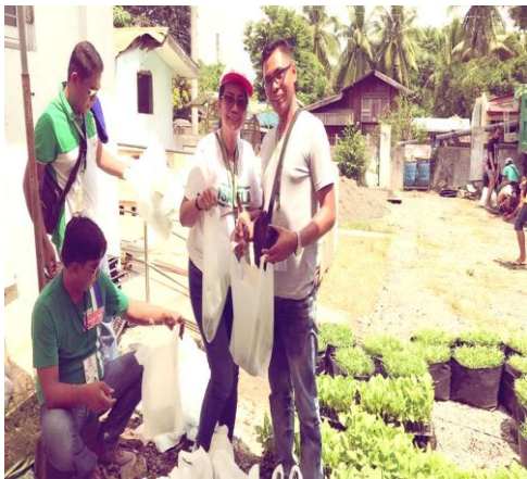
The Provincial Nutritionist-Dietician facilitates the distribution of seedlings for identified parents thru the BNS with a help from the Department of Agriculture.