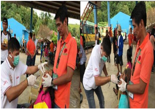
tist from the e performs tooth stituent of Brgy.