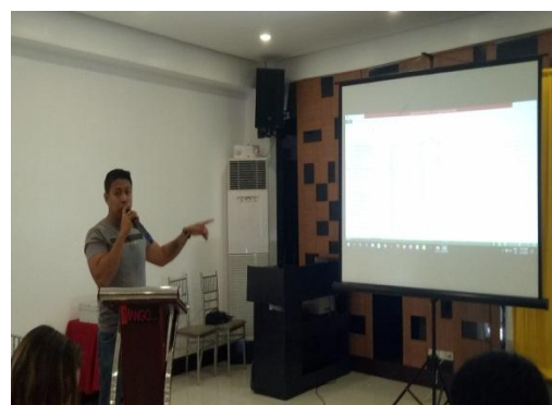
The Malaria point person from the City Health Office of Ilagan reports their accomplishments in eliminating Malaria.