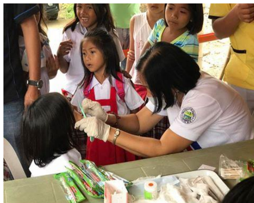
The Provincial Dentists performs Tooth Extraction and fluoride application to day care pupils and grade school (Grades 1-3) pupils.