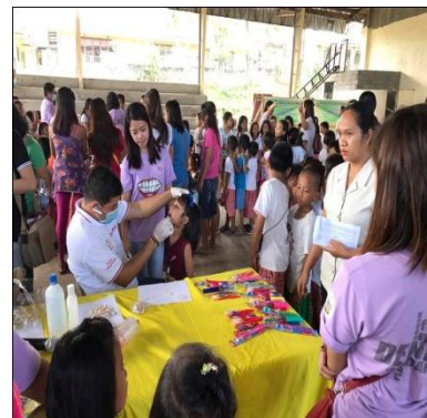
The dental team at work! Demonstration on the proper tooth brushing technique, actual flouride application and intensifying advocacy on the Dental Health Programs .