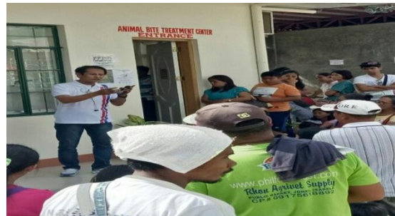
The Provincial Rabies Coordinator talks about Rabies prevention among patients that day.