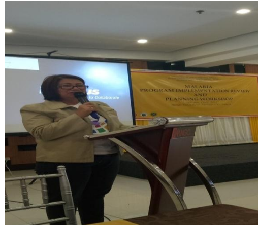
The DMO-V from Regional Office delivers her closing remarks