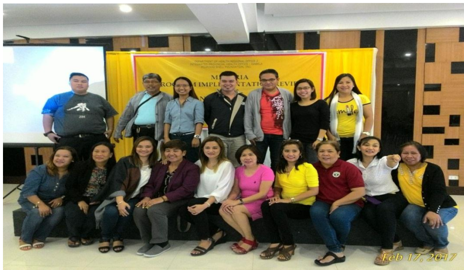
The Chief of Hospitals, Municipal/City Health Officers from the different RHU/CHO together with the Provincial Health Officer-I for the group picture.