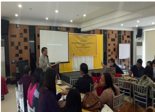
The Information Officer from the Provincial Government of Isabela graces the affair with his welcome address in behalf of the Provincial Administrator.

The year 2016 was a significant year for the National and Provincial Program management as well as those working in the frontlines in eliminating the Malaria due to the dramatic decrease of cases since 2014 wherein the Province of Isabela has a zero case for two(2) consecutive years (2015 and 2016). As a result, Isabela is currently working hand in hand as we draw nearer for a Malaria-free Province in the year 2019.