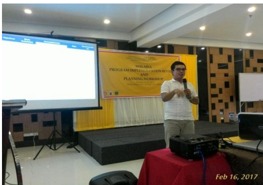
The Municipal Health Officer of Dinapigue, Isabela presents his Malaria Plan of Action for the Year 2017