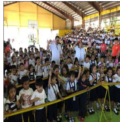
Stakeholders from the LGU all volts in for the activity, teaches the kids on tooth brushing drills