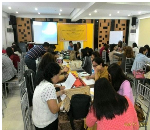
Participants from District II and III draft Plan of Activity in their corresponding areas of responsibility for the year 2017.