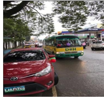
The kick-off activity of the Dental Health Month is a fabulous motorcade by the participating municipalities