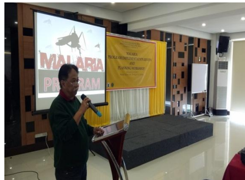
The OIC Provincial Health Officer-II conveys his warm welcome to the participants during the Program Implementation Review at Mango Suites Hotel at Santiago City, Isabela