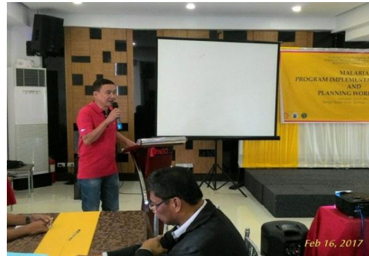
The Regional Malaria Coordinator of the Department of Health-Regional Office discusses the status of Malaria cases in the region.