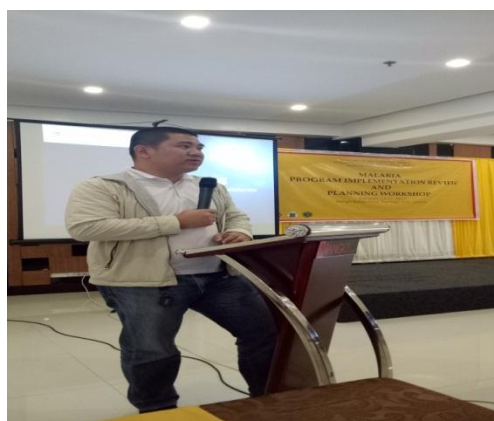
The Project Officers from Pilipinas Shell Foundation Inc. (Movement Against Malaria) extends their heartfelt gratitude for continuously supporting the Movement Against Malaria Program