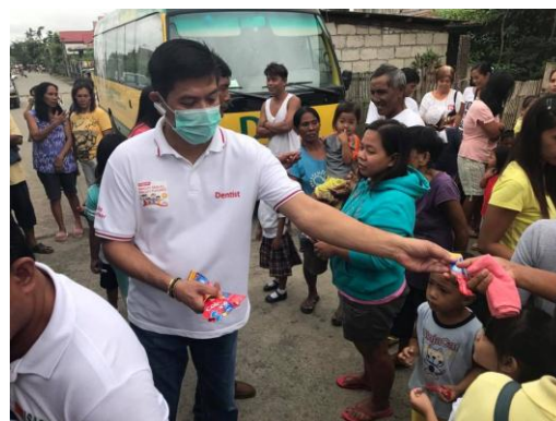
The PGI's partner COLGATE philippines shares toothbrushes and toothpastes to everyone.