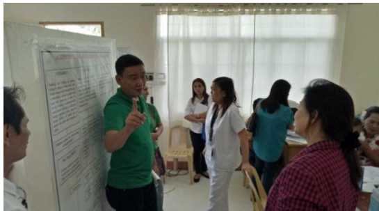
The Regional Coordinator talks about the importance of animal bite categorization and free vaccination provided by DOH.