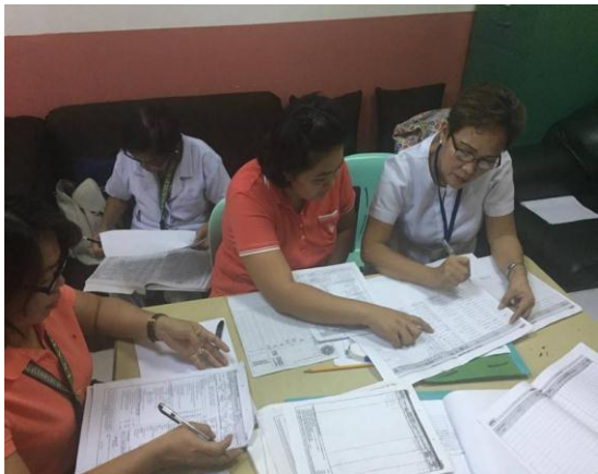
Actual counting of FP modern method acceptors for the Milagros Albano district hospital

Having conducted a needs assessment cum review of the Family Planning records of the district hospitals, particularly in Milagros Albano District Hospital of Cabagan and the Cauayan District hospital, the next step is to use the information collected to make wise, strategic programmatic decisions. The needs assessment information should help guide field workers in their efforts to pinpoint the extent of needed care on family planning, identify those environmental factors which may help or impede intervention efforts and ultimately design a service delivery structure which can respond effectively to what is needed.