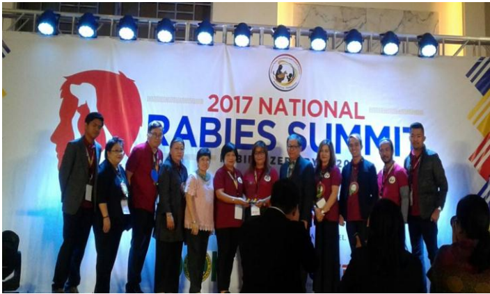
The Top Performing LGUs for Rabies-free status for 2016