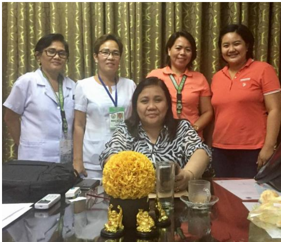
The FP management team of Milagros Albano District hospital with the LuzonHealth partner and IPHO's FP Coordinator