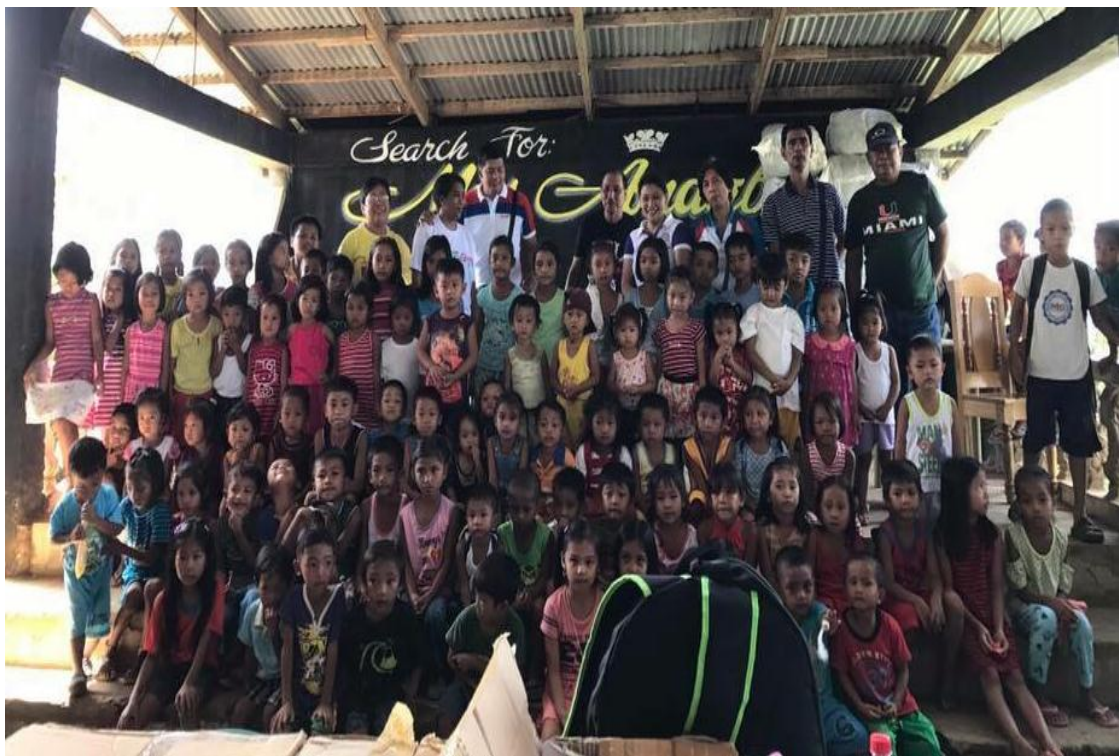
The daycare pupils with their teacher flashes their best smiles in Benito Soliven

This is through the coordination of the Provincial Government of Isabela, the Department of Health and the Local Government Units of Jones, Benito Soliven and Aurora.