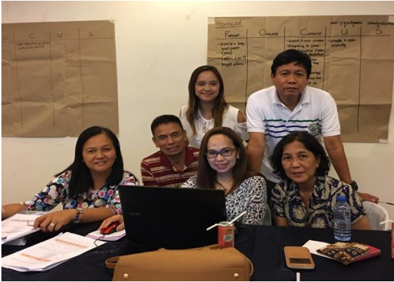
The PGI team pulls it together as shown in their smiles