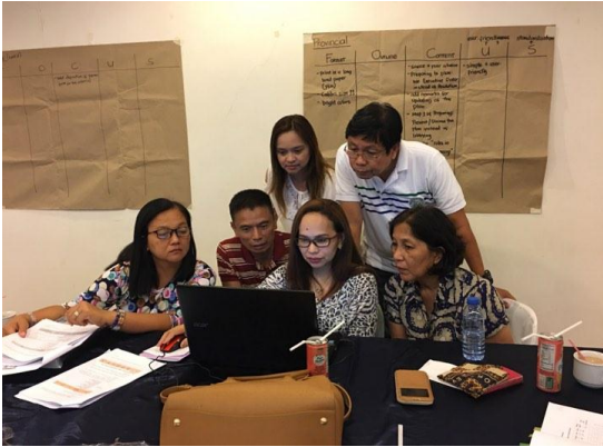
Representatives from the Provincial Government of Isabela give their recommendations on how to make the manual as comprehensive as it is envisioned to be.