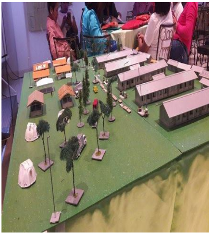
A miniature picture of an ideal evacuation site