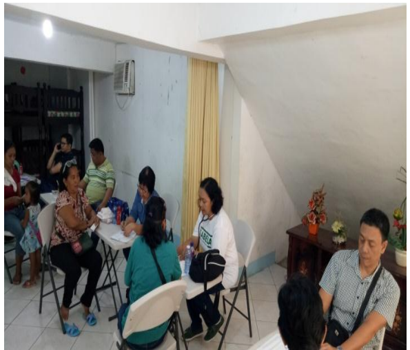
The Medical Team takes turn in providing accessible health services to patients of Roxas