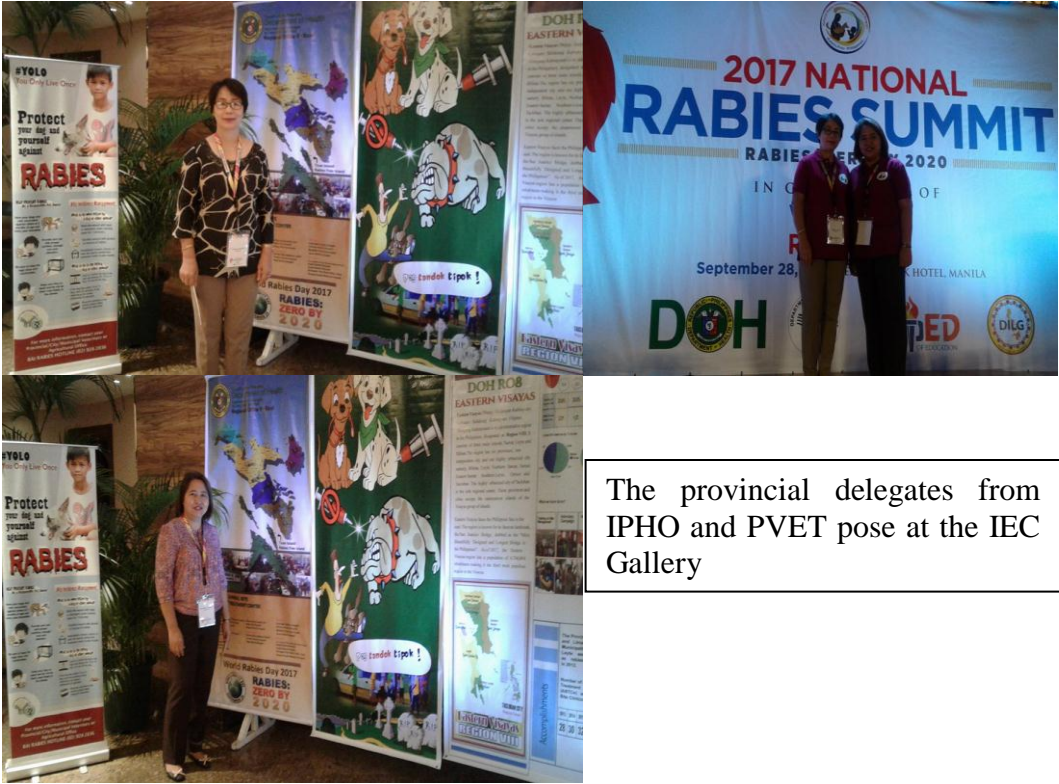
The provincial delegates from IPHO and PVET pose at the IEC Gallery