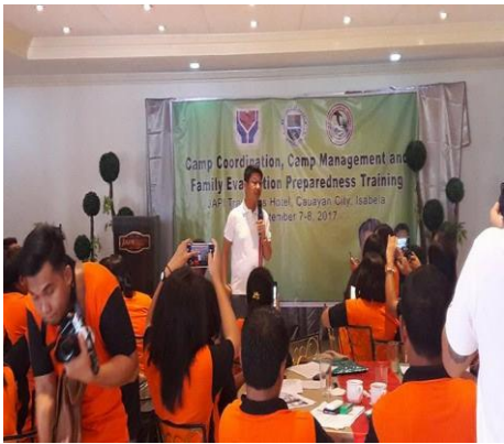
Gov. Faustino “Bodjie” Dy graces the activity by acknowledging the importance of the training-workshop and stating the full support of the Provincial Government of Isabela for the safety of all Isabeleños.