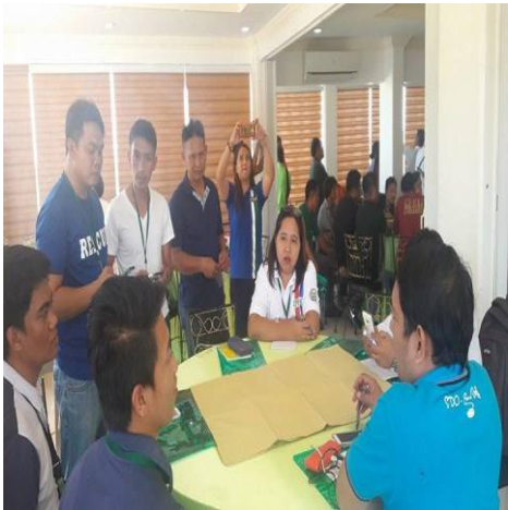
WORKSHOP PROPER...Illustrating a typical evacuation center and maximizing its facilities