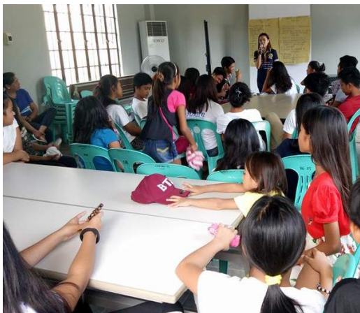
The Assistant AHYD coordinator discusses the contributory factors, consequences and how to prevent teenage pregnancy