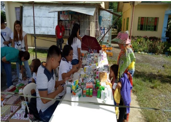
Medicines all ready for distribution among clients after their consultation