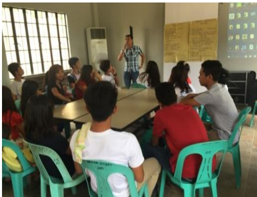
The Barangay Captain gives his inspirational message to everyone

Teenage pregnancy has become a public concern which has generated a great deal of attention in the province. The Isabela Provincial Health Office conducted the Adolescent Health Forum last September 8, 14 and 15 at the Municipalities of Gamu and Naguilian, Isabela respectively. The purpose of the said activity is to address adolescent issues on teenage pregnancy as well as promote responsible decisions among youth thru active participation.