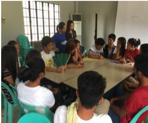
The IPHO staff facilitates the workshop on the causes of teenage pregnancy