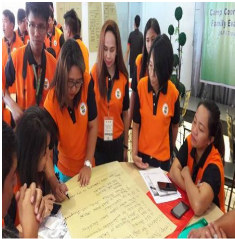
Making a list of an ideal evacuation center