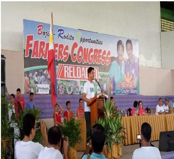
Hon. Governor Faustino Dy III gives his heart-warming message to everyone