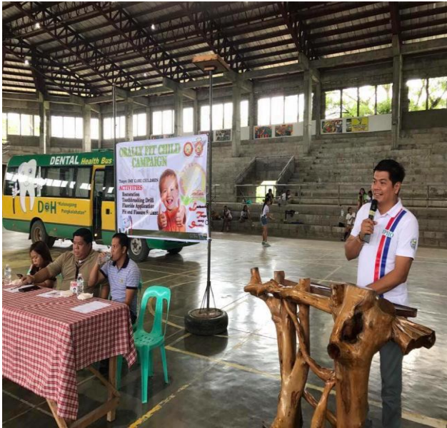
The Provincial Dentist lectures on Basic Oral Health Care to daycare pupils of Jones, Isabela