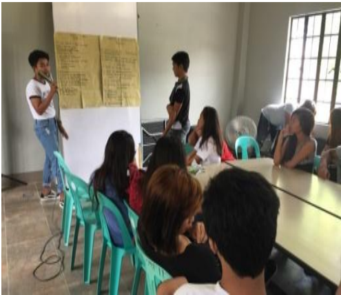
Participating youth presents the final output on the causes of teenage pregnancy