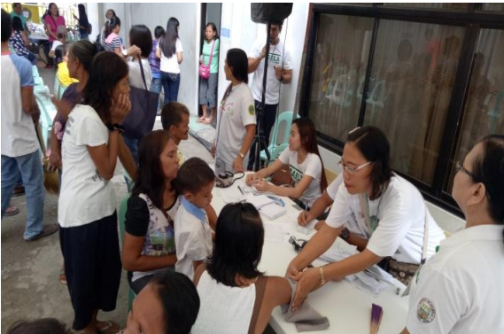
Field health nurses admit patients from the different barangays of the municipality