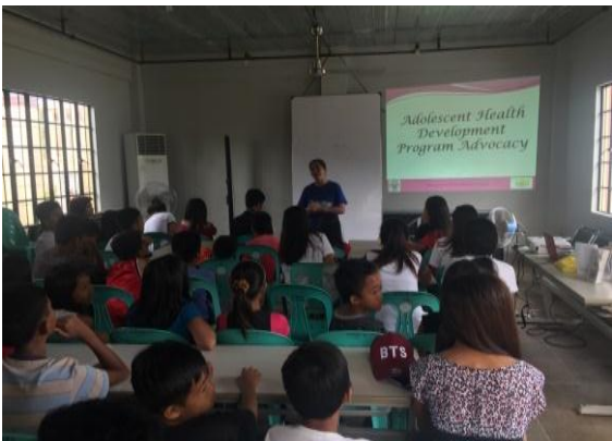
The Provincial AHYD coordinator discusses the background and rationale of Adolescent Health Youth and Development