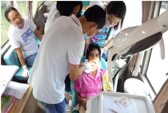
The pool of Provincial and municipal Dentists attend to the oral health needs of the constituents