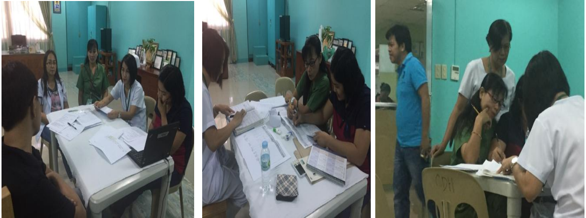
The team scrutinizes the different Family Planning Report forms of the Cauayan District Hospital and tallies acceptors and users of the different family planning methods