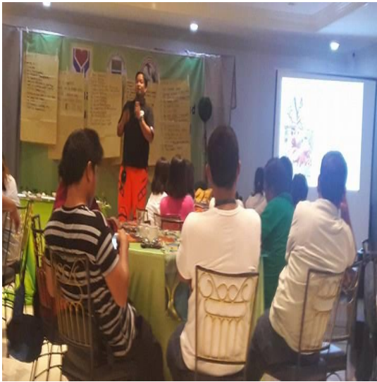
A talk on Livestock Emergency Guidelines and Standards , making everyone realize that aside from humans, there is also a need to preserve livestock and other domestic animals in times of disasters.