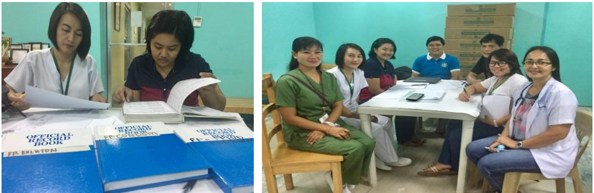
The FP management Team of the Cauayan District Hospital poses with the Chief, the LuzonHealth Partner and the IPHO FP coordinator after the activity.