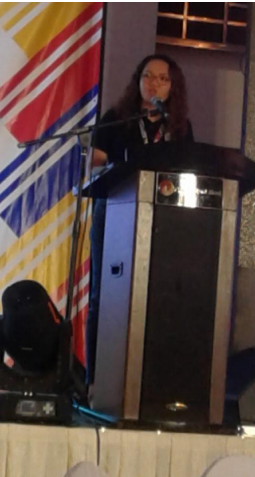
Together for Rabies: 0 by 2020 from the Department of Agriculture, World health Organization, Global Health for Rabies Control and DepEd.