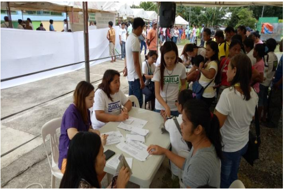
Field Nurses admit patients before they usher them in for consultation