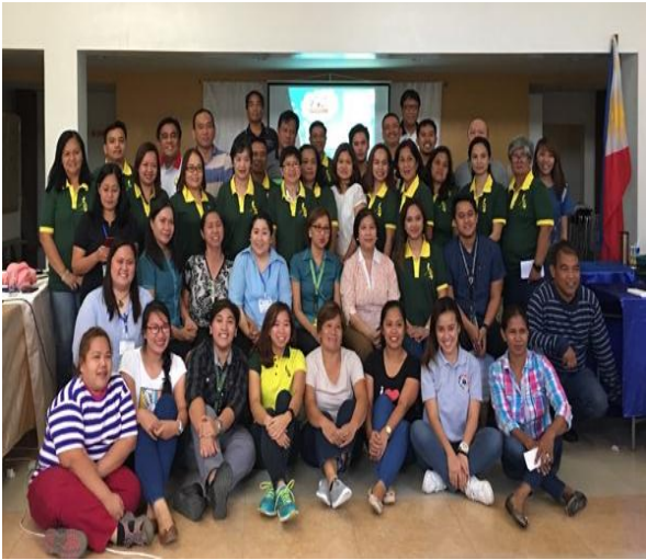
The facilitators get the local view of the functioning of the DRMM-H system at the regional, provincial, district and community level