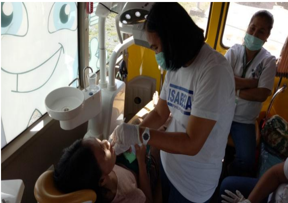
A child gets a tooth extraction from the provincial dentist