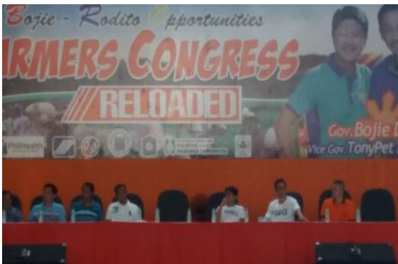
Farmers Congress: Delfin Albano 8-9-17

Governor Bojie Dy III and Vice Governor Antonio Albano led the Farmers Congress Reloaded at the Municipality of Delfin Albano