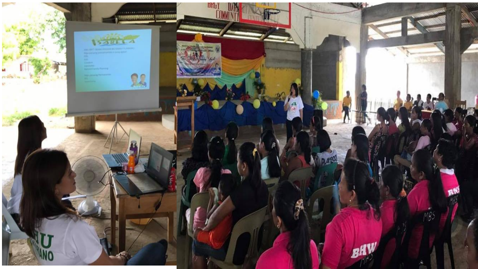
The Provincial Family Planning program coordinator lectures on the program through a very participative way.