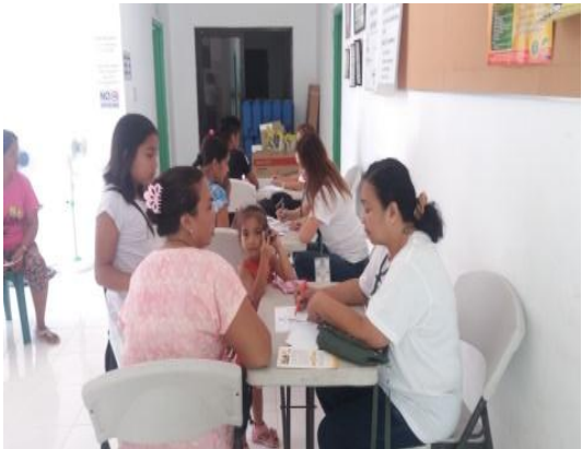
IPHO medical doctors provide consultation and medical advice to a mother with a sick child.