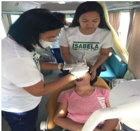
The Provincial Dentists performs tooth extraction to a child.