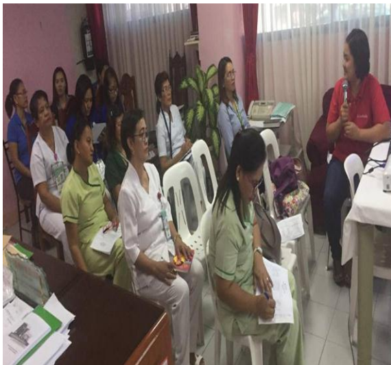
LuzonHealth partner discusses on FP Infomed Choice and Volunteerism