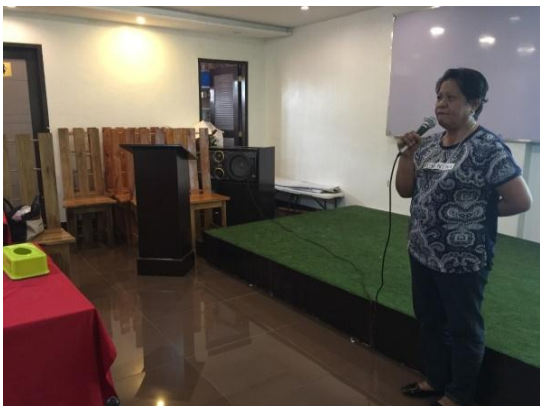
A participant from the Gov. Faustino N. Dy Sr. Memorial Hospital shares her reflection on the partograph training