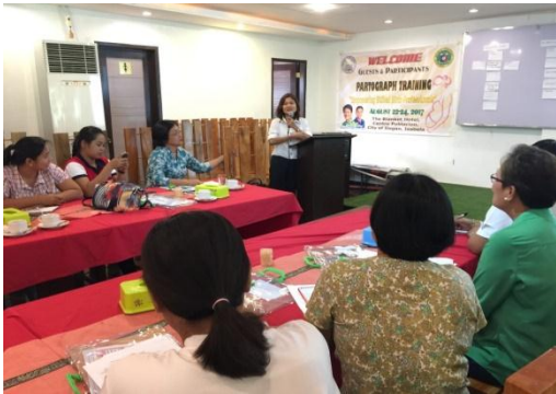
The MCH Medical Coordinator-Regional Office discusses the Basic Emergency Obstetrics and Newborn Care (BEmONC) overview