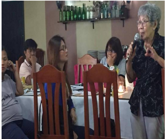
A Consultant of a Civic Society Organization (CSO) discusses on the interim guidelines for the monitoring and reporting of Family Planning Performance.