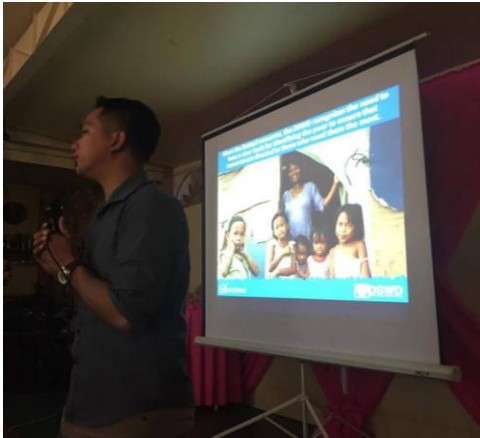
The speaker talks about the definition of the “poorest of the poor”