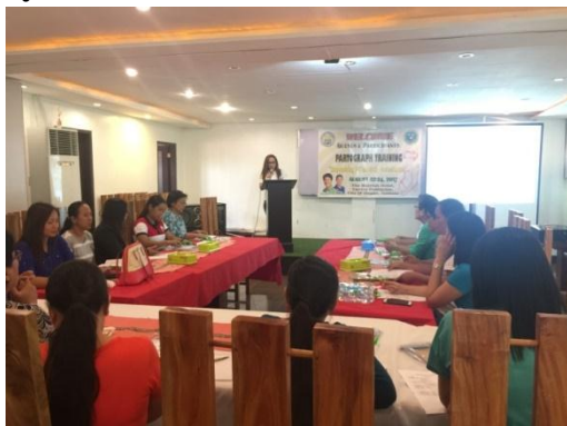
Acknowledgment of guests and participants by the Provincial MCH coordinator

The 3-Day Training-Workshop was packed with information on Philippine Health Agenda and updates on Maternal and Newborn health provincial situationer, Basic Emergency Obstetrics and Newborn Care (BEmONC) overview and a workshop on the proper use of Partograph based on scenarios. In conclusion, ,participants were asked to accomplish the learning application plan as basis for post-training evaluation.