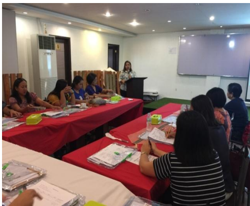
The Administrative Officer III gives her lecture on the Essential Intrapartum Newborn Care