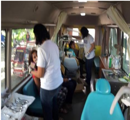
Our inspired Provincial Dentists of Isabela Provincial Health Office led in giving Dental Service for the promotion of a better smile of our constituents at Delfin Albano.