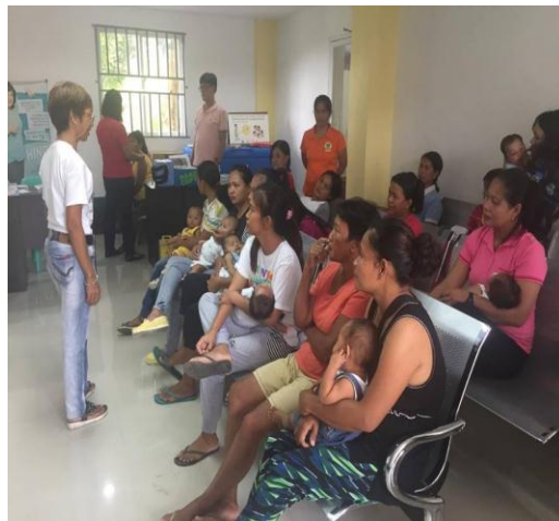
A Barangay Health Worker applies her information- giving and counselling skills on Family Planning