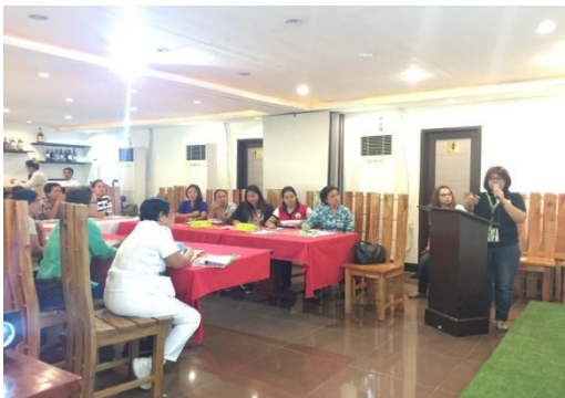
The participants actively listen to the lectures from the Developmental Management Officer of the Provincial DOH regarding the proper use of partograph