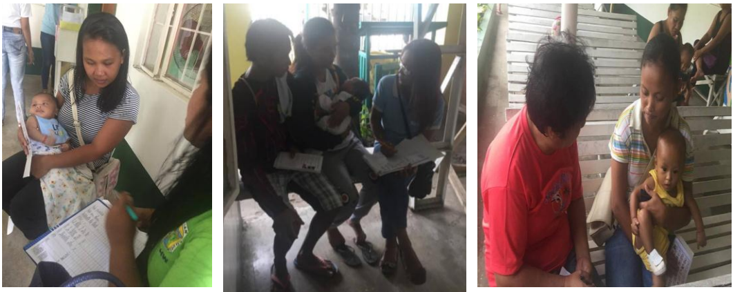
Several barangay health workers practice on one-on-one counseling to women with unmet needs