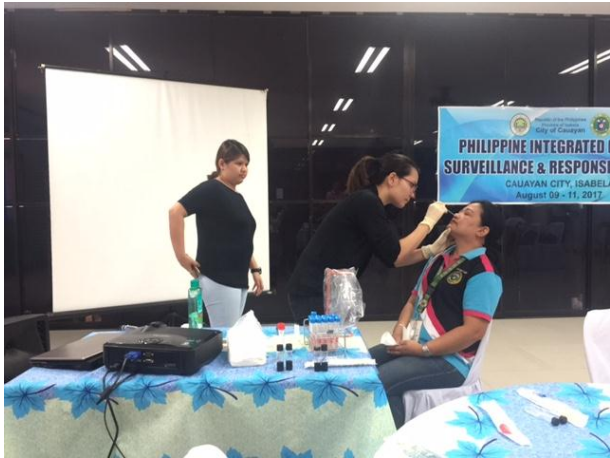
The IPHO PESU Nurse coordinator participates in the demonstration on nasopharyngeal swab.