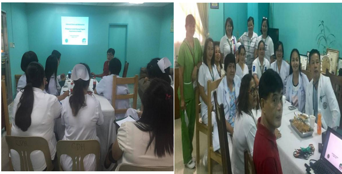
LuzonHealth partner deliberates on Informed Choice and volunteerism at the Cauayan District Hospital’s Family Planning Team

As to date, 3 district hospitals of Isabela were already oriented on ICV. This aims to provide Universal Access to quality information and services to men and women whenever and wherever needed and enable them to make ICV to use the modern FP method best suited to his/her needs.