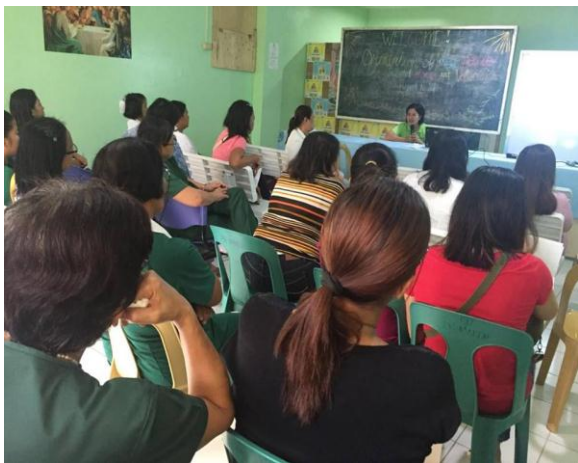
The FP team and staff of MARDH oriented on ICV