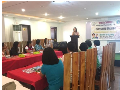
The Provincial Health Officer I delivers her welcome remarks to the participants