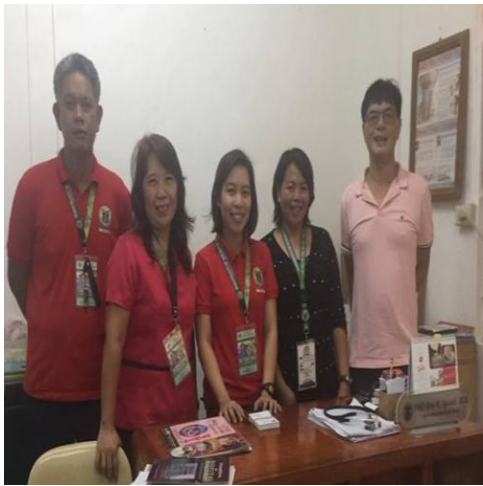
A thankful MHO staff strikes a pose after the activity