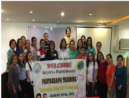
Group picture of the participants from the different RHUs and Hospitals together with the DMO V, MCH Medical Coordinator from the regional office and the team from the Provincial Health Office