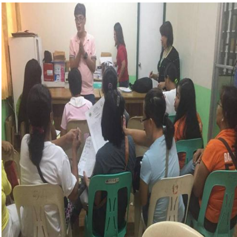
The LuzonHealth partner addresses the factors that contribute to unmet needs

The activity aims to reach out to women with unmet needs through the integration of Family Planning (FP) and Antenatal Care (ANC) into the Expanded Program on Immunization as well as guide the health workers in using the Expanded program on Immunization (EPI) as a venue to provide FP and ANC referral messages to encourage mothers with unmet FP and ANC needs to learn more about FP/ANC services available in the health facility such as counseling and other services.