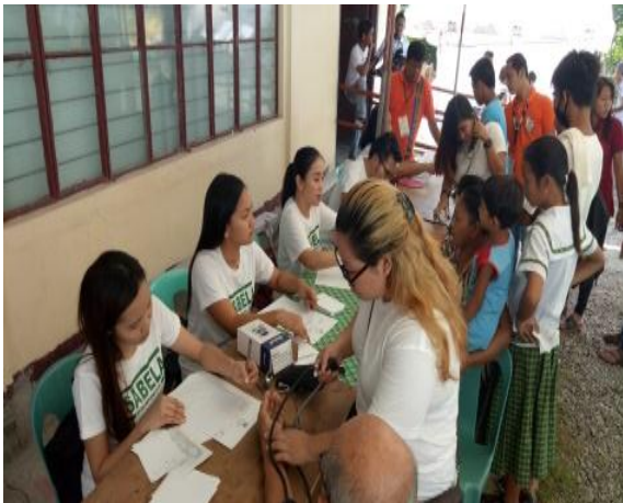
IPHO Nurses together with the staff of RHU of Reina Mercedes admit bulk of clients in the municipality