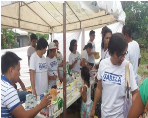
The provincial pharmacist dispenses medication prescribed by doctors to the patients.