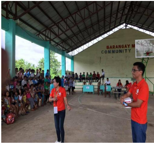
The City Dentist demonstrates the Proper Tooth Brushing Technique to the eager daycare pupils.