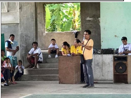
Orally Fit Child Campaign San Manuel Isabela. The Municipal Health Dentist Lectures on Basic Oral Health Care, Application of Fluoride, Tooth Restoration and Pit and Fissure Sealant