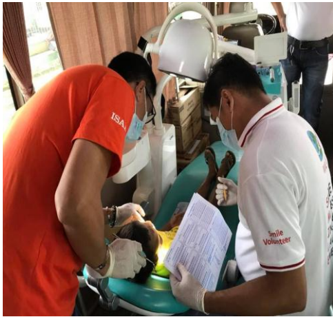
Application of Fluoride and Tooth Restoration to daycare pupils of Cauayan City.