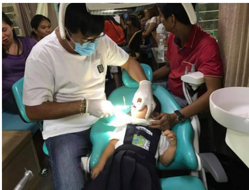
Orally Fit Child Campaign Angadanan Isabela Fluoride Application, Pit and fissure sealant and Tooth Restoration