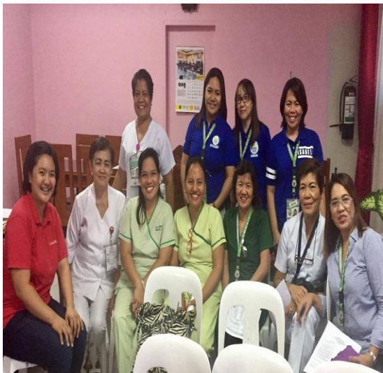
The GFNDY Memorial Hospital Family Planning Team after the orientation.