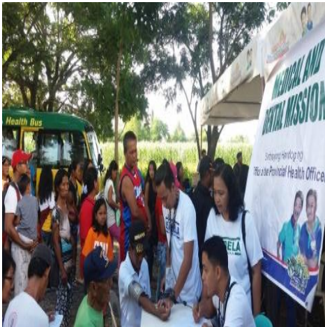
Nurses from the Field Health Services assist in the admission of patients.