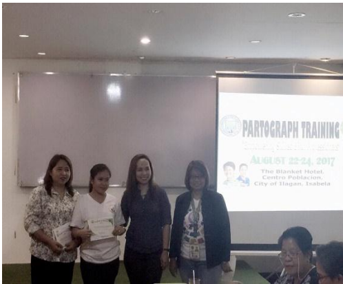
Awarding of Certificates culminate the activity