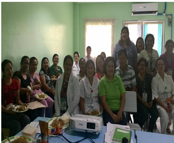
A pose with the Chief and the staff of the Manuel A Roxas District hospital after the orientation.