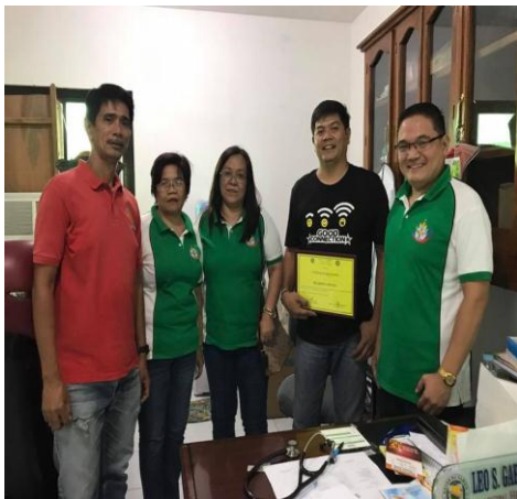
The Municipal Health officer awards the Plaque of Appreciation to the Provincial Dentists for completing the Dental Services at Ramon, Isabela.