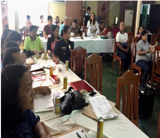
The R2 Regional Implementation Monitoring Team plan for the next steps