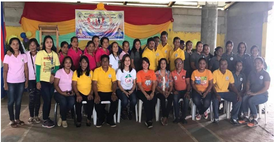
San Mariano RHU staff, IPHO representatives and the barangay officialdom poses for a souvenir shot after the Family Planning Month Launching