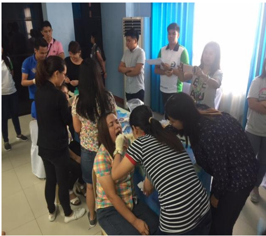
Return demonstration on nasopharyngeal and throat swab by the participants.