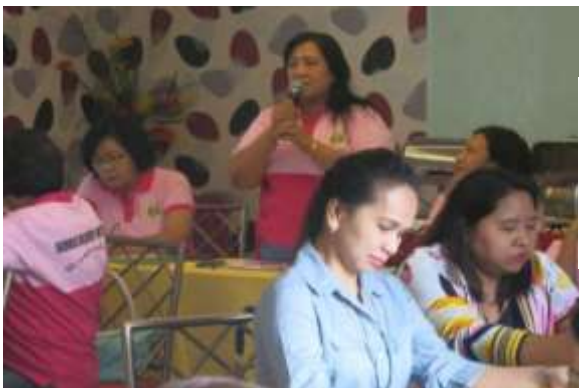
The president of IMAP-Isabela Chapter shares the licensing requirements among private birthing centers

With full attention and active participation from the participants, the assembly ended with wide array of commitments in the light of helping each LGU reach its desired aspirations for quality delivery of Family Planning and Maternal, Newborn, Child Health and Nutrition services.