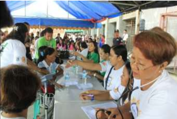
IPHO Nurses with the help of some RHU staff attend patients for consultation.