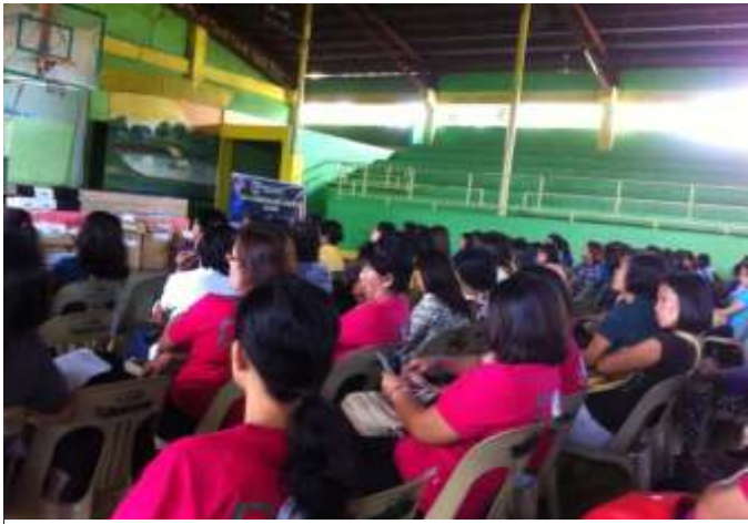
Participants from District II (above) and District IV (below) pay attention to the presentation of Non-Communicable Diseases trends and updates at the Summit