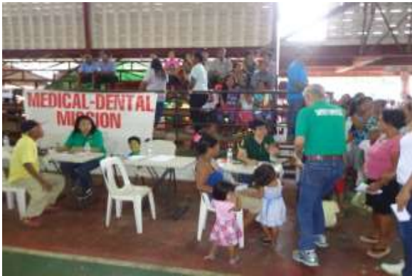
The pool of Medical Doctors render medical attention to patients of Gamu, Isabela