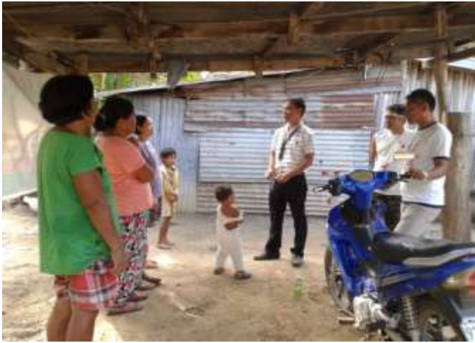
IEC campaign on Dengue cases conducted at Barangay Furao, Gamu, Isabela in January 2016