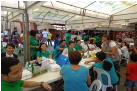
Field Nurses admit patients before they usher them in for consultation