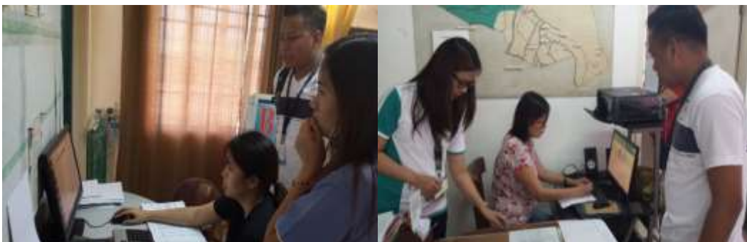
L: Cauayan I, R: Cauayan II during their practice encoding of TB cases