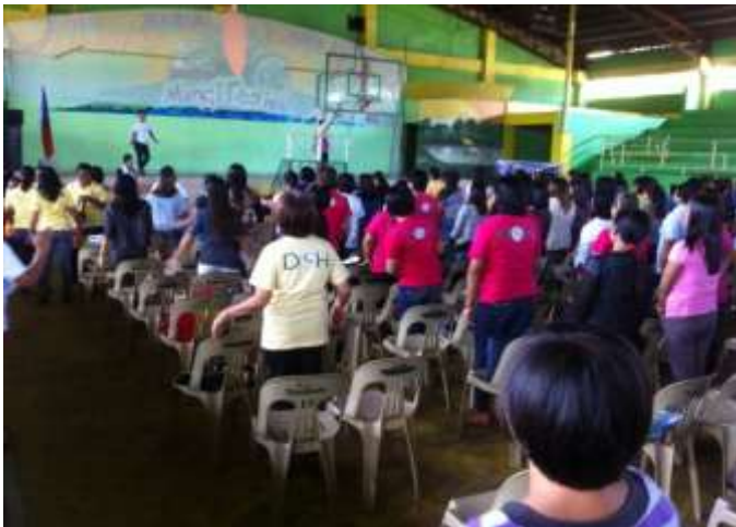
HATAW exercise spearheaded by the DOH staff