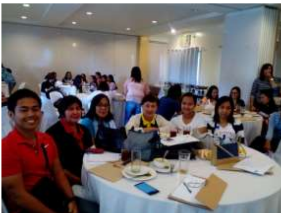
The Orientation program was participated by Public Health Nurses, Midwives and other healthcare members