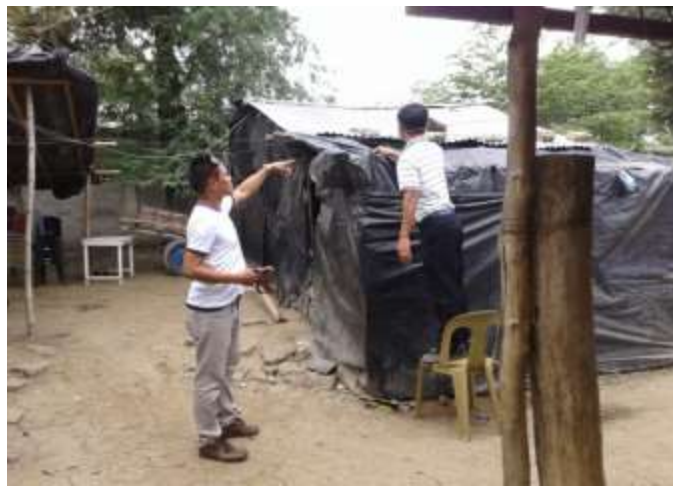
Provincial Sanitary Engineer leads the Search and Destroy of breeding sites of Dengue mosquitoes at Barangay Furao, Gamu, Isabela