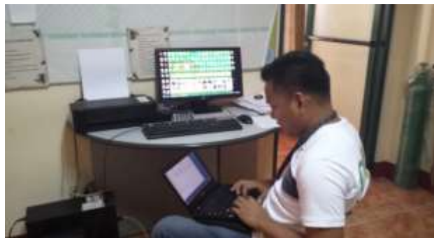
Installation of the ITIS offline version