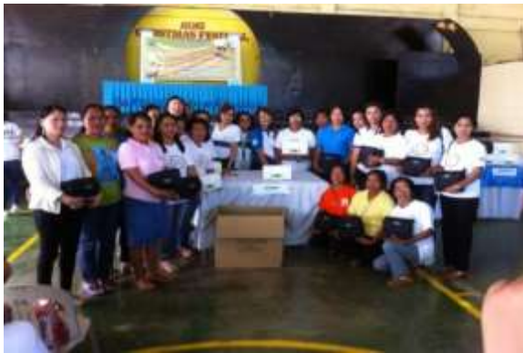
Turn over Ceremony of Glucose Monitoring Kit and Blood Pressure Apparatus to participants from 3 municipalities by DOH – RO2 and IPHO representatives