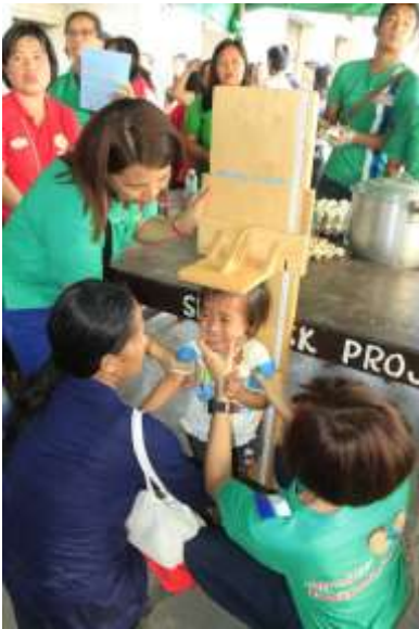
IPHO personnel validate the weight and height of undernourished children of Aurora, Isabela for the BRO-LUSOG Program