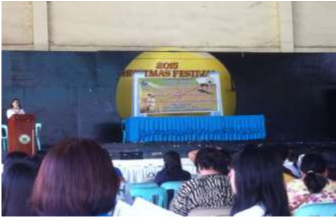
Presentation and acknowledgment of participants by the Development Management Officer III