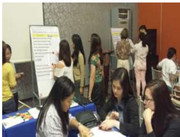
Posting of the accomplishments