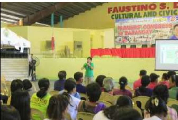
One of the Doctors from PHO enlightens the constituents about the benefits of the BRO-LUSOG program