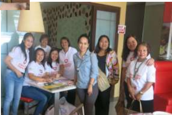
Two Provincial MNCHN coordinators join SIGH MNCHN Team during the registration