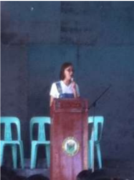
A message from the DOH-Local Health Service Division Chief

One of the Region’s Development Management Officers provides the trends of Non-Communicable Diseases. She also influences the health workers on establishing Hypertension and Diabetes Clubs in their respective municipalities.