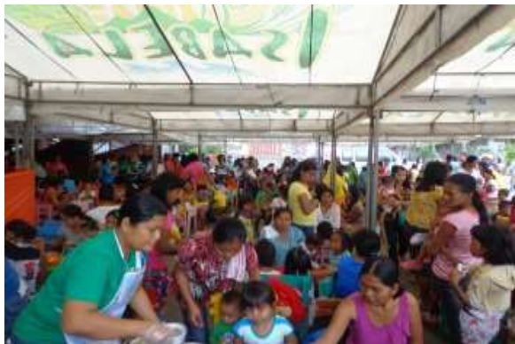
A total of 350 undernourished children receive their share of Gourmix at Gamu, Isabela