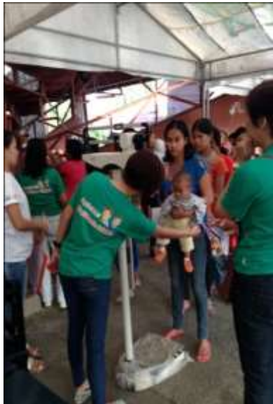
Mothers and caregivers wait their turn to validate the weight and height of their kids.