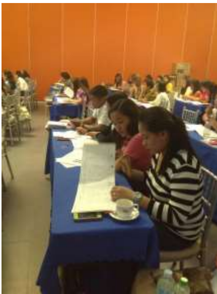
During the validation of reports workshop

The Philippine Coalition Against Tuberculosis (PhilCAT) in partnership with the Isabela Provincial Health Office and City Health Offices of Ilagan and Cauayan City conducted Hospital DOTS records and reports validation workshop for the provinces of Isabela and Quirino. The workshop aims to facilitate immediate consolidation of hospital referrals for the period of third and fourth quarter of last year and also to identify issues and find ways to resolve them. It was also a venue to share and learn the experiences in implementing Hospital-DOTS initiative, thereby improving the DOTS program in the province.