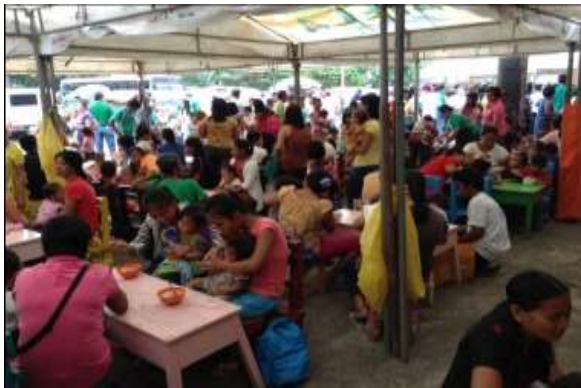
Gamu, Isabela: January 22, 2016