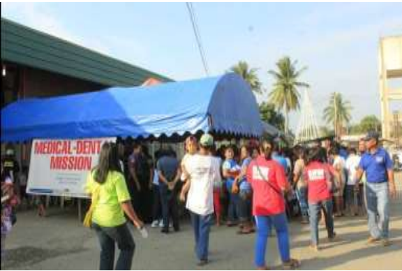
Community people in Aurora gather around the town whie awaiting for the activity