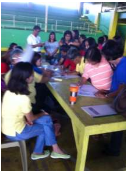
Ongoing registration of participants: Public Health Nurses, Rural Health Midwives, and Barangay Health Workers together with the Tumauni Municipal Health Officer

The Department of Health- Regional Office II conducted a Non-Communicable Diseases Summit for frontline health workers in four (4) districts of Isabela held at District 4, Santiago Gymnasium (January 12, 2016), District 3, Cauayan City Gymnasium (January 13, 2016), District 2, San Manuel (January 14, 2016) and District 1 Tumauni, Gymnasium (January 15, 2016). One of the highlights of the activity is the distribution of Glucose Monitoring kit and blood pressure apparatus among Rural Health Units (RHU) and Barangay Health Stations (BHS) which aims to improve/upgrade the quality health care service delivery among devolved health facilities. The said activity was participated by Municipal Health Officers (MHO), Public Health Nurses (PHN), Rural Health Midwives (RHM) and selected Barangay Health Workers together with the representatives of Isabela Provincial Health Office spearheaded by Dr. Marichu S. Manlongat, Rural Health Physician, Ms. Patria P. Bagaoisan Nurse IV and Ms. Eleanor B. Purisima Population Program Officer III.