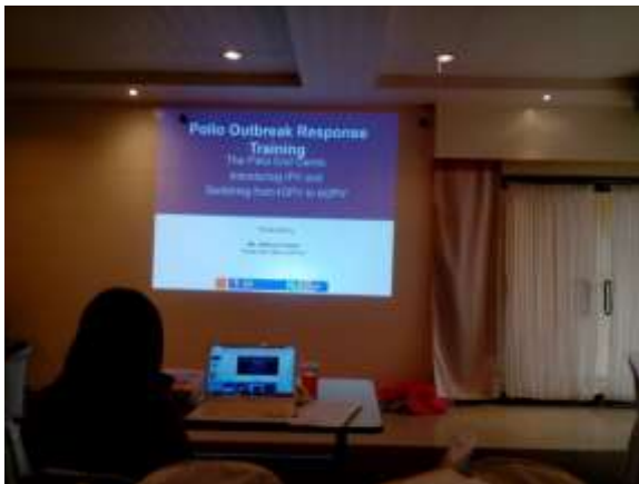
Powerpoint presentation in Polio Outbreak Response Training

Due to low Oral Polio Vaccine 3 coverage and inadequate surveillance for acute flaccid paralysis (AFP), the Philippines has been identified as among the countries at highest risk for wild polio virus outbreak secondary to importation or re-emergence of the circulating vaccine delivered polio virus (cVDPV). To mitigate this risk the DOH will conduct an OPV catch-up immunization activity on 15-19 February, 2016 in 65 priority provinces though the province of Isabela is not one of the priority yet still to increase immunity against polio virus infection, especially among children.