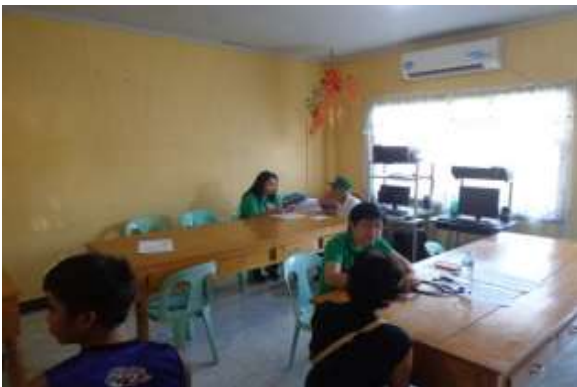
The Medical Team takes turn in providing accessible health services to patients of Aurora