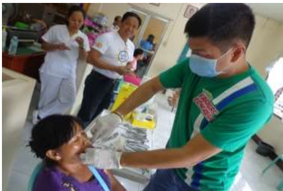
One of IPHO Dentists gently extracts a patient's tooth