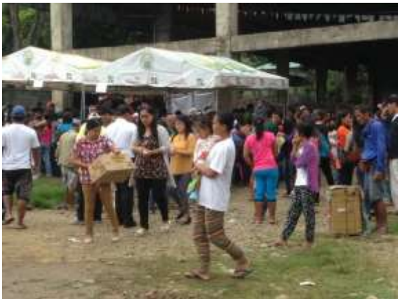
Throngs of people - 1161 Medical patients and 140 Dental patients assemble at the Community Center of Benito Soliven