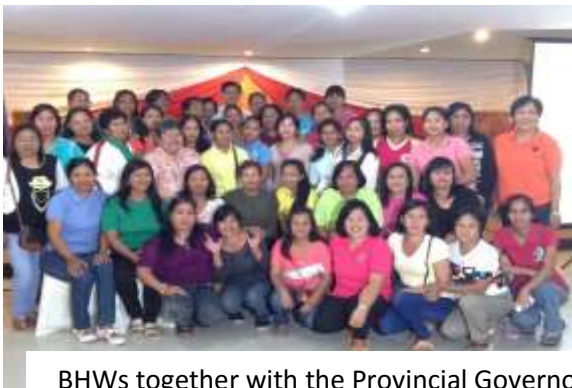
BHWs together with the Provincial Governor and the Provincial Health Officer II pose for souvenir photos