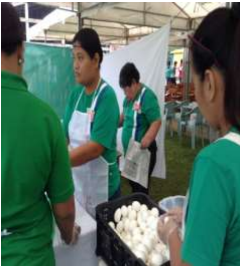
The BRO- LUSOG crew prepares Gourmix and chocolate milk drink for undernourished children of Benito Soliven