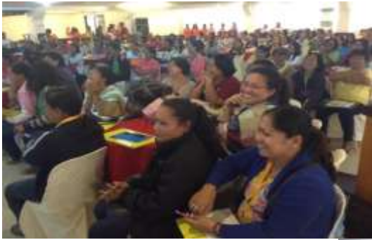
Participants listen to the Lecture