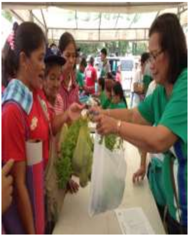
Mothers line up to receive seedlings from the Office of the Provincial Agriculturist