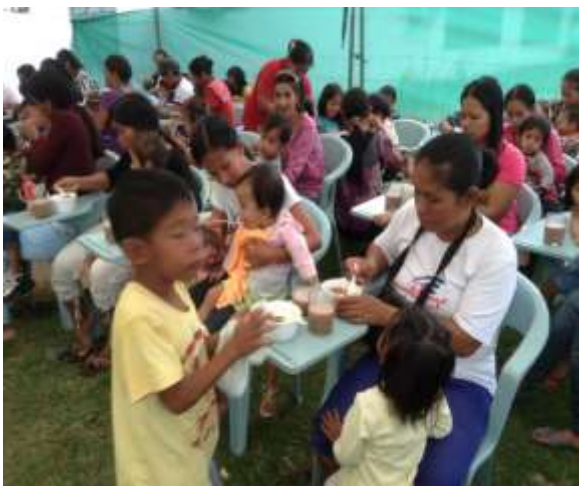
300 children finds contentment as they eat the prepared food