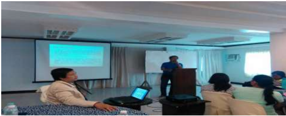
Provincial Rabies Coordinator discusses the importance of referral among animal bite victims for proper management and intervention during the Barangay Health Workers Training held on February 3-4, 2016

During the month of February, the Rabies Program of the Isabela Provincial Health Office – Field Health Services played a part in two general advocacy activities aimed at stressing the significance of Rabies awareness.