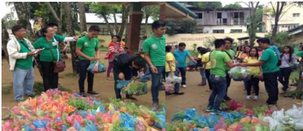
Distribution of seedlings to parents of identified malnourished children to sustain supply of nutritious food