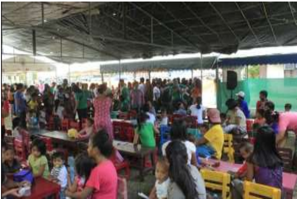
Parents of identified malnourished children while they wait for the feeding activity

In the month of February, the “Farmers Congress sa Barangay” was conducted in three municipalities, namely, San Manuel on February 2, San Mariano on February 4, and Benito Soliven on February 17. During these events, the residents were treated to a day of free medical and dental consultation/services, and the children were fed with nutritionally-balanced meal provided under the BRO-Lusog Program. Along with various government organizations that provided their respective social services to the people, the Provincial Health Office heads and staff contributed to the said event by assisting, admitting, and examining patients who lined up for health consultation.