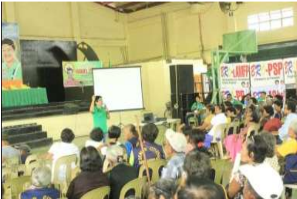
A PHO doctor gives a background of the BRO-LUSOG program