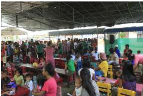
The BRO-LUSOG program in San Mariano caters to 750 children