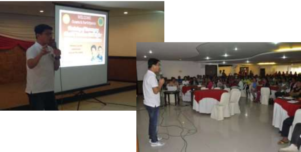
The Honorable Governor Faustino “Bojie” G. Dy III discusses their benefits they will expect to receive quarterly