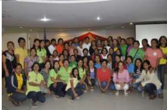
Officers of the BHW Federation of Isabela