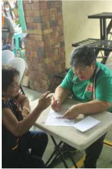
The Provincial Health Officers together with other PHO doctors examine patients' health concerns