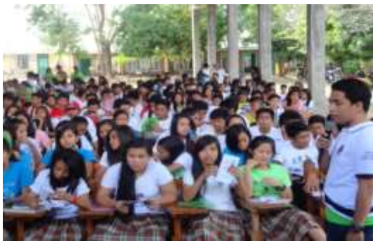
One of the nurses of PHO enlightens the students on Rabies awareness

The Provincial Rabies Coordinator answers questions from the students of San Pablo National High School during the School-Hopping activity on February 5, 2016