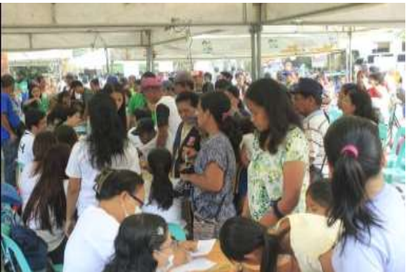
Hordes of people from San Manuel seeks out for health consultation