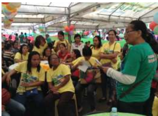
A PHO Nutritionist Dietician III meets up with the BHWs and BNSs of San Mariano to finalize Masterlist of malnourished children per barangay