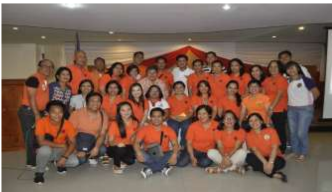
The Provincial Governor and representatives from DOH-RO2 with the IPHO Staff – the workforce behind the BHW Training