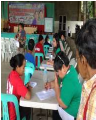
The Provincial Health Officers all hands-on in providing medical care to patients