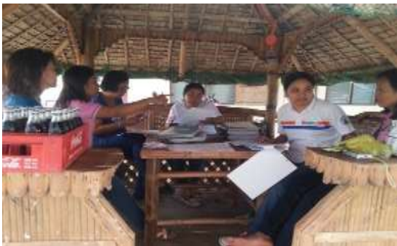
Evaluation at the municipal level with the Provincial Evaluation Team, MNAO, NO and representative of Dep Ed-Quirino