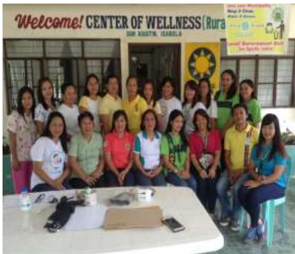
Everybody enjoys a fun moment of posing after the PIR