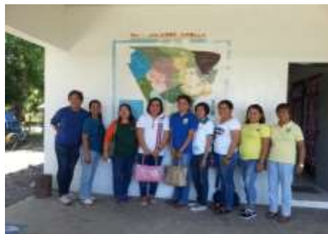
The Provincial Evaluation Team with the Nutrition Officer of San Isidro