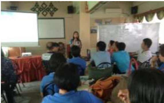
The Provincial DOH-RO2 team shares their expertise in their assigned topics