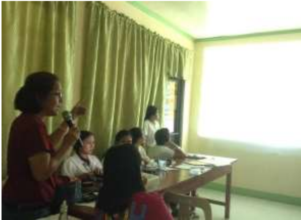
The Nurse IV from PHO provides insights regarding program management to attain better health outcomes .