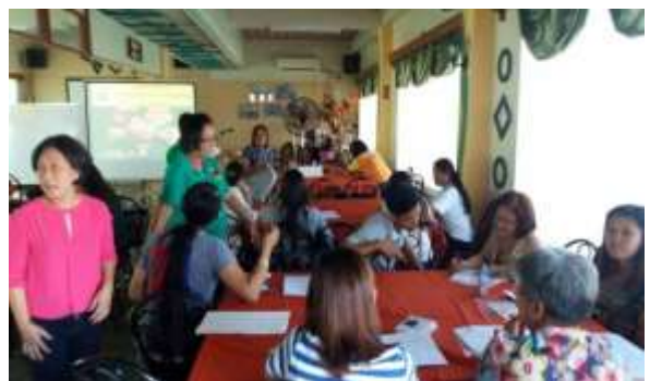
The Isabela Provincial Health Office provides technical assistance during the drafting of the action plan made by the participants.