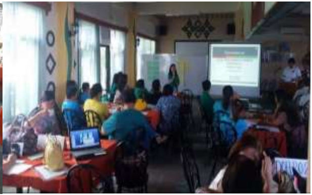
The Nurse II from the Provincial Health Office gives the objectives of the activity.