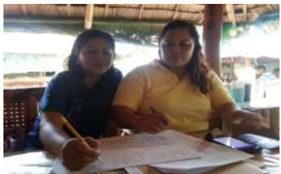
Dialogue of PNC Secretariat and Nutrition Officer of Tumauni during the evaluation.