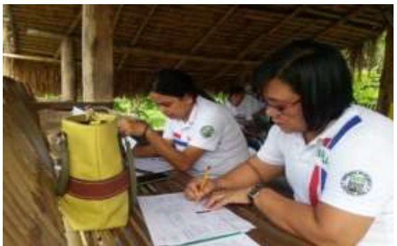
Representatives from Provincial Planning and Development Office and Provincial Social Welfare and Development Office evaluate the accomplishment of San Manuel.