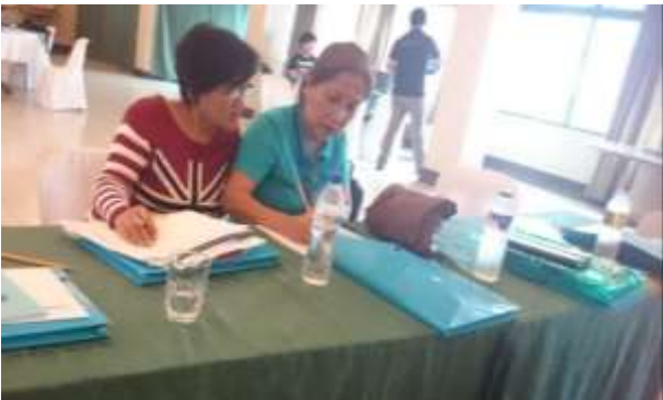
The Provincial FP Coordinator of Isabela together with the FP point person of Milagros Albano District Hospital devised the Hospital Action Plan on FP services