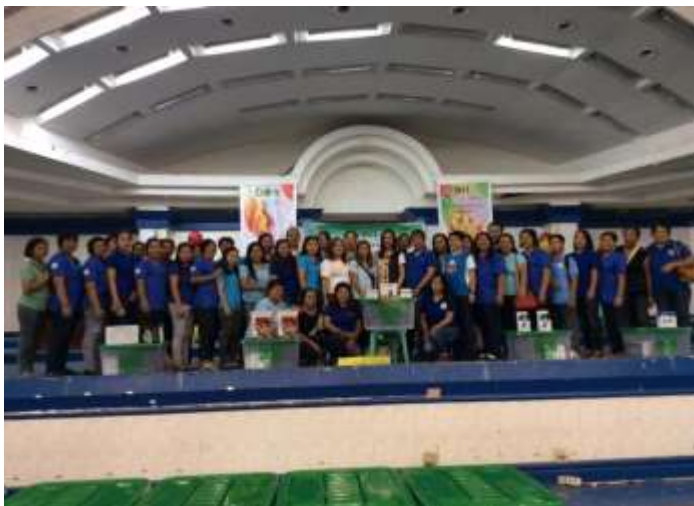
The organizers from the City Health Unit of Cauayan take a pose after the activity.