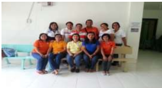
The Provincial Evaluators with the Municipal Nutrition Committee of Reina Mercedes