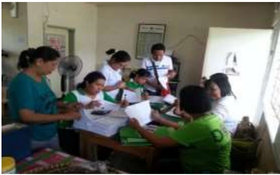
The Provincial Evaluation Team as they check the nutrition accomplishments of Mallig Municipal Nutrition Council.