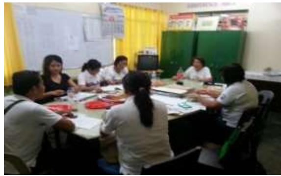
Feedbacking with the Municipal Action Officer of the Municipality of Aurora