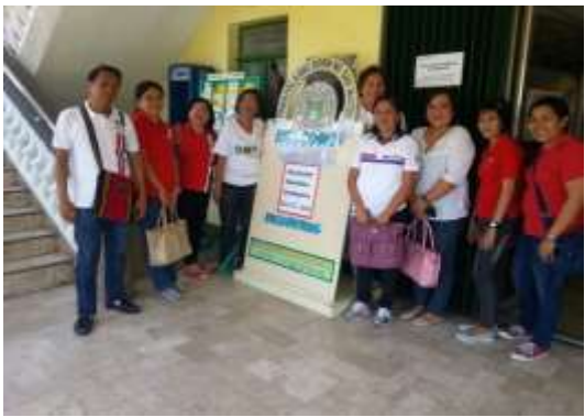
The Provincial Evaluation Team with the Welcome banner of the Municipal Nutrition Council of San Mateo