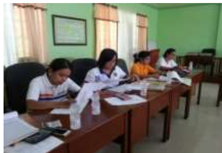
The Provincial Evaluators as they read and check the reports of Naguilian Nutrition Committee