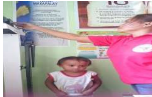
Actual weighing of Preschooler at Barangay San Marcos