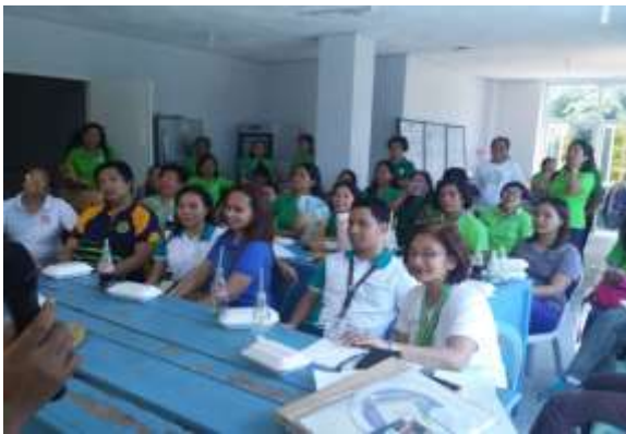
The DMO IV from DOH Regional Office together with IPHO staff analyse and guide the midwives in identifying their Strengths, weakness, opportunities and threats