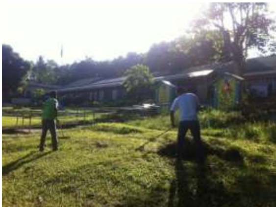
One of the activities is grass cutting.