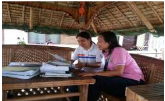
PSWDO representative evaluates the MNAO of Quirino.