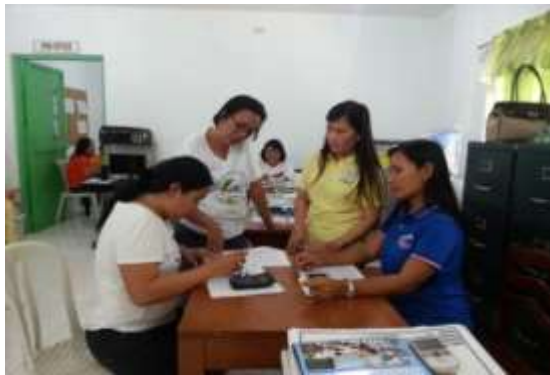
The Provincial evaluators with the District Schools Nurse and Nutrition Officer of Reina Mercedes