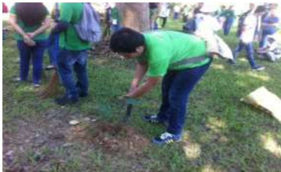
One of the highlights of the “ Brigada-Eskwela ” is the tree planting activity within the vicinity of the school