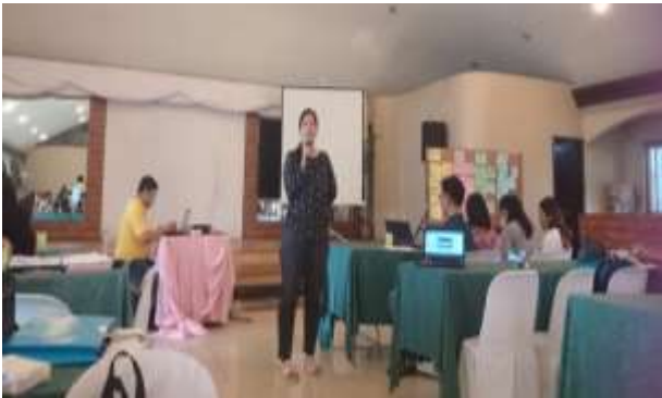
The Senior Policy & Health Systems Advisor from Luzonhealth gives the background on the proposed operational procedures and guidelines for recording and reporting of FP services