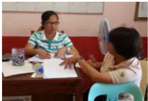
A representative from PVET asks the Municipal Veterinarian Office Representative some questions