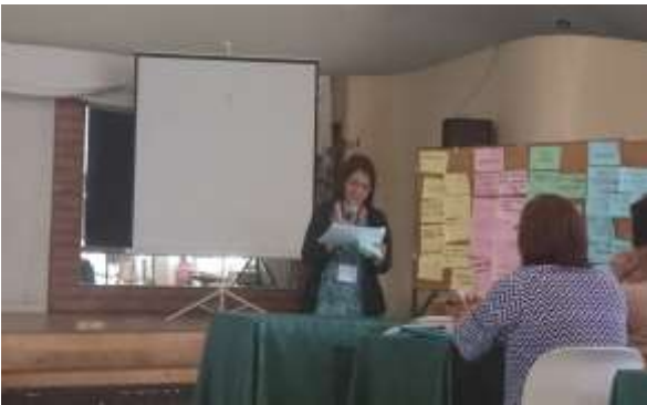
Family Planning Point Person from Southern Isabela General Hospital (SIGH), Santiago City presents to the group the updates on FP services in hospital implementation progress