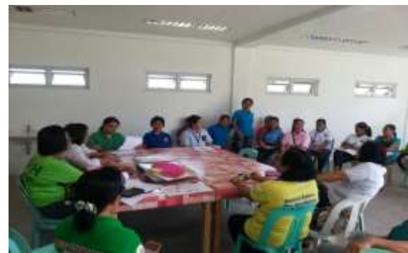
The Municipal Nutrition Committee and Barangay Nutrition Scholars of Quezon together with the Provincial Evaluators