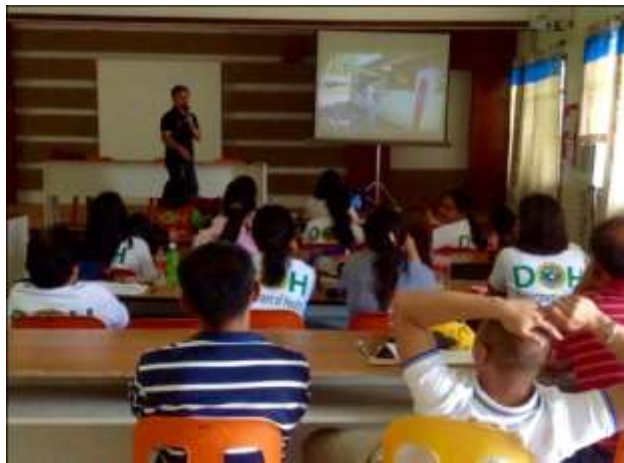
RHU Accomplishments by means of picture presentation by the TB aider.