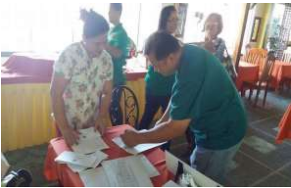
The City Health Officer of Cauayan City during the registration.