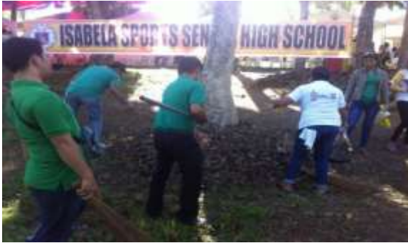
Staff of the Isabela Provincial Health Office helped in the rehabilitation of the school garden through weeding and cleaning of the school grounds.