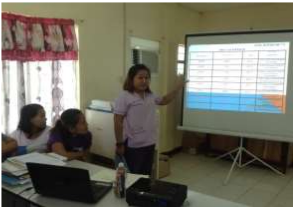
The PHN of San Isidro gives an overall report of program implementation