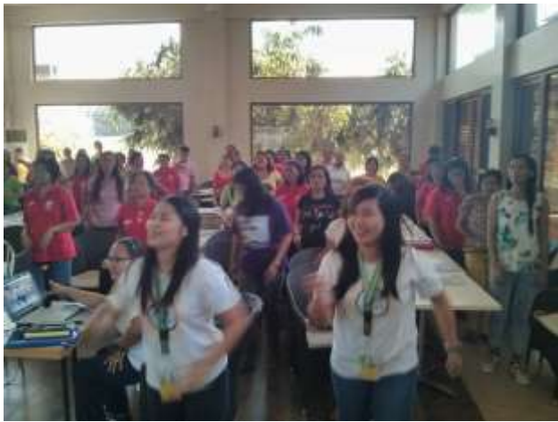
One of the highlights of the activity is promoting a healthy lifestyle. Here, the participants merrily do their “zumba” moves