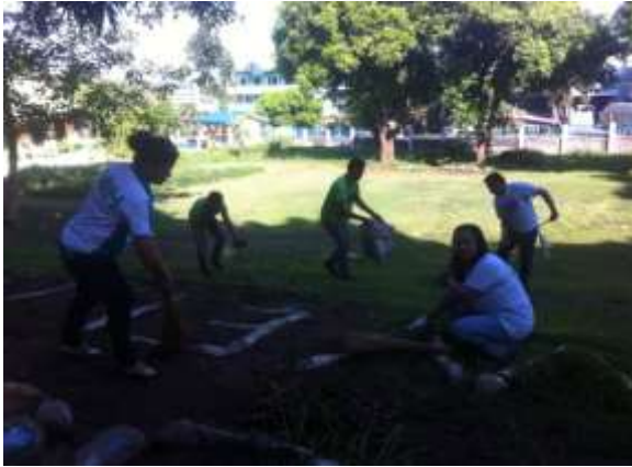
The IPHO volunteers contribute their time, effort, and resources in maintaining a safe, ready and healthy environment for the school opening by June.