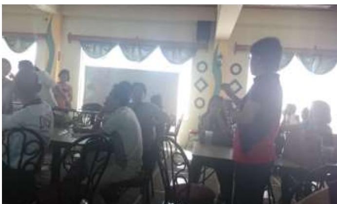
One of the PHO doctors clarifies her concerns in filling-up the LIPH templates