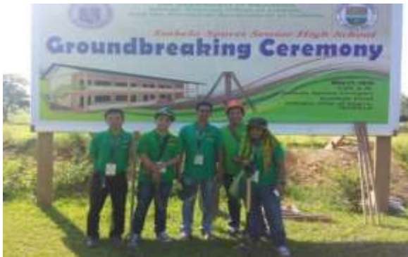
Groundbreaking of the proposed 20 classrooms of Isabela Sports Senior high school

Brigada Eskwela at first glance was the modern day “ bayanihan ” guided with the concepts of “ sama-sama ,” “ tulong-tulong ,” and “ pagkakaisa ”- traits that are unique in the Filipino culture. Brigada Eskwela 2016 stressed the importance of creating a school facility and environment that was built and maintained by the people, of the people, and for the people. It also magnified the idea that proper taking care of, and maintenance of school facilities and properties are not the sole responsibility of the school administrators and its personnel but that of the whole community. With this noble aspiration, the Isabela Provincial Health Office participated once again in the activity to contribute towards a healthy learning environment for all young Isabeleño!