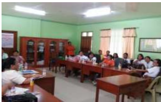
Feed backing with the Nutrition Committee of Naguilian after the evaluation