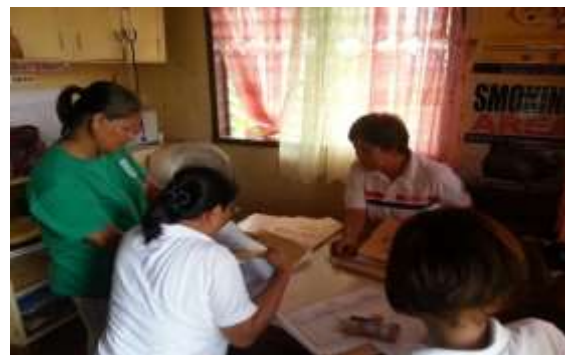
The Evaluators checking the accomplishments of the Barangay Nutrition Scholar of Sandiat East, San Manuel