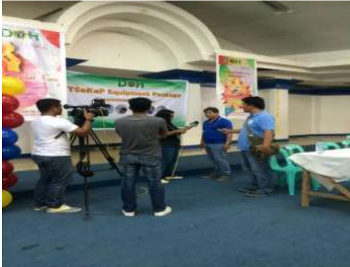
ABS-CBN staff interviews the Department of Health Regional Director during the event.