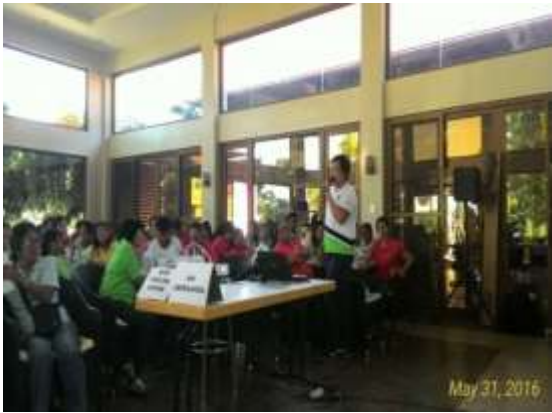
The Technical Team from the Isabela Provincial Health Office lectures and gives the latest updates on various health programs to the Barangay Health Workers of Aurora, Isabela