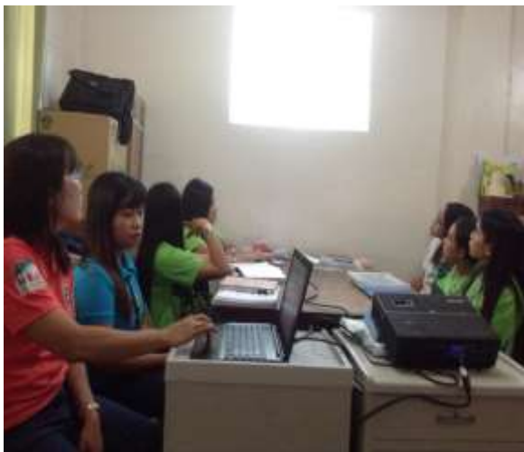
The RHU staff critically studies their loopholes in the implementation of their health programs.