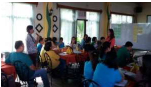
Ongoing question and answer portion after the informative lecture on Joint Memorandum Circular I, s. 2007.