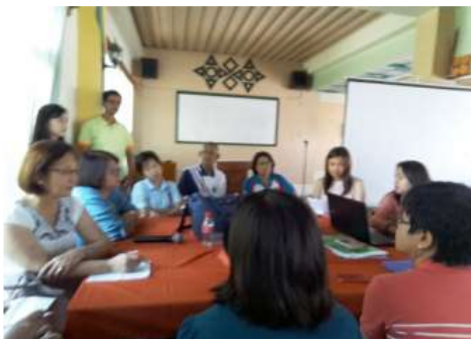
Immediately after the orientation, the DMO V and Administrative Officer III of Isabela Provincial Health Office conduct Facilitator's Meeting to determine areas to be sustained and those needing improvement.