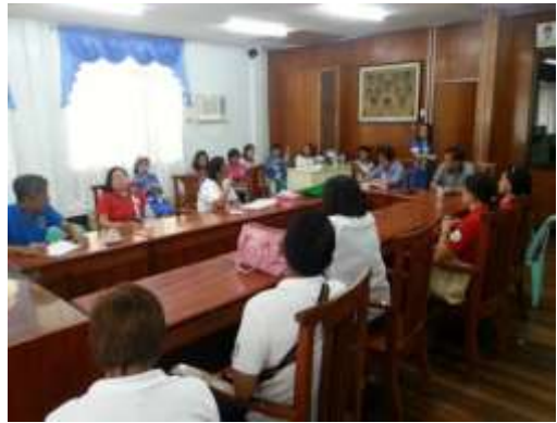
The Provincial Nutrition Committee-Secretariat as she gives a summary of the evaluation to the Municipal Nutrition Council.