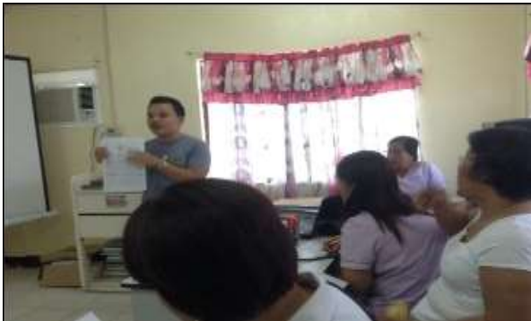
The TB Raider presents the TB program implementation of San Isidro.