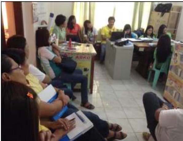
The Nurse supervisor of San Agustin presents the over-all accomplishment of the RHU