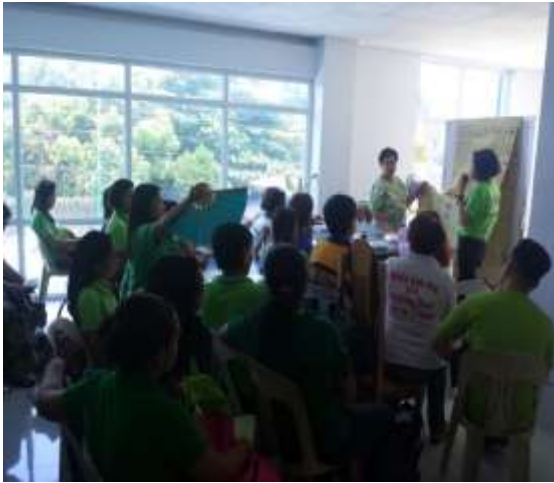
A midwife in Cabisera 14-16 presents her accomplishments for the calendar year 2015.