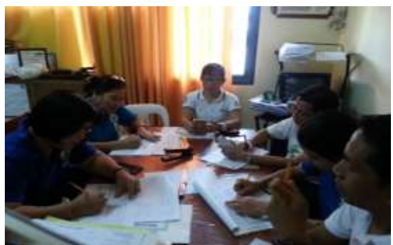
The Evaluators check the reports of San Pablo Municipal Nutrition Council