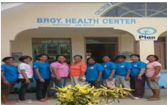
The Barangay Health Workers and Barangay Nutrition Scholar of San Mateo, Quirino with the Provincial Evaluators