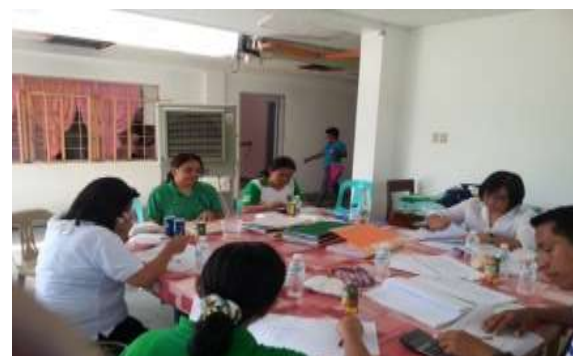
The Evaluation Team as they check the reported accomplishments of nutrition in the Municipality of Quezon