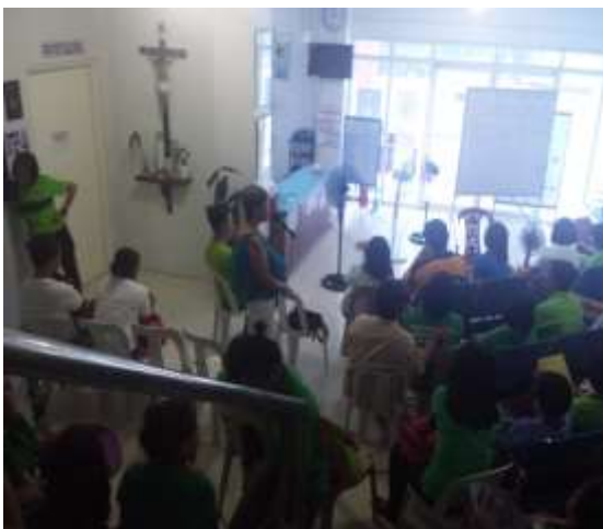
The City Health Officer delivers her opening remarks to the CHO staff and technical assistance group.

Program Implementation Review is one of the strategies of IPHO in order to determine status of the different health programs in terms of management and achieving national standards. Last May 12, 2016, the City Health Office II-Ilagan conducted their first program implementation review to reflect on their accomplishments where every midwife as a frontline worker presented their respective accomplishment per barangay. The activity paved the way to better institute mechanisms by way of the recommendations given by the PHO team. The attendance of the BHWs made the activity meaningful as they are the partners of the health workers in delivering key health messages in the community.