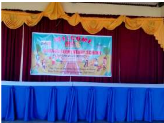
Welcome poster for the kick-off campaign of “Brigada Eskwela” at Alibagu Elementary School.

By virtue of an official communication from DepEd and forwarded by the Office of the Provincial Governor for its full and active participation by all departments, the Isabela Provincial Health Office staff enjoined to support such noble activity and thus adopted Alibagu Elementary School for Brigada Eskwela 2016 on May 30, 2016. Volunteers from the Isabela Provincial Health Office performed minor maintenance work such as rehabilitation of the school garden, weeding and improvement of the school grounds.