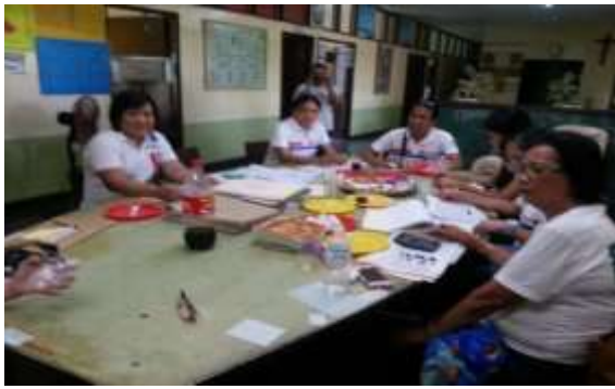
The Provincial Evaluators listen to the Municipal Action Officer of the Municipality of Aurora