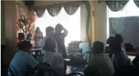
The Provincial Health Officer II delivers her inputs during the open forum