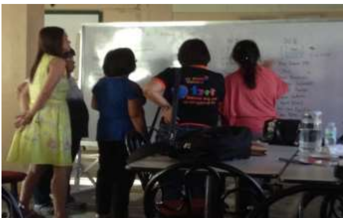
Creation of Provincial Technical Assistance LIPH Planning team per district