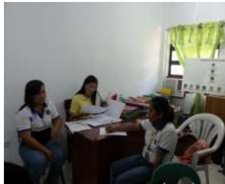
PPDO representative ask the Nutrition Officer and a representative of MSWD some questions during the evaluation in Reina Mercedes