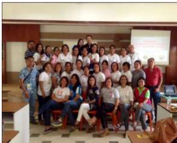
The RHU staff of Echague strikes a pose with he technical team after the PIR