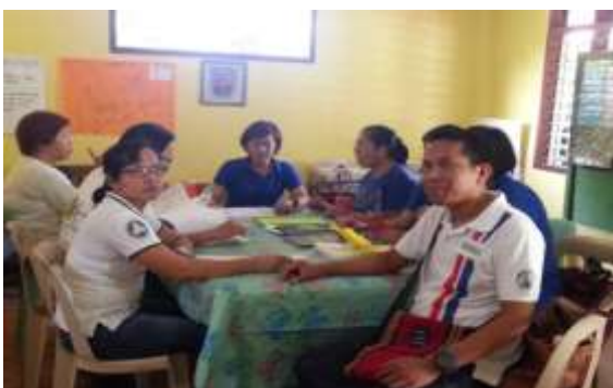
The Provincial Evaluators at Cabagan, Isabela