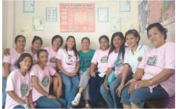
The IPHO technical team with the Barangay Nutrition Scholar and Barangay Health Workers of San Jose Norte, Mallig with the IPHO