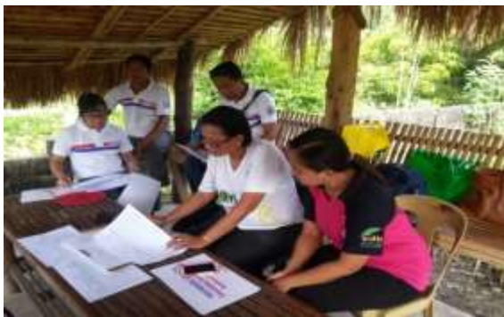
Provincial Evaluation Team with the Municipal Action Officer during the evaluation at San Manuel