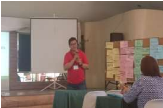
Representative from LuzonHealth –North Cluster discusses to the participants the rationale and overview of the workshop