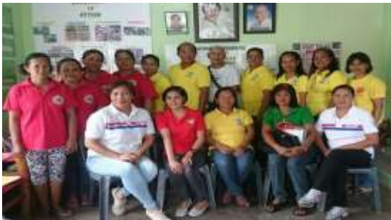
Barangay Nutrition Council of San Marcos with the evaluators