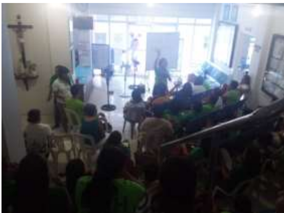
During the open forum facilitated by the DMO IV