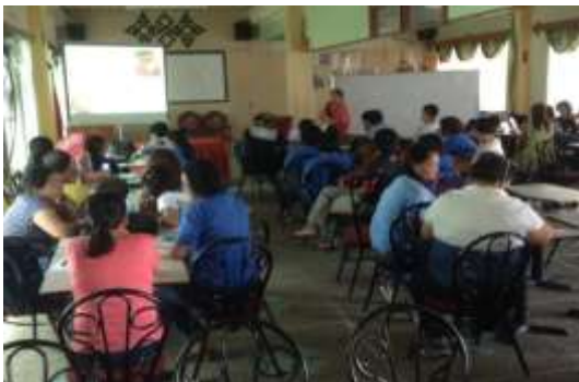
The PHO Administrative Officer discusses the background of the orientation