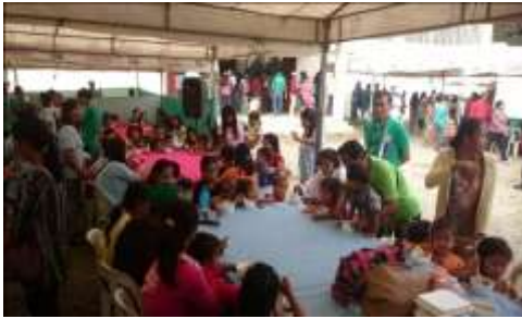
Mothers fervently wait for the Gourmix that the BRO-LUSOG pointpersons serve