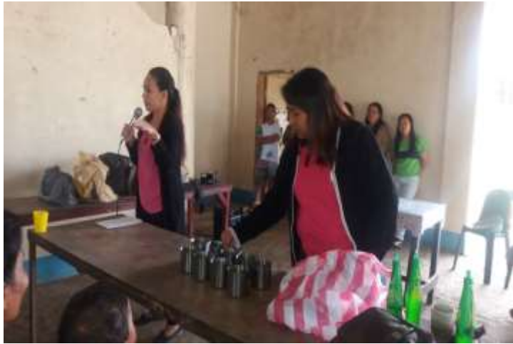
The PHO MCH Coordinators during the Q&A portion where prizes are given to the participants