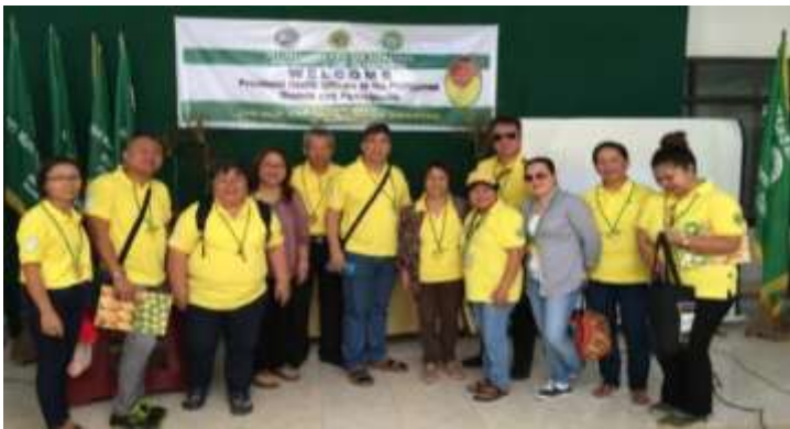
The country’s Provincial Health Officers meet at Jordan, Guimaras and inspect its health service delivery network