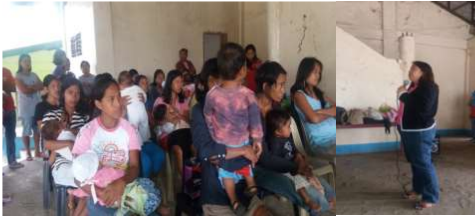
The participants actively listen to the insights from the Provincial MCH coordinator on Safe Motherhood