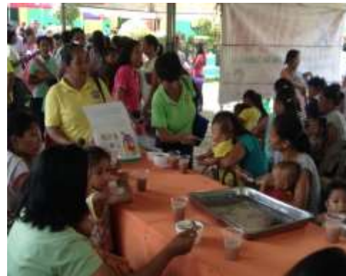
Time well-spent. A BHW Trained on Promote Good Nutrition – Infant and Young Child Feeding conducts advocacy among the mothers at the BRO-LUSOG corner