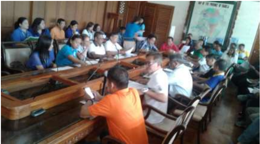
Participants in the meeting actively participated in the discussions