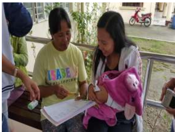
Actual interaction of RHU midwife with a client during the interview