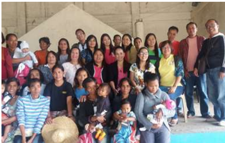
Souvenir picture of the participants together with the Barangay leaders, City Health Office I health workers and the team from the Provincial Health Office