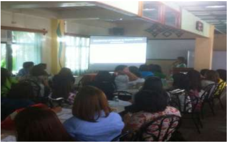
The National Drug Policy Officer informs the status of drug deliveries and utilization reports