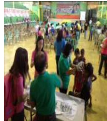
The Medical and Dental team unconditionally caters to the countless constituents of Tumauini, Isabela