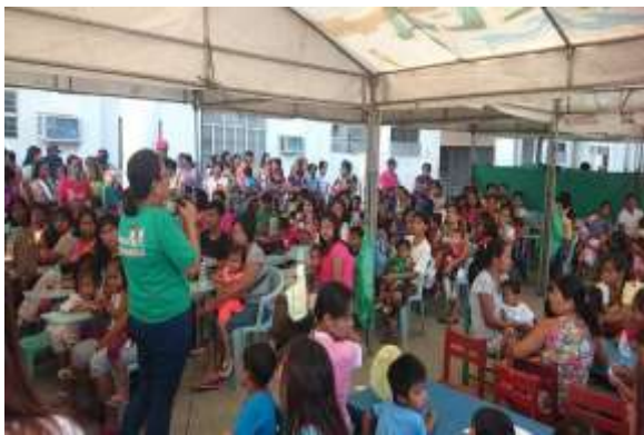
The PHO- Nutritionist Dietician III gives a brief lecture about “Gabay sa Tamang Pagpapasuso at Pagpapakain ng mga Bata” (Infant and Young Child Feeding) to mothers of Cabagan, Isabela, while they wait for the feeding activity to begin