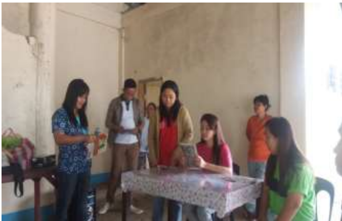
The health workers from Cauayan City Health Office 1 during the role play promoting “Safe Pregnancy and Facility-based Delivery”