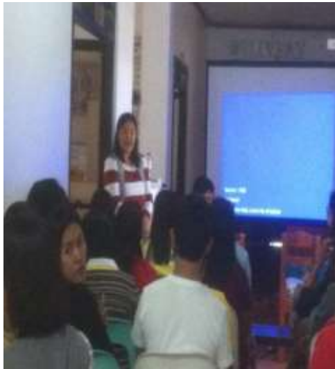
Representative from the Luzon Health discusses the rationale of the two (2) day seminar/training among the participants