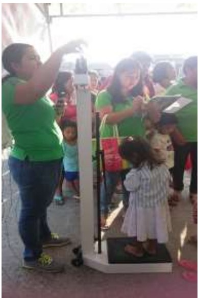
IPHO staff, BNS and BHWS of Cabagan, Isabela confirm heights and weights of children