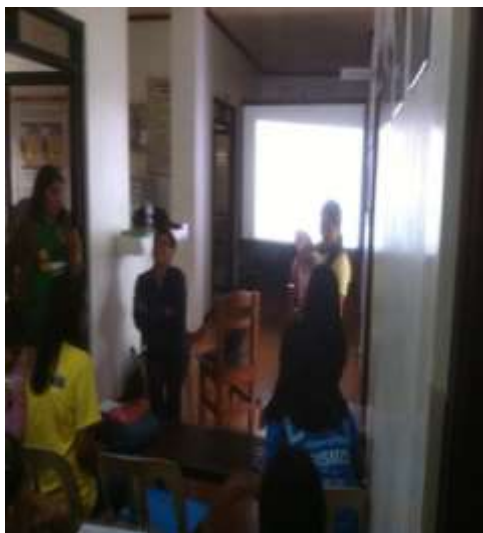
A health worker role-plays based on the given scenario while the Provincial EPI coordinator takes note of her observations