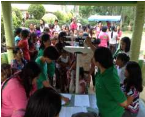
The usual validation of weights and heights of undernourished children of Tumauini