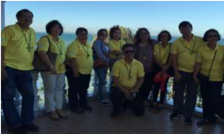
Some Provincial Health Officers all over the country during their environmental scanning in Guimaras