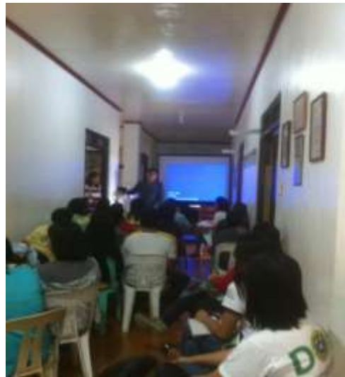
Ongoing lecture on Integrating FP and Antenatal Care into the Expanded Program on Immunization Services by Provincial Health Program Officer III from Luzon Health