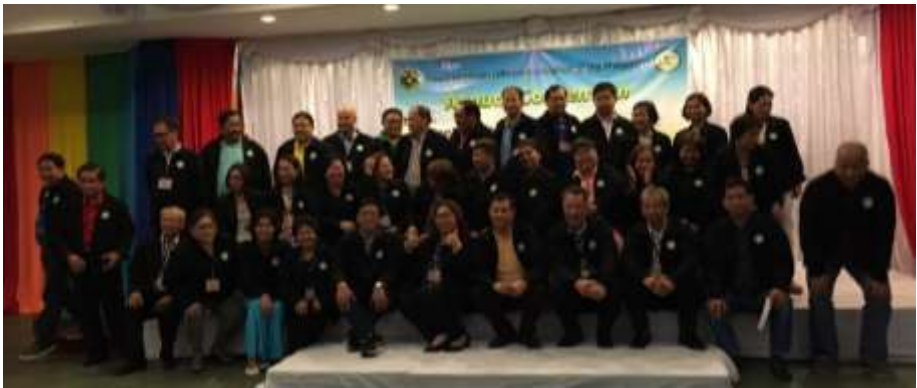
Some Provincial Health Officers all over the country pose for the year’s National Convention