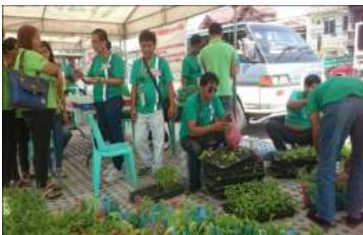
The Provincial Nutritionist-Dietician facilitates the distribution of seedlings for identified parents whose children are undernourished thru the BNS with a help from the Department of Agriculture.