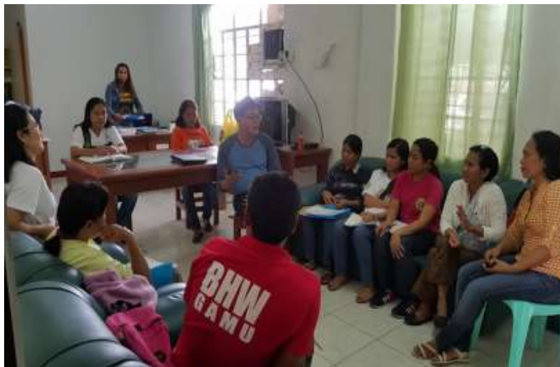
After the 2-day training, the Provincial Health Program Officer III of Luzon Health and the Supervising Nurse from the Provincial Health Office evaluate the learning of the participants through feedbacking