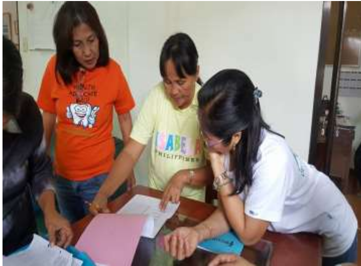
Proper filling up of forms by the midwives in the RHU with the Supervising Nurse from the Provincial Health Office