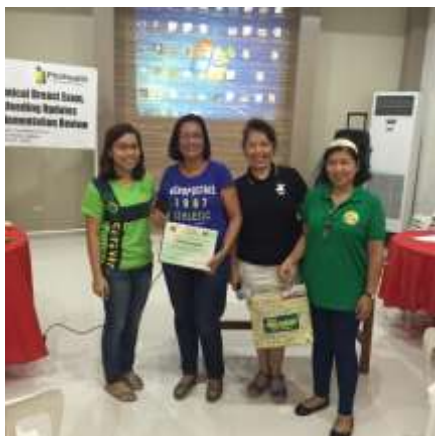
The Provincial Nutrition Coordinator after her lecture on the updates of breastfeeding poses with the RHU staff for her Certificate of Appreciation