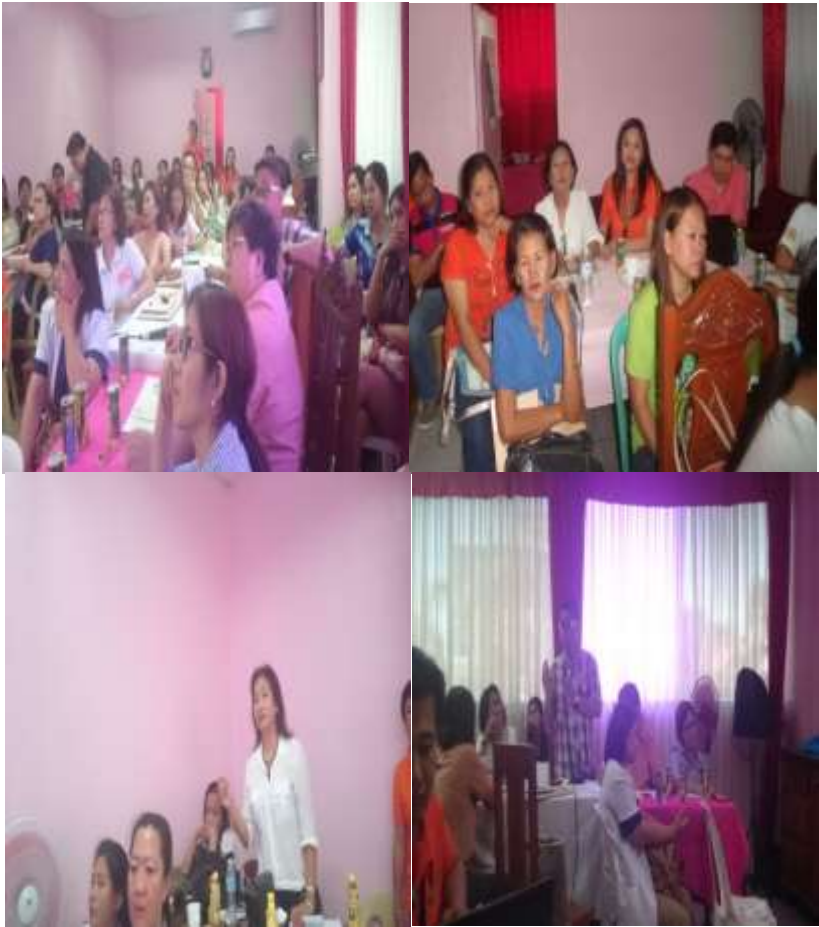
The Provincial Maternal Death Review Committee (PMDRC) together with other health workers critically evaluates the cases presented.