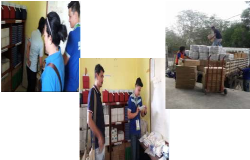
The PHO Surveillance team receives logistics from DOH-RO2 for the nearby barangay of Nungnungan 2, Cauayan City last March 7, 2016