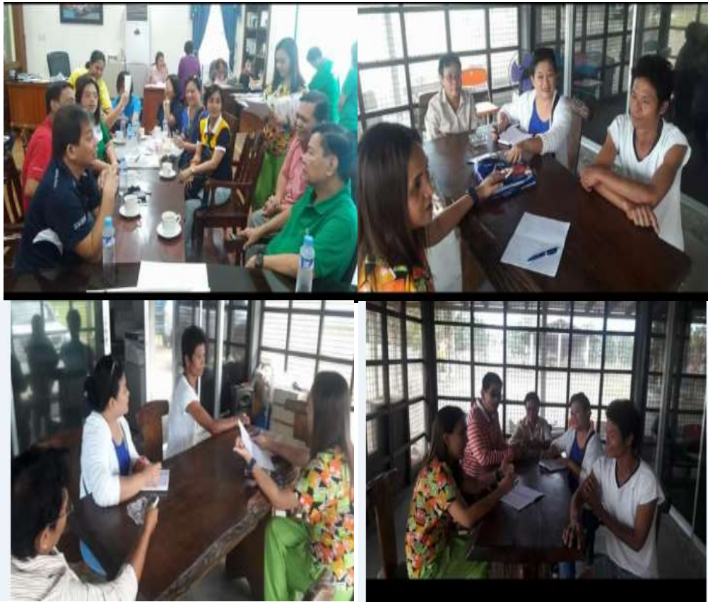
Courtesy call to City Health Officer of CHO I at Cauayan City Isabela, City hall and investigation of the case with the DOH-RO2 headed by Regional Director and company last February 12, 2016