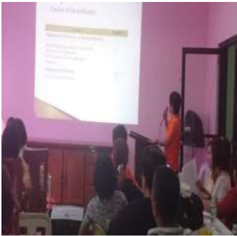
Presentation of the synthesis and next steps by one of the PHO team after intensive evaluation of all cases