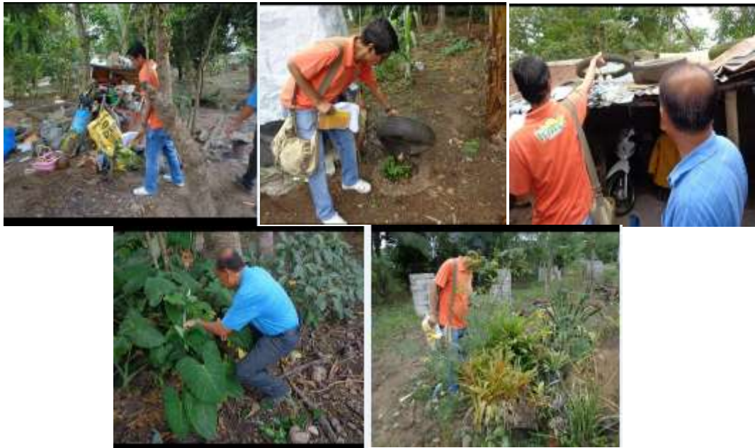
Conduct Vector Surveillance and IEC in the barangay by PHO staff last February 15-16, 2016