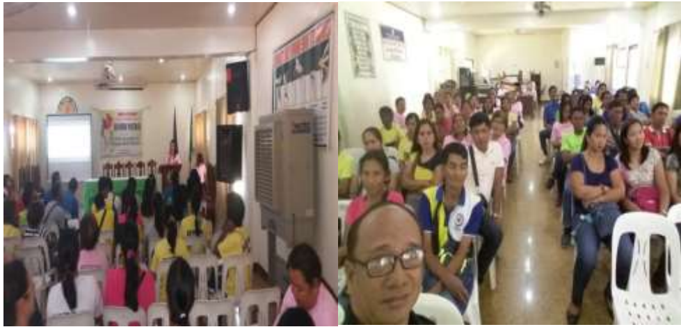
The MHO of San Mariano greets the participants before the presentation of the local situation last April 22, 2016.