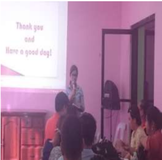
A member of the PMDR Committee delivers the closing remarks