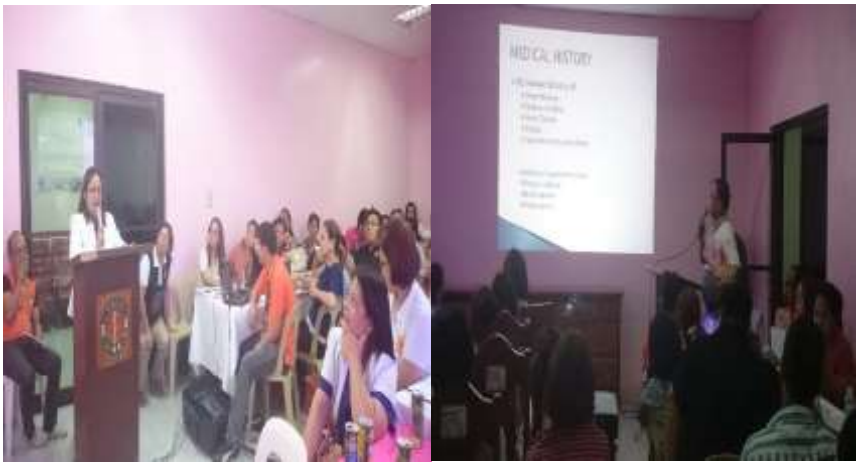
Presentation of cases for review by the respective MHOs.