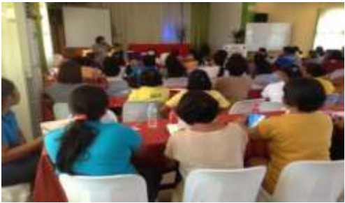
The Sexually Transmitted Infection (STI) Provincial Coordinator presents to the BHWs the latest trends and updates on HIV/AIDS