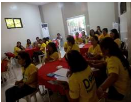
The energetic RHU staff listens attentively during the 2 day Orientation Program