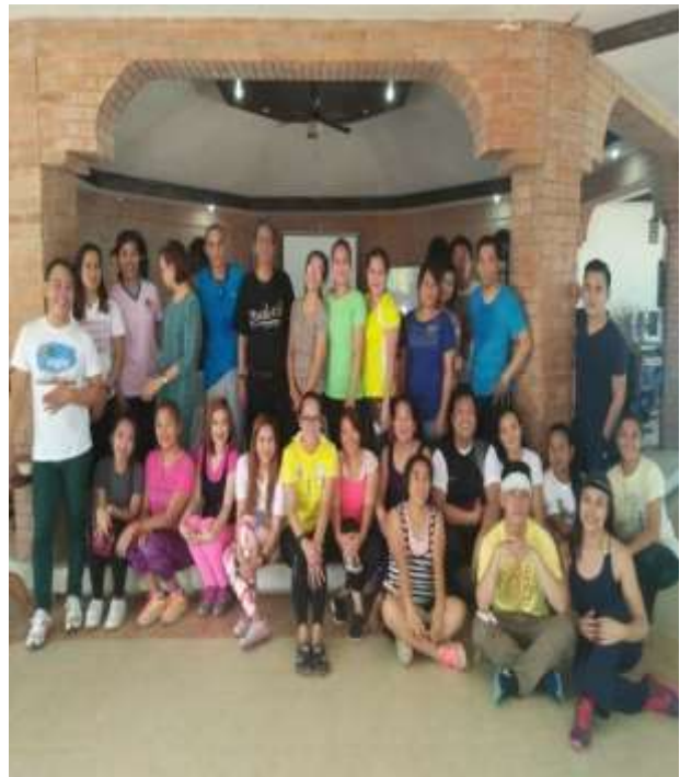
The Healthy Lifestyle MOVERS poses with the Asst. Regional Director of DOH Region 2