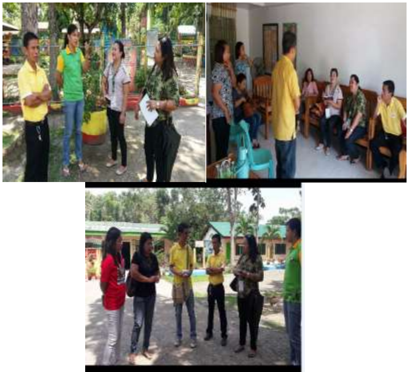
Environmental Monitoring and Measuring of school windows and doors in the different elementary schools in the nearby barangays of the case for treated curtains to be distributed last March 11, 2016