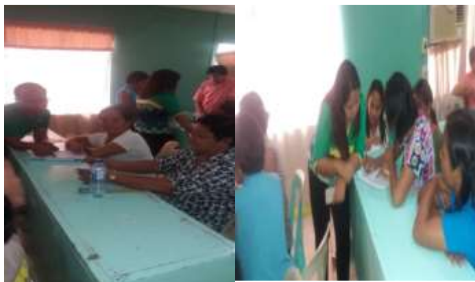
The MNCHN coordinator and HEPO II from PHO mentor the participants in making their action plan for Buntis Patrol at Tumauni, Isabela last April 19, 2016

With the presence and active participation of the local leaders, it is expected that it shall pave the way in increasing their involvement towards patrolling and tracking pregnant women especially the teenagers to empower them in seeking prenatal, early detection of danger signs and post-partum care that will significantly lead to reduction of deaths.