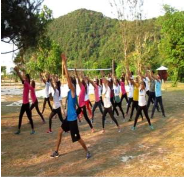
The dancing guru leads the HL MOVERS in filming the physical activity at Anguib beach, Sta. Ana, Cagayan, as a final output for roll out purposes to the different LGUs of the participating municipalities of Region 2