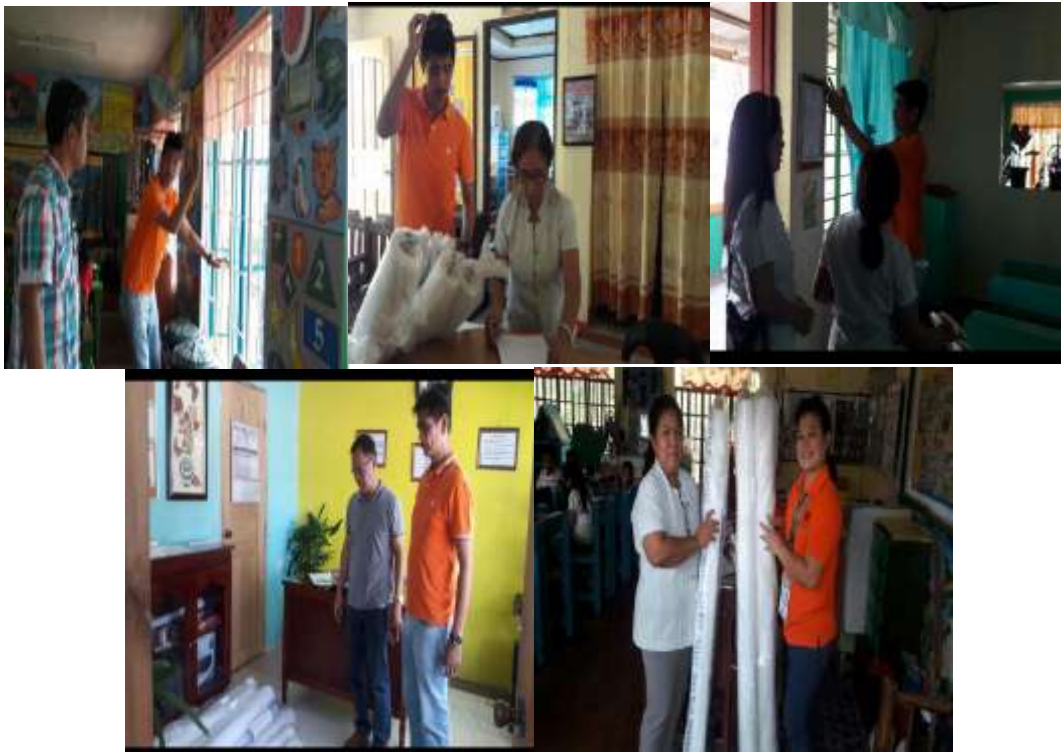
Distribution of mosquito nets at 4 barangays of Nungnungan 2, March 16, 2016