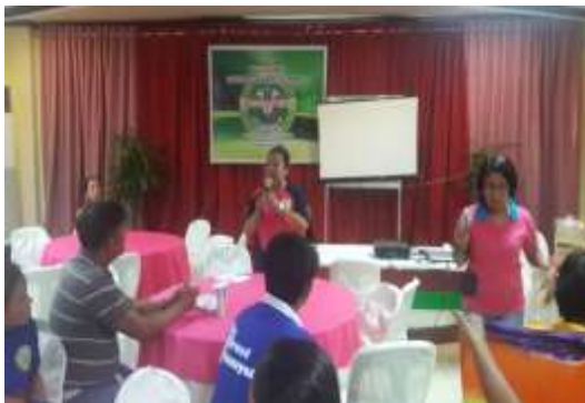
Interaction with barangay officials at Cauayan CHO 1 & 2 during the planning session last April 20-21, 2016