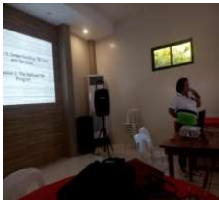
The Provincial TB Coordinator talks over to the group the National TB Program of DOH

The 2-day orientation aims to update and better improve the skills as well as attitudes of all health workers in performing their tasks such as breastfeeding program including breast exam and updates on the TB DOTS. After the update, the Health Program Implementation Review proceeded.