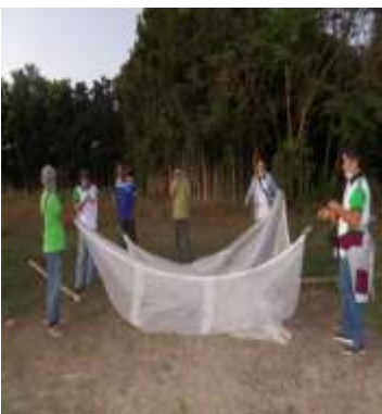
DOH-RO2, Provincial Health Office and Barangay Officials perform Carabao Bait Trap last February 23, 2016