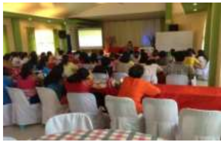
Integrated Management on Childhood Illnesses (IMCI) Coordinator lectures participants on illnesses affecting children