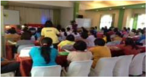
BHWs and PHO – FHS coordinators exchange questions and clarifications during the interactive forum