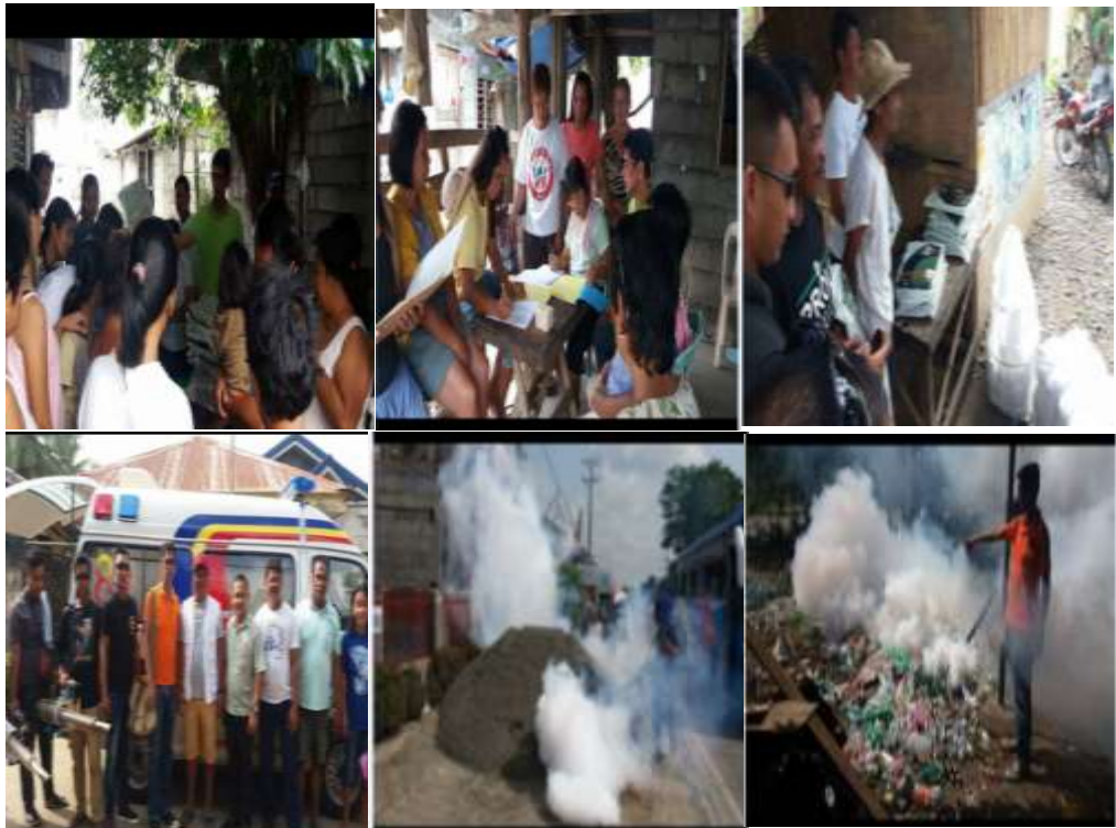
Distribution of Mosquito net/ treated curtains and fogging at Barangay Faustino, Nungnungan I, Minante 2 and Sillawit Cauayan City, Isabela March 1, 2016