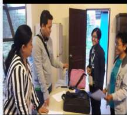
DOH Medical technologists, PHO and CHO staffs conduct blood survey in the affected barangay last February 16, 2016