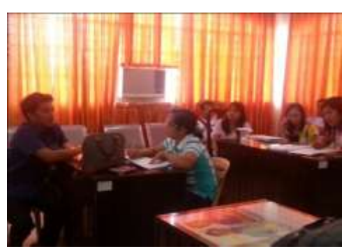
Dialog between the Representative from PVET and Municipal Veterinary Office of Cabatuan, Isabela