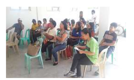
The MCH Coordinator of IPHO acknowledges the vital roles of the barangay officials in attaining a healthy community