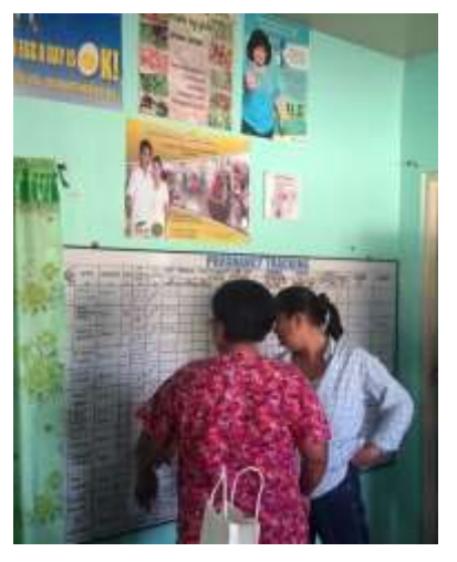
The midwife of Brgy. Songsong, Gamu, Isabela discusses the Pregnancy Tracking System implemented in their barangay