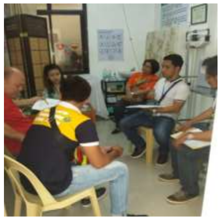
The Evaluation Team interviews the CHO/RHU Nurses as they present and explain their respective reports