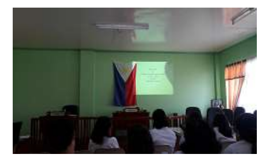
Program Implementation Review of Naguilian with the MHO who takes the lead

A representative from the DOH – RO2 shares her expertise and views on different health programs