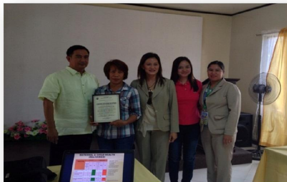
The Hon.Barangay Captain of Disulap receives an award for their active implementation of Brgy Resolution supporting Facility based Deliveries given by the LGU.