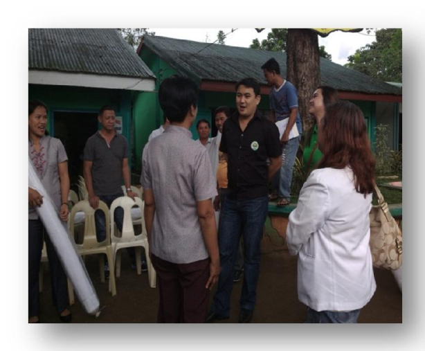
Mayor Dy instructs the School Principal on how the Olyset can be used as a screen to protect entry of mosquitos.

To date, a total of 15 elementary schools now enjoy the benefits of the insecticide-treated curtains while actively taking part of the different learning opportunities offered by their teachers.