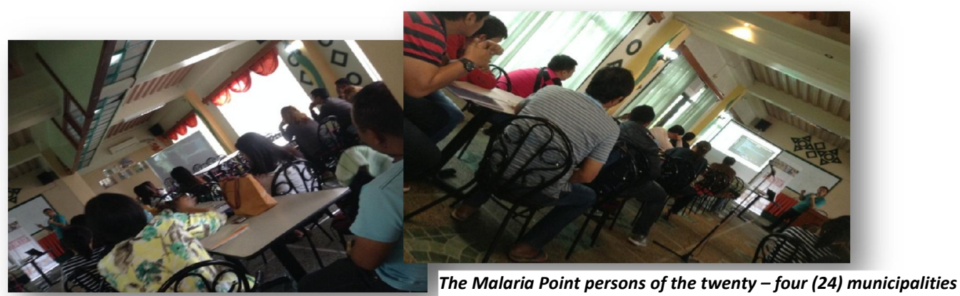
The Malaria Point persons of the twenty – four (24) municipalities listen during the meeting.

delays in generating required local malarial information